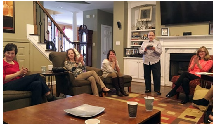
Photos below from the Men's Club World Wide Wrap Event.