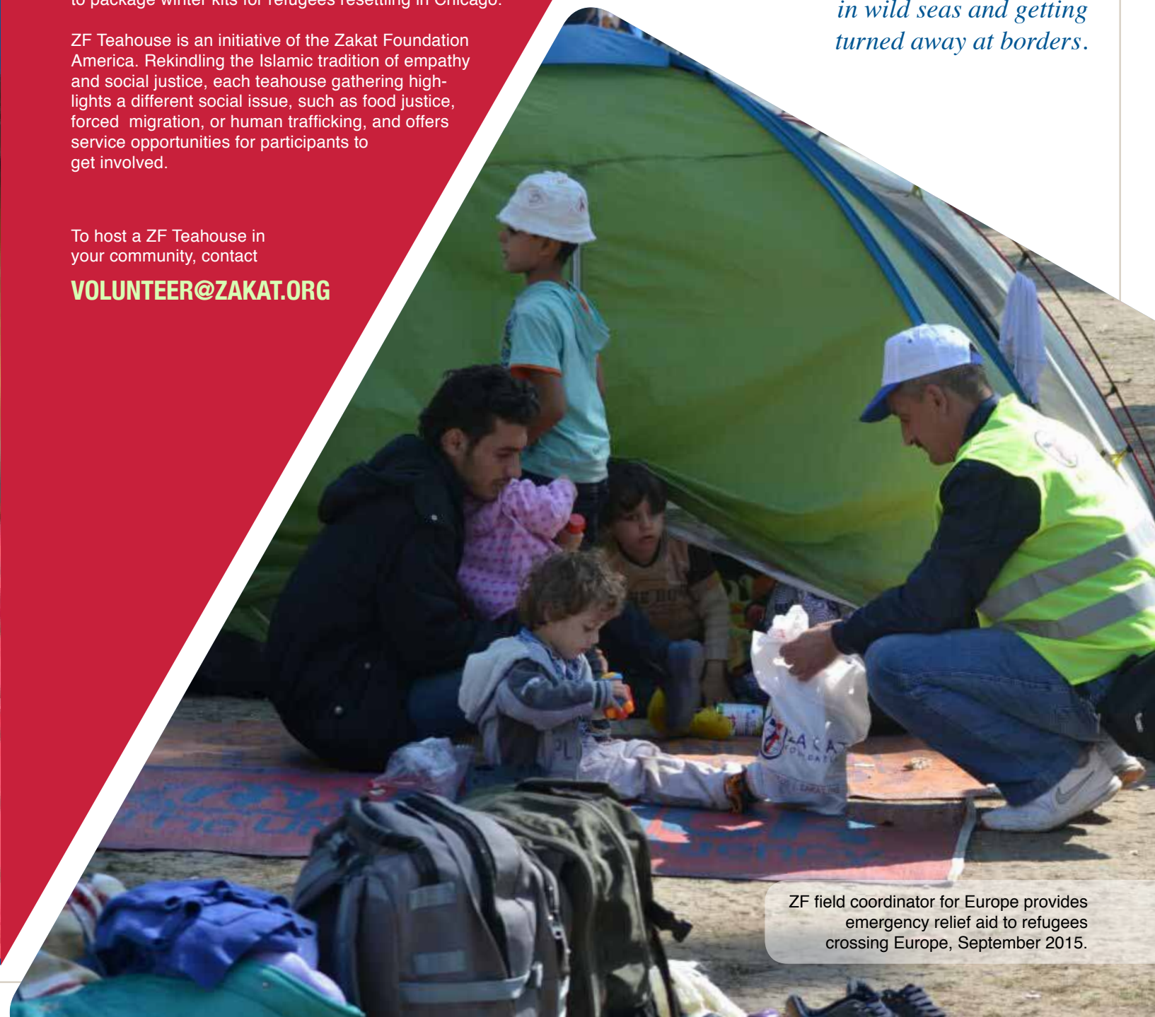
ZF field coordinator for Europe provides emergency relief aid to refugees crossing Europe, September 2015.

Muhammad (pbuh) was a refugee. Just as he was forced to flee his beloved homeland out of fear of persecution and violence, today there are over 20 million refugees worldwide taking perilous journeys in wild seas and getting turned away at borders.