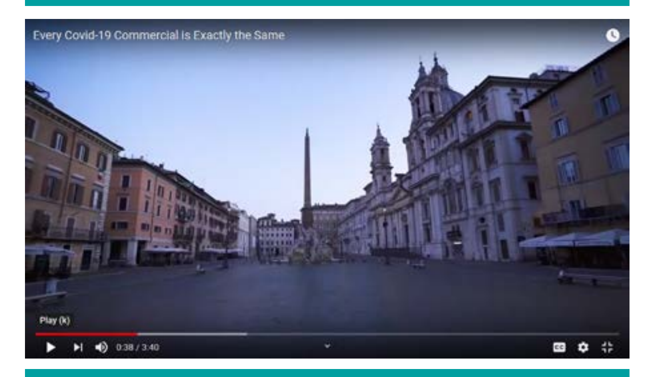
Figure 3 Every COVID-19 commercial is exactly the same