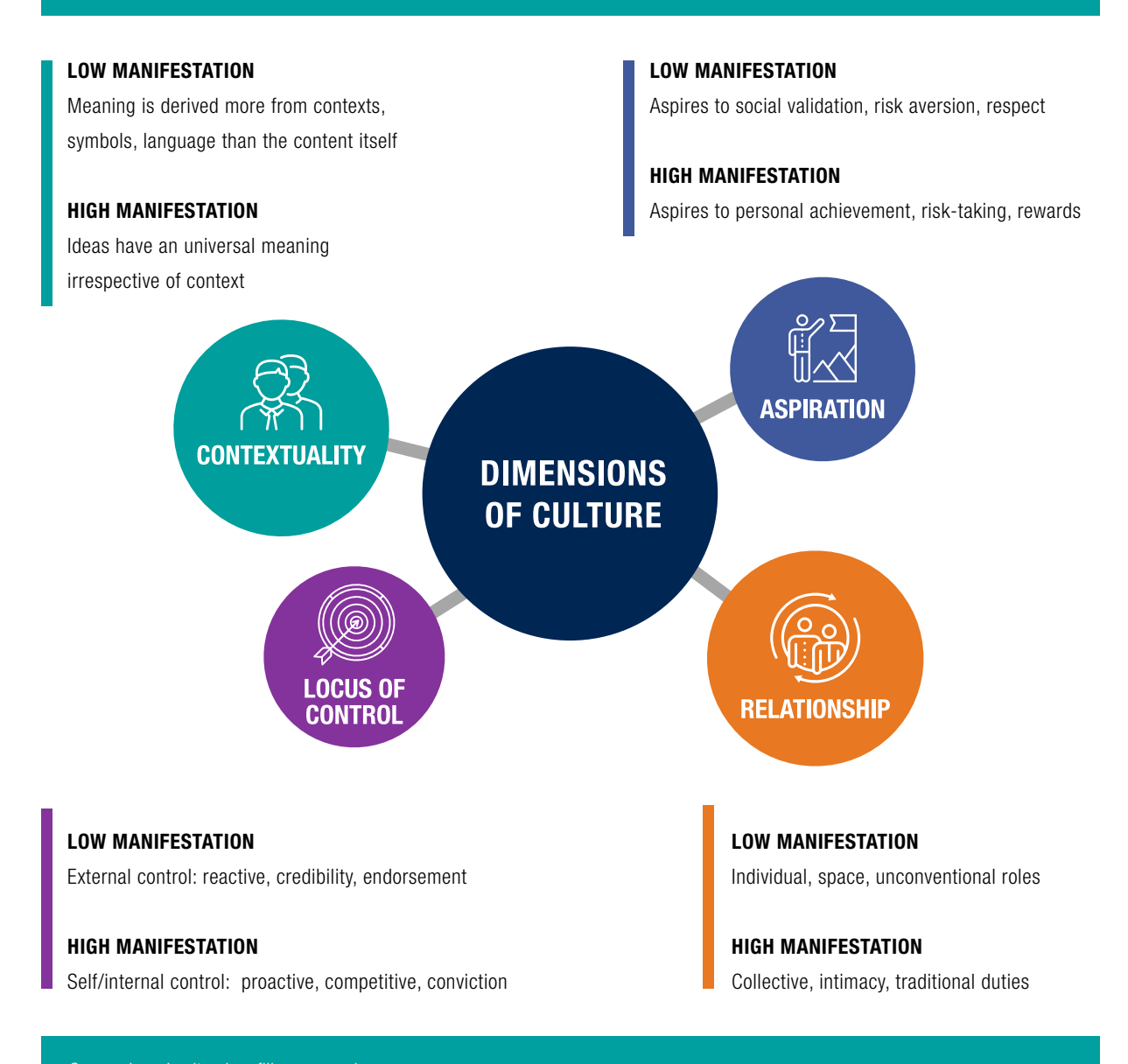
Figure 5 Mapping dimensions of culture