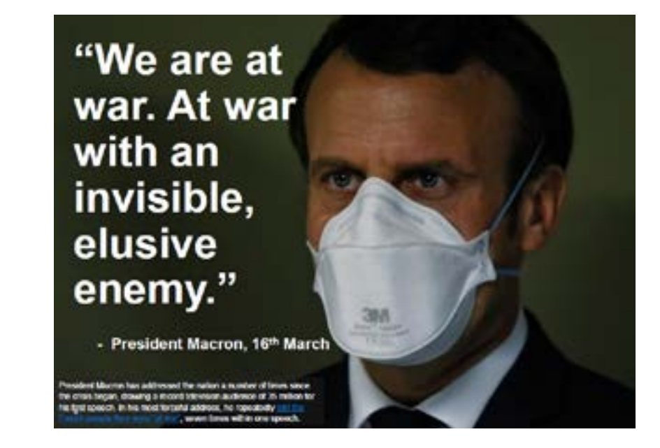
Figure 1 The war analogy in COVID-19 communications