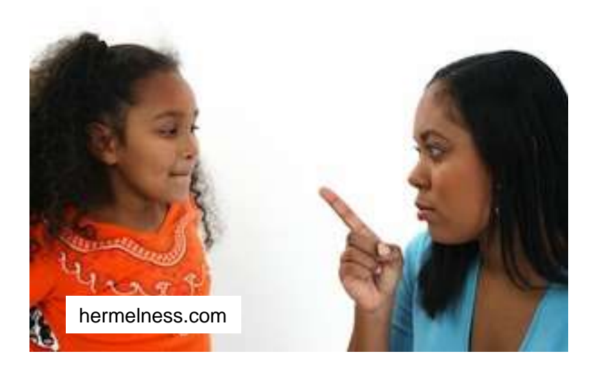
WHAT ROLES ARE USUALLY PLAYED BY PARENTS?