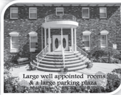
Large well appointed rooms & a large parking plaza

Proud Parishioner of St. Ambrose R.C. Church