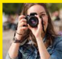
Tours and Guided Visits