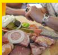
Culinary Adventure Tours