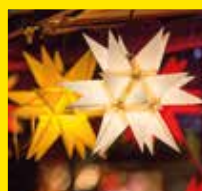
Advent, „Christkindl“ and Christmas Markets