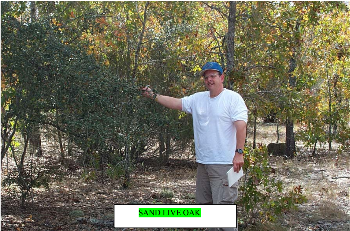
SAND LIVE OAK