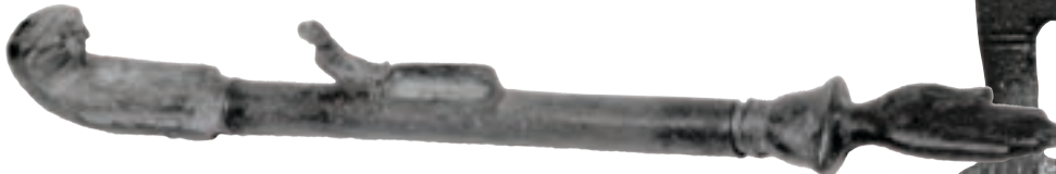
This incense burner was used during rituals in an ancient Egyptian temple.