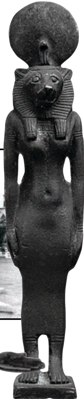
Sekmet statue – RC1 – the first artifact in the collection that would become the Rosicrucian Egyptian Museum.