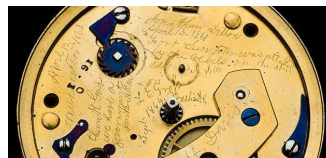
The Lincoln Watch