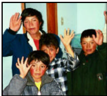
A team of 12 people . . . performed 130 operations.