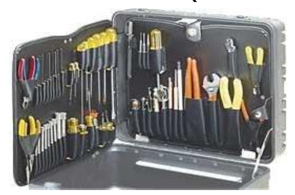
Pallet # 23-945