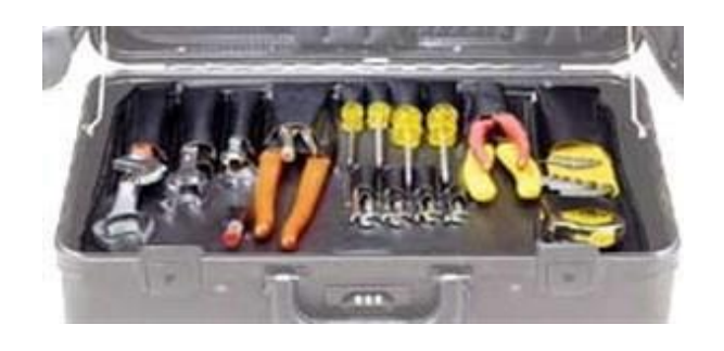
Pallet # 54-801