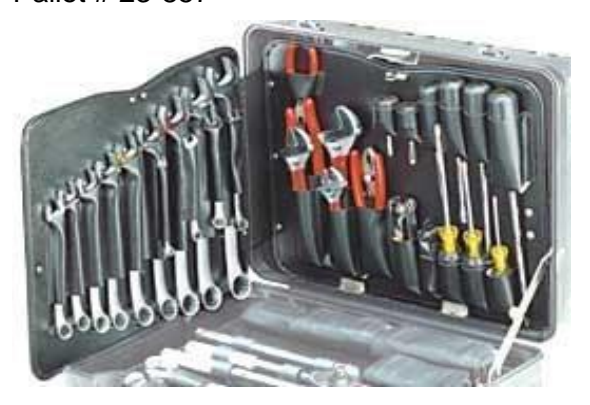
Pallet # 23-859