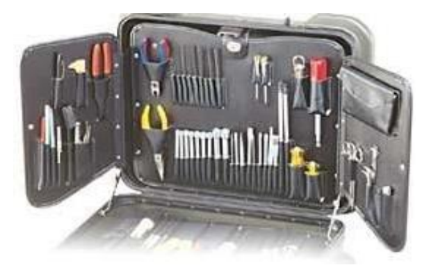
Pallet # 54-711