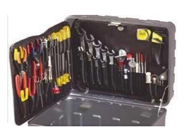
Pallet # 54-091R