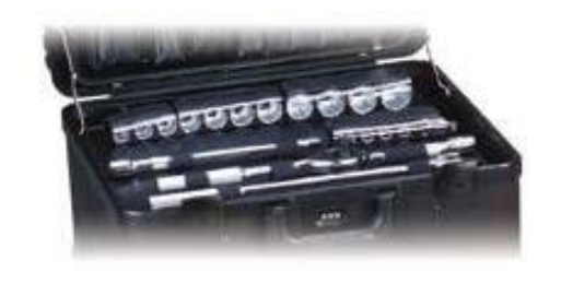
Pallet # 23-860