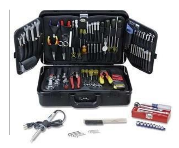
Pallet# 444-688 (top section only)