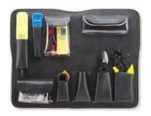
Pallet # 23-472