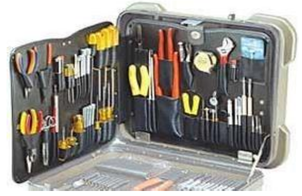
Pallet # 23-886