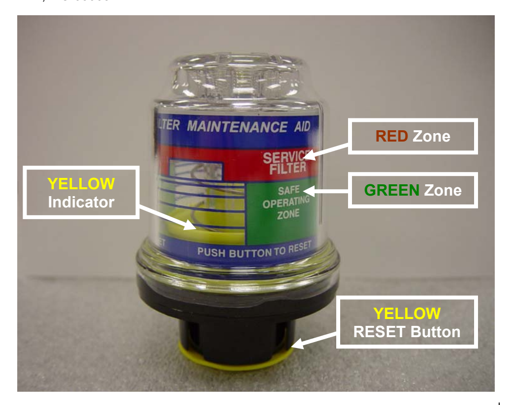
Figure 4-1. FILTER MAINTENANCE AID – (ABOVE) "YELLOW Indicator" position relative to SAFE OPERATING ZONE ("GREEN Zone") or SERVICE FILTER ("RED Zone") markings defines current filter condition and pushing "YELLOW RESET Button" resets indicator. (BELOW) FMA unit is mounted to inner frame of IBF assembly and can be viewed through access window in the upper fairing.