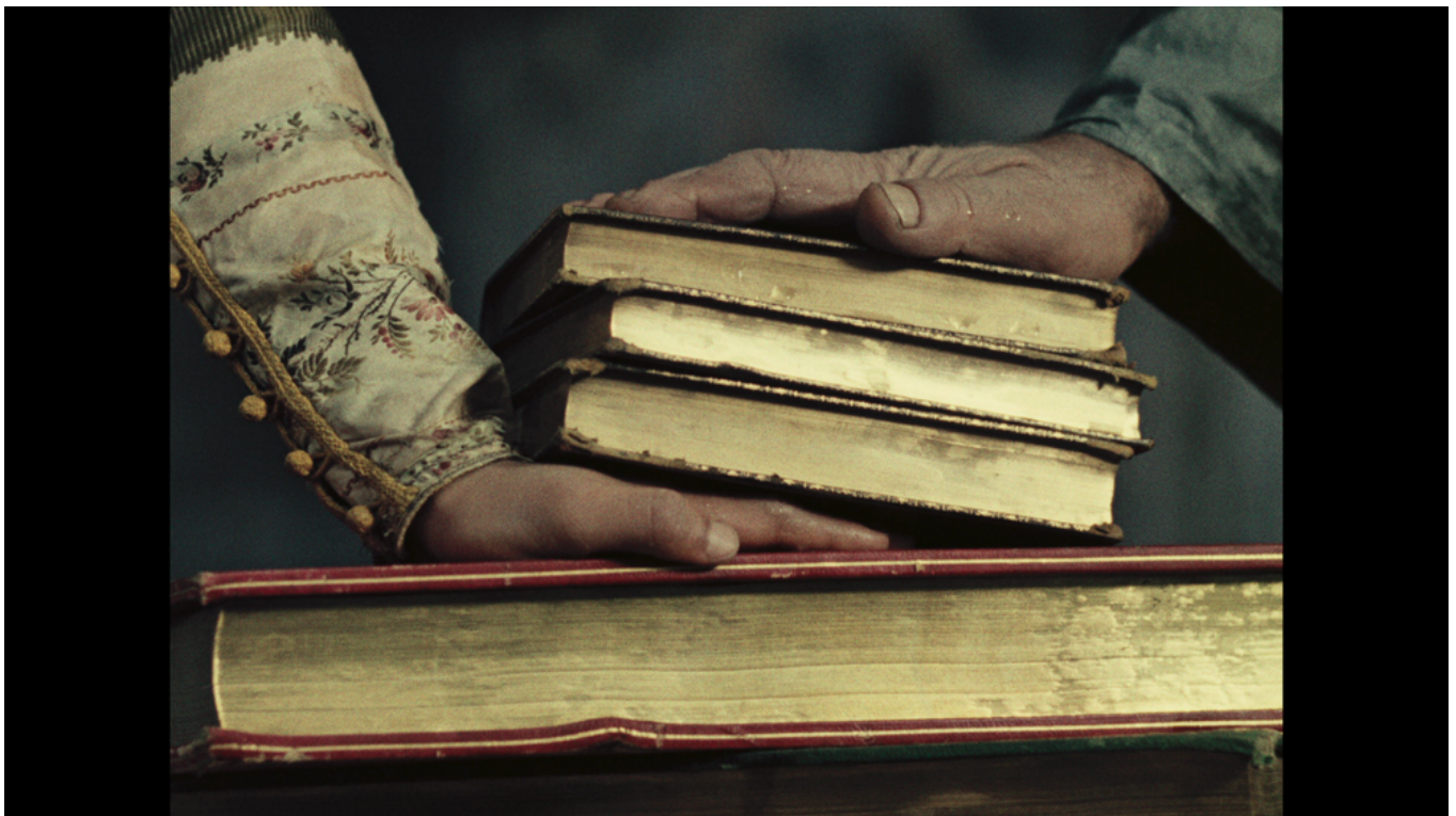
Outtake from Sergei Parajanov's The Colour of Pomegranates (1969)