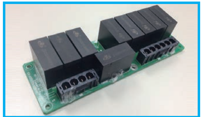
(Surge Protection Devices)

The RPI-M50A comes with built in PV fuse on both the positive and negative strings for all twelve inputs. Also the inverter has Type-2 SPD's (Surge Protection Device) for both the DC (One for each MPPT) and AC inputs. Both the PV fuse and SPD's can be replaced. This can bring down the overall PV system costing.