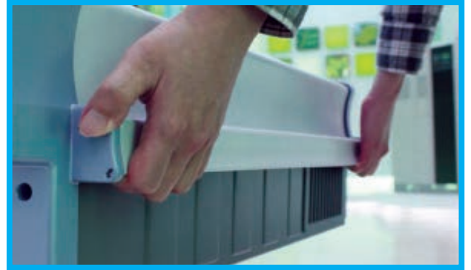
(Ergonomic Grip Design)

Ergonomic grip design gives more convenience while moving the inverter during installation. With special handle protection design, RPI-M50A can be easily placed down on the flat ground vertically without damaging various connectors at the bottom.