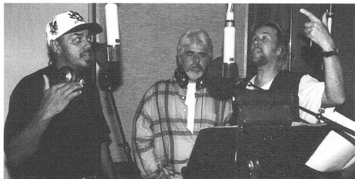
James Ingram, Michael McDonald and David Pack.

This recording will be a reinterpretation of songs from the Broadway musical using contemporary artists. A portion of the proceeds will benefit The Leonard Bernstein Center for Education Through the Arts in Nashville and