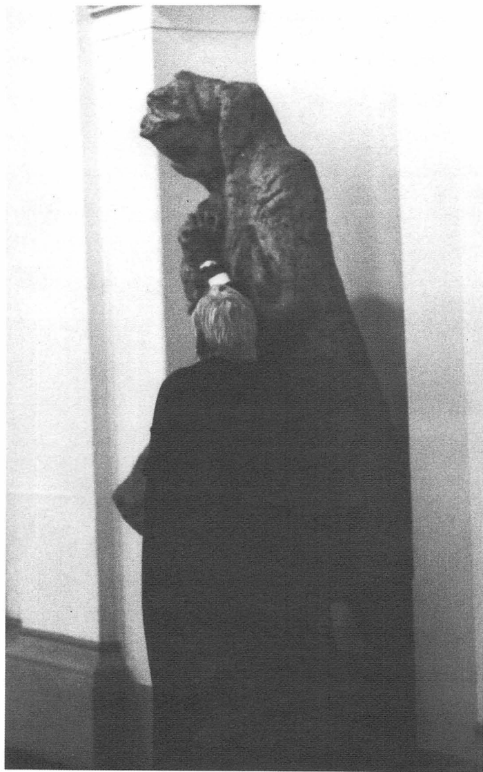
Leonard Bernstein pays homage to Beethoven before a concert at the Musikverein.

Bernstein was unique, a conductor and composer without precedent. He was loved by the public. He was loved by the orchestras. He was loved by the artists he worked with. He was loved by many critics. Every concert, every opera performance, every composition of his seemed to be a present. His musicals were performed with the same enthusiasm Vienna's opera houses usually muster for the masterpieces of Johann Strauss, while THE AGE OF ANXIETY , JEREMIAH , KADDISH and CHICHESTER PSALMS were