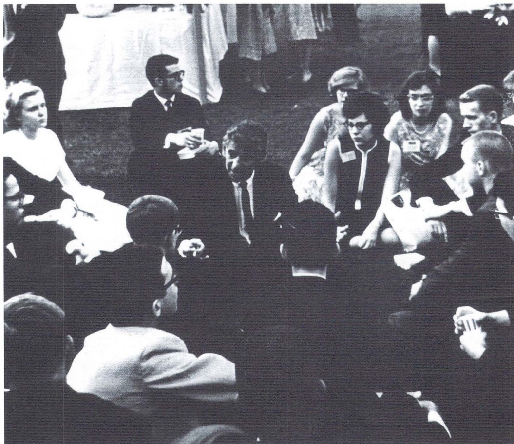
Leonard Bernstein with students at the White House, 1964.