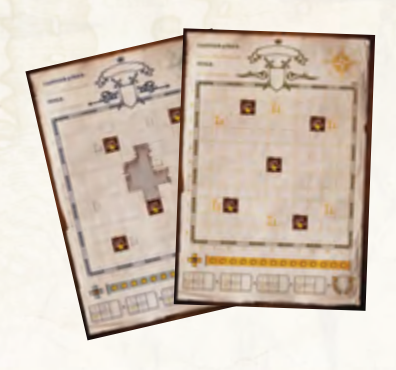
100 MAP SHEETS (double sided)