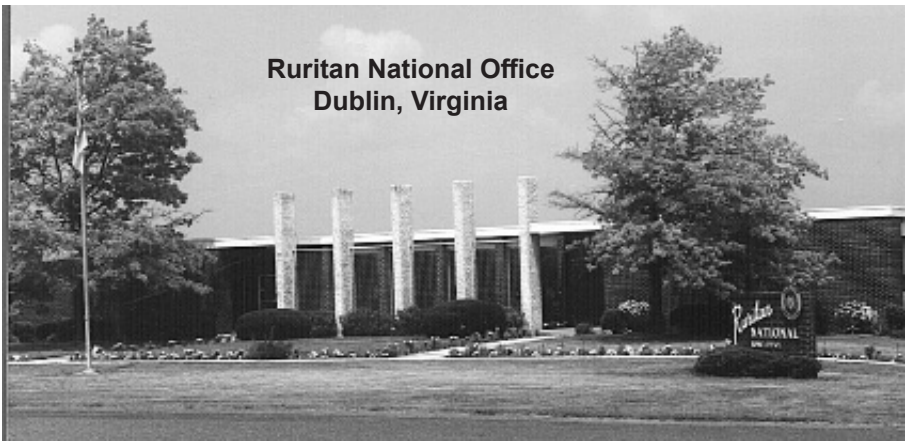
Ruritan National Office Dublin, Virginia