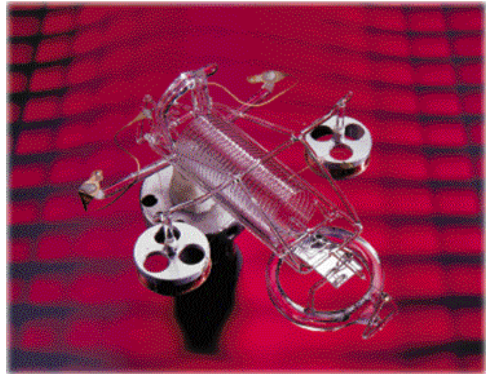
The Series 7250 features GE's unique fused-quartz sensor. This rugged transducer offers unequalled precision and a stability of 0.0075% of reading per year.

The 7250xi and 7250i not only provide unequalled precision, but also excellent long term stability due to the inherent properties of quartz in combination with several enhancements GE has implemented over the last few years. The total uncertainty of the 7250xi and 7250i over a one year calibration interval is 0.009% of reading down to 5% and 25%, respectively (see the table, above right). GE's simplified specifications eliminate guesswork and "specmanship" to allow you to determine the actual performance delivered with every instrument.