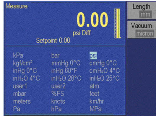
The large color display allows the pressure value to be displayed even when viewing a submenu selection such as the units selection screen shown above.

The Series 7250 high speed digital pressure controllers can easily automate your test and calibration workload. All are easy to use, easy to maintain, and have the reliability, performance and features that you want. The Series 7250 features an easy-to-navigate menu structure with full text descriptions for menus and commands.