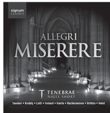
Allegrì Miserere Signum Classics SIGCD085 (2006)

Signum Classics SIGCD046 (2002) The Dream of Herod