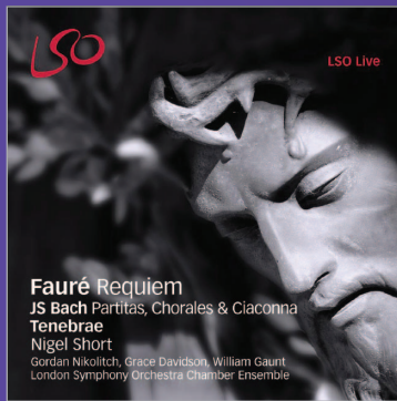
Fauré Requiem and Bach Partitas LSO Live LSO0728 (2012)

Winner of BBC Music Magazine Choral Award, 2012