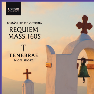
Victoria Requiem Mass 1605 Signum Classics SIGCD248 (2011)

Winner of BBC Music Magazine Choral Award, 2012