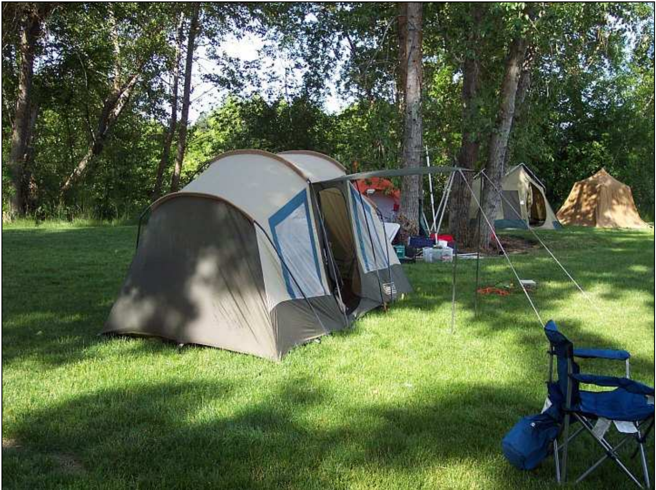
CW#1 Tent, CW#2 Tent (mostly hidden), JCARES Tent, 6 Meter SSB Tent.