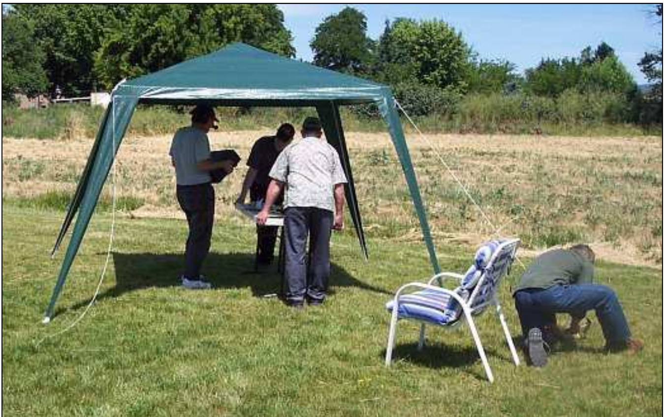
Phone Tent being moved Far, Far Away

Originally the phone tent was right next to CW#1, but the interference between stations on the same or adjacent bands was too much, and we moved the phone tent to the other side of the park about 650 feet away mid Saturday-afternoon. We used the caterpillar method— we left the cover set up, and moved the cover, table, equipment etc., by a large team of many legs. This fixed the inter-station interference problem almost completely, enough to avoid any significant problems.