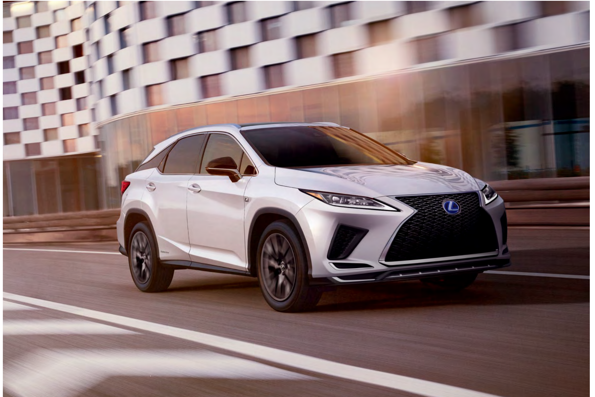
RXh F SPORT shown in Ultra White 9

Craving more of an edge? The RX 450h F SPORT adds bold styling and offers an Adaptive Variable Suspension that takes exhilaration even further.