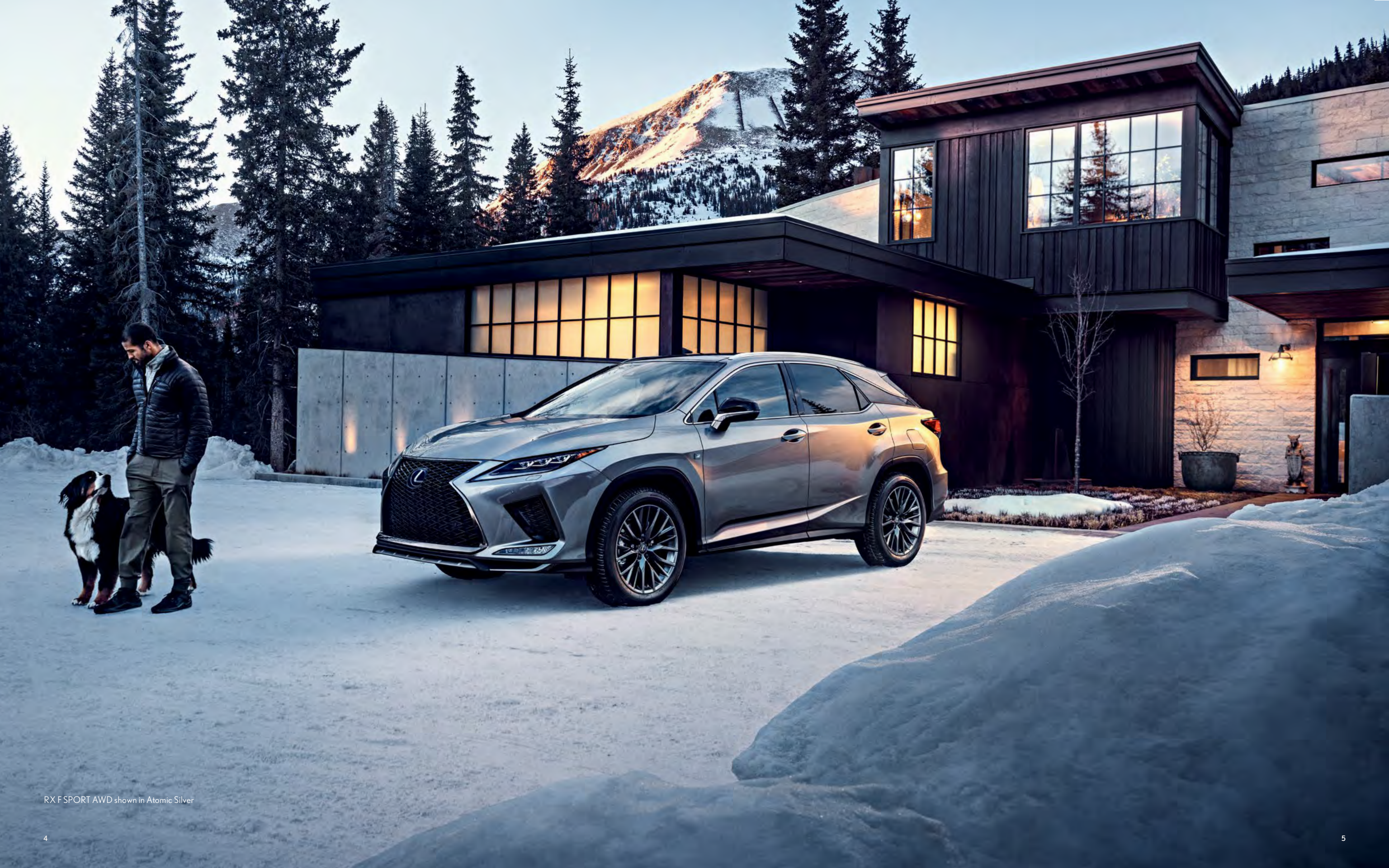
RX F SPORT AWD shown in Atomic Silver