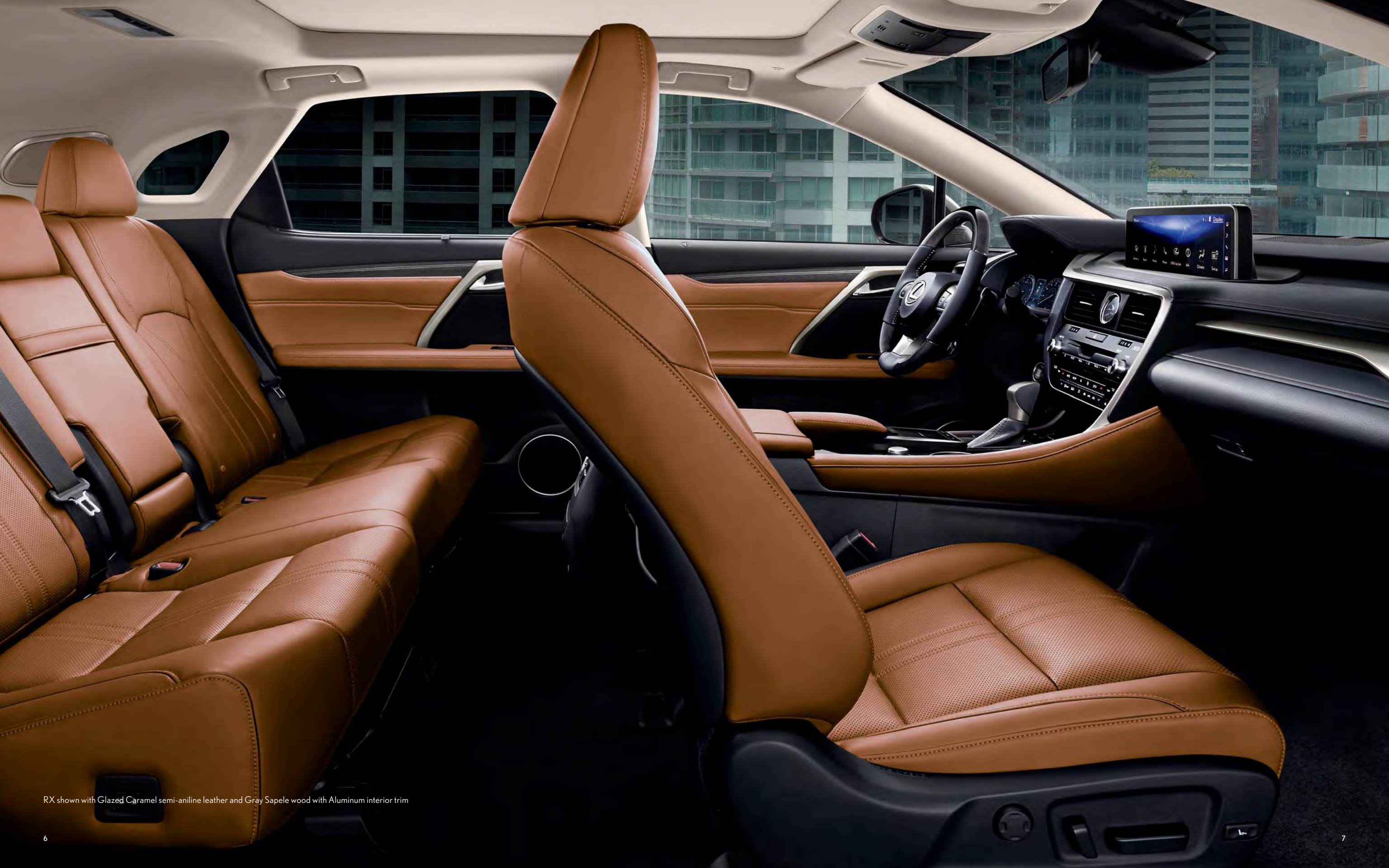
RX shown with Glazed Caramel semi-aniline leather and Gray Sapele wood with Aluminum interior trim