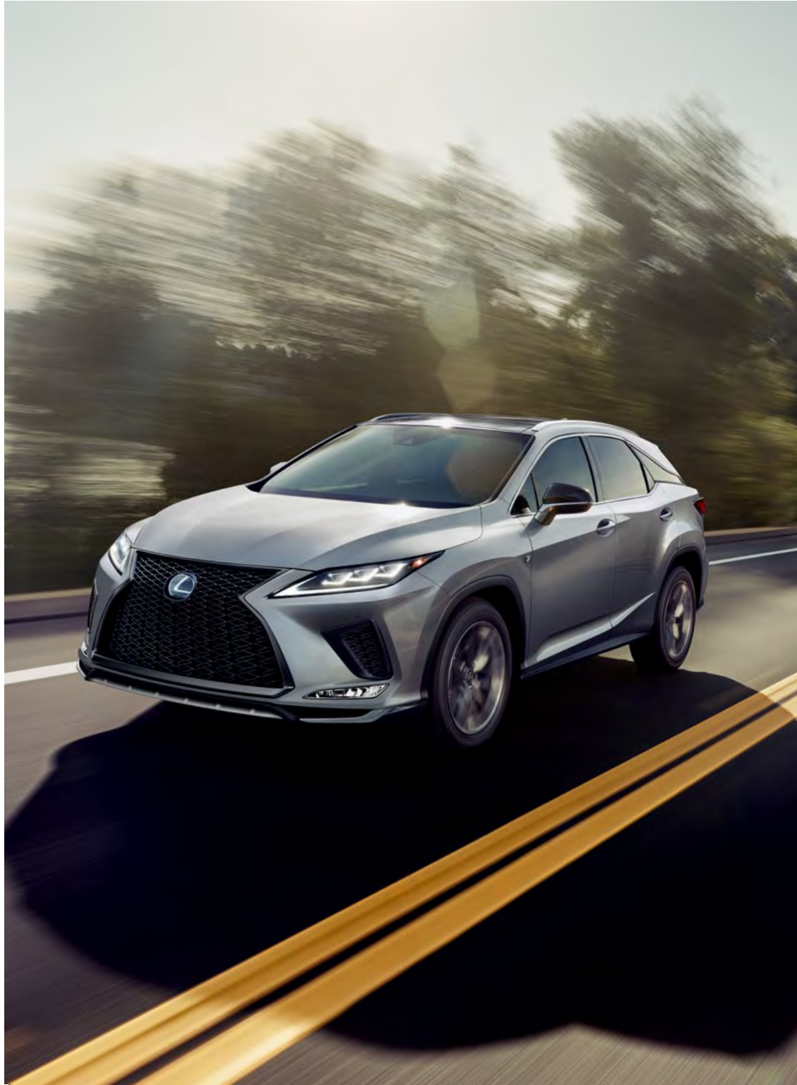
RX F SPORT shown in Atomic Silver