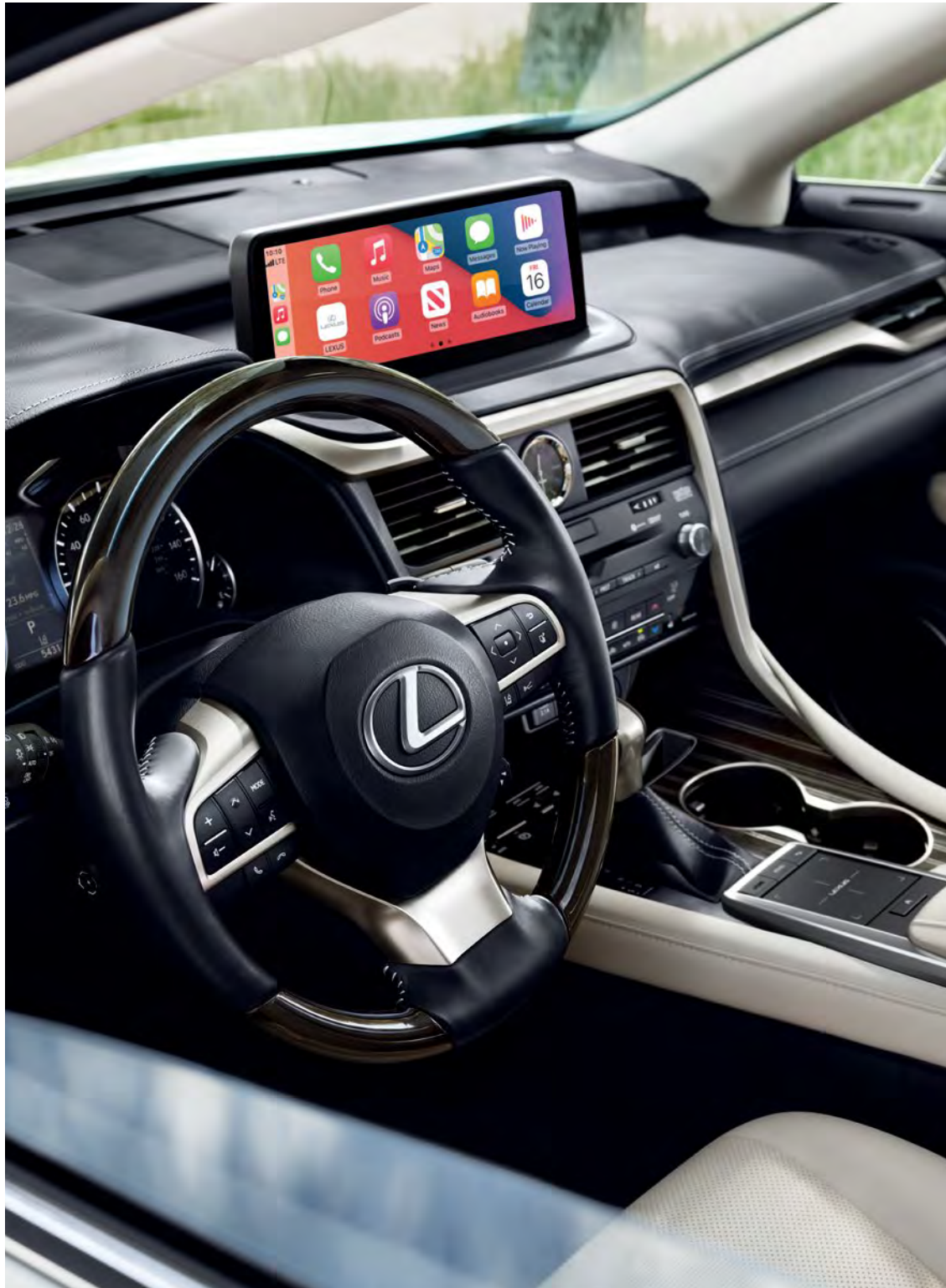
RXL shown with Apple CarPlay ®13 integration, Parchment semi-aniline leather and Gray Sapele wood with Aluminum interior trim