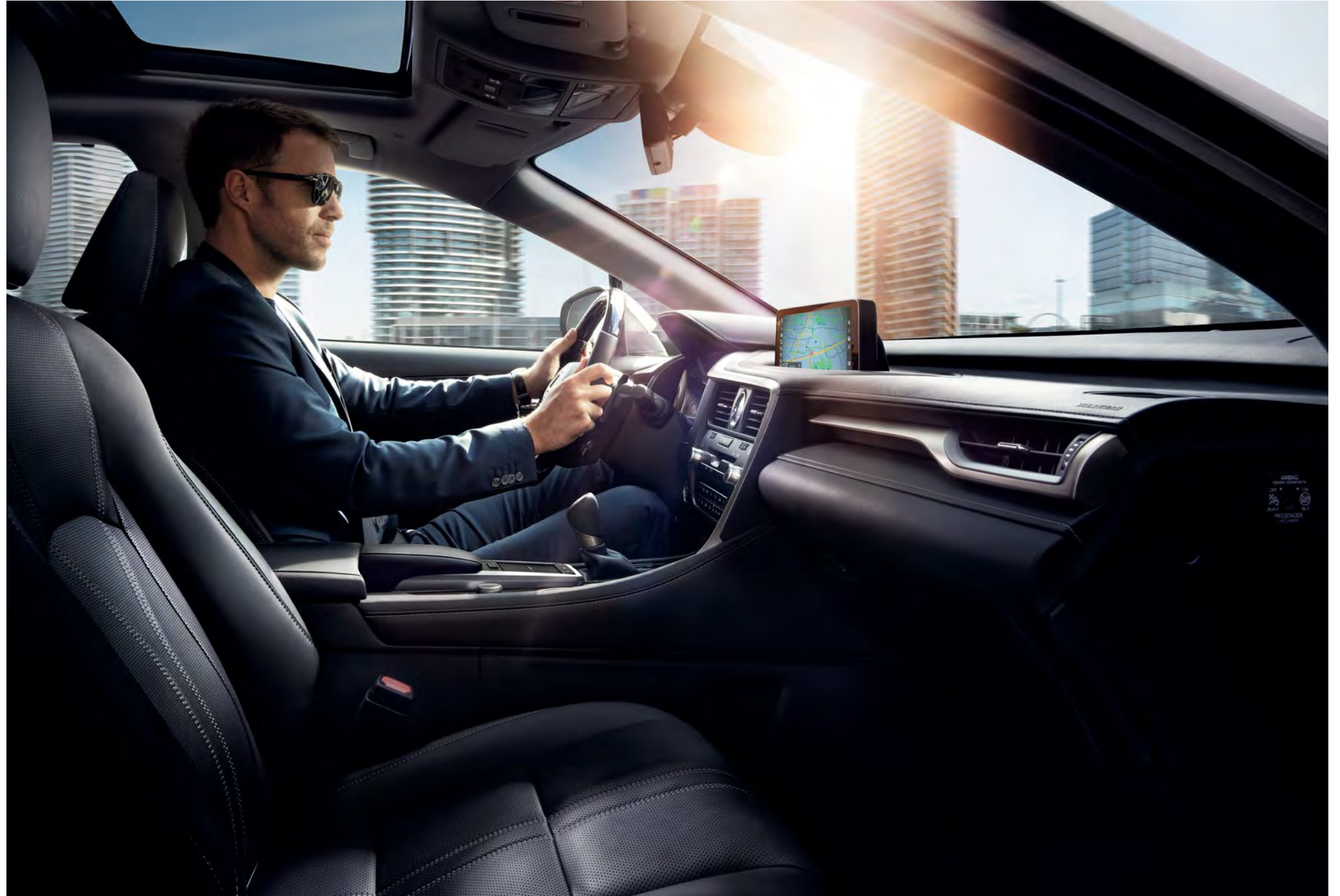
RX shown with Black semi-aniline leather and Gray Sapele wood with Aluminum interior trim