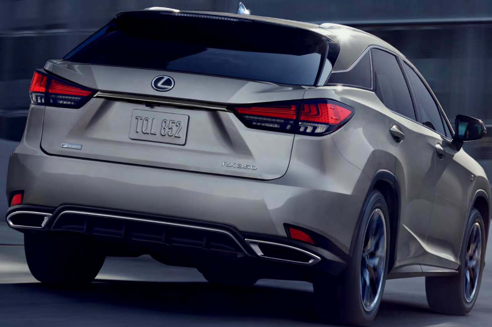
RX F SPORT shown in Atomic Silver