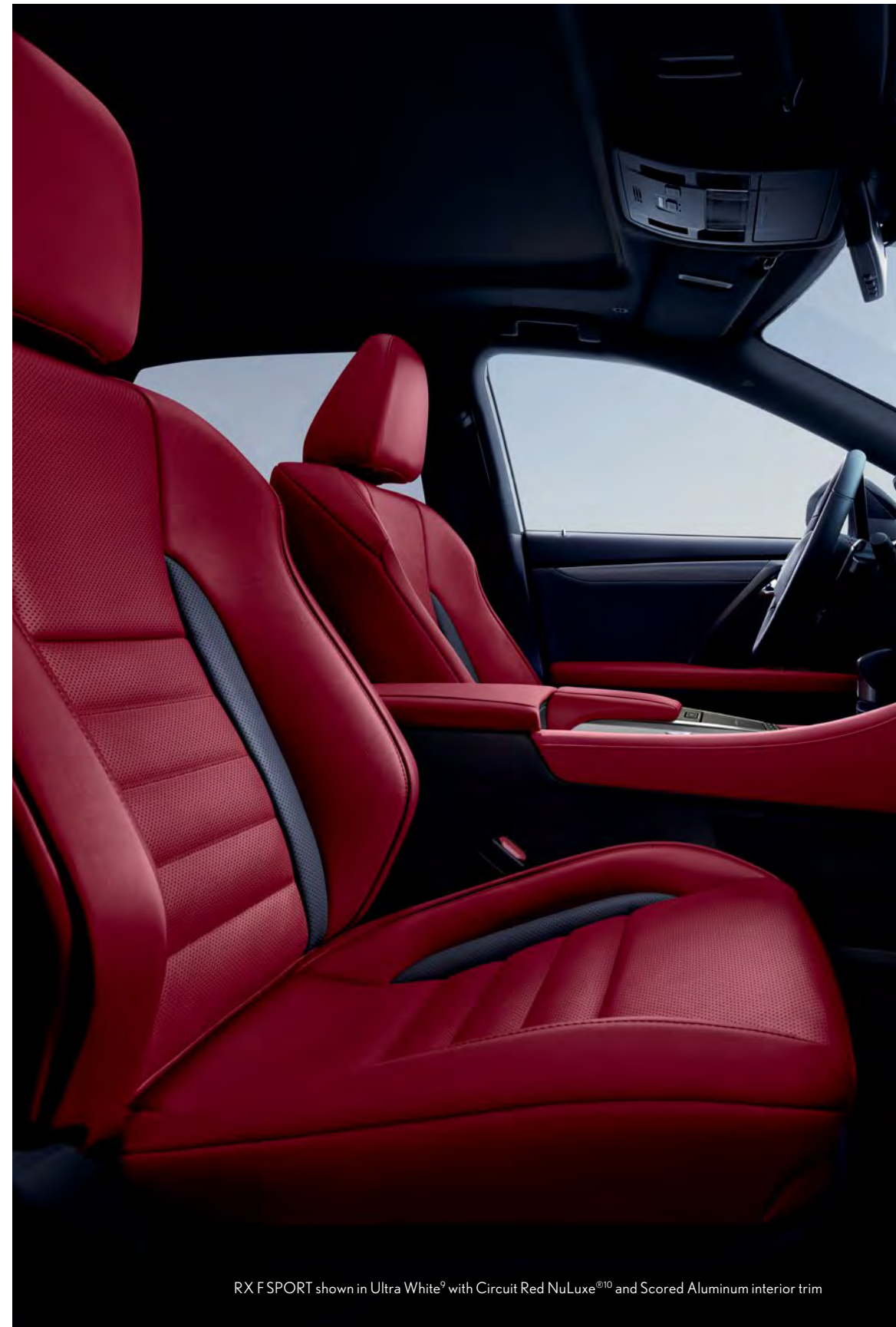
RX F SPORT shown in Ultra White 9 with Circuit Red NuLuxe ®10 and Scored Aluminum interior trim