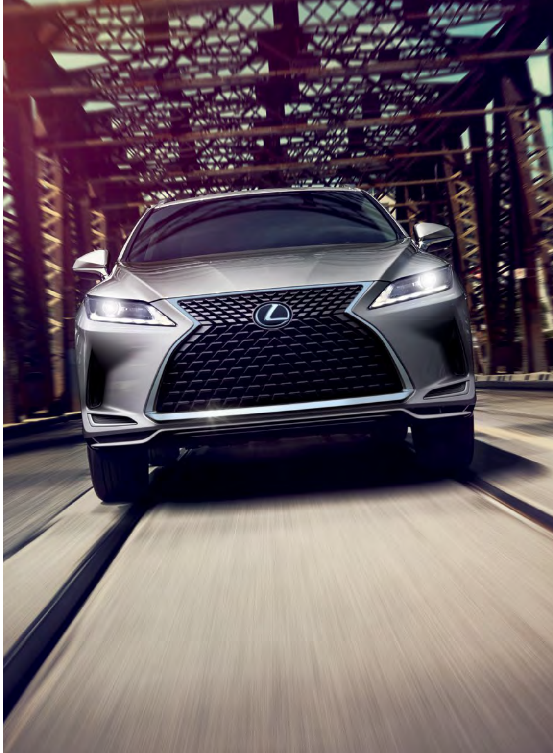
RX shown in Atomic Silver