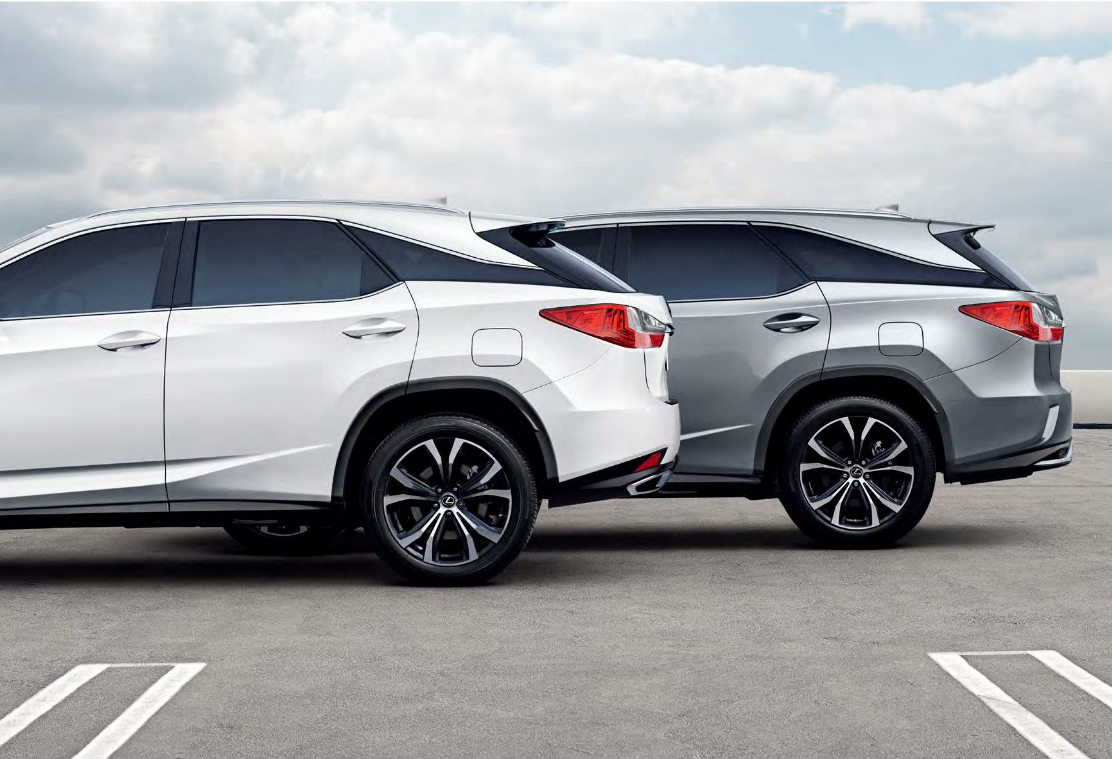
RX shown in Eminent White Pearl 9 (left), RXL shown in Iridium 9 (right)