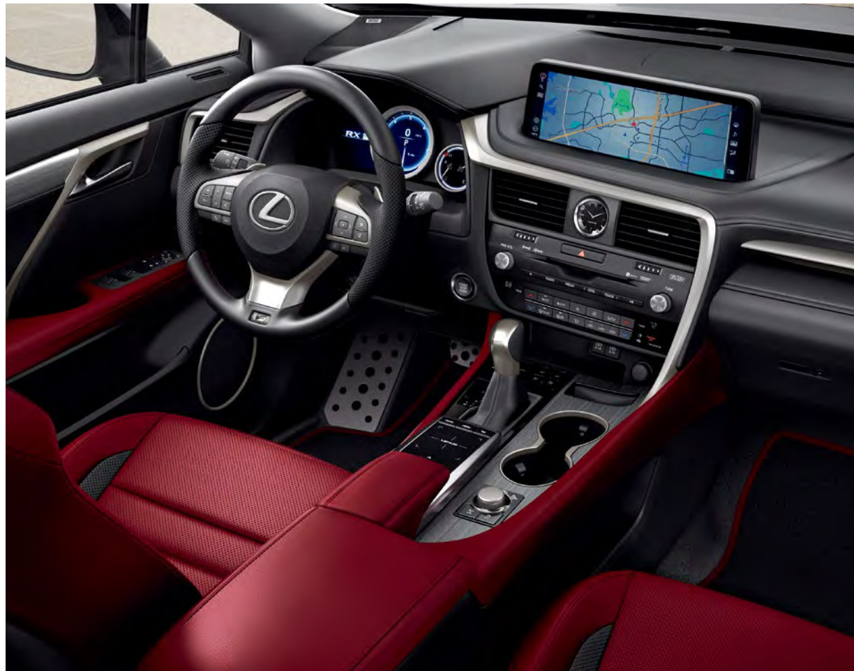
RX F SPORT shown with Circuit Red NuLuxe and Scored Aluminum interior trim

The bold F SPORT perspective is obvious throughout the driver-centric interior. In addition to exclusive race-inspired instrumentation and bold aluminum accents, you'll find performance upgrades, including bolstered sport seats, a black headliner, a perforated leather-trimmed sport steering wheel and shift knob, plus aluminum pedals and more.