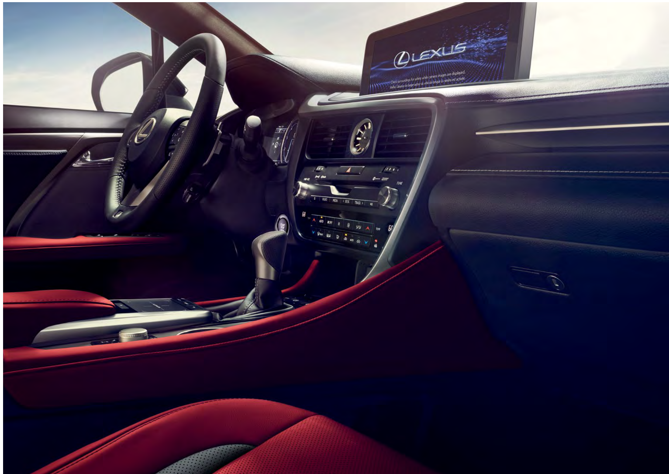
RX F SPORT shown with Circuit Red NuLuxe and Scored Aluminum interior trim

Customize the climate around you. Individual settings allow the driver and front passenger to adjust their preferred temperatures. Plus, the RX 350L and RX 450hL feature dedicated climate control for passengers in the third row. To help ensure the cabin stays fresh, an available smog-sensing climate-control system automatically switches into recirculation mode if it senses high levels of pollutants outside.