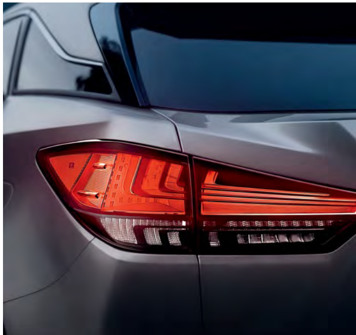
RX shown in Nightfall Mica

From its expressive headlamps and taillamps to its bold character lines, every element of the 2022 RX is crafted to captivate.