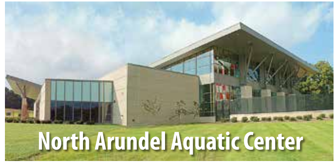
North Arundel Aquatic Center

2690 Riva Road Annapolis MD 21401 410-222-7933