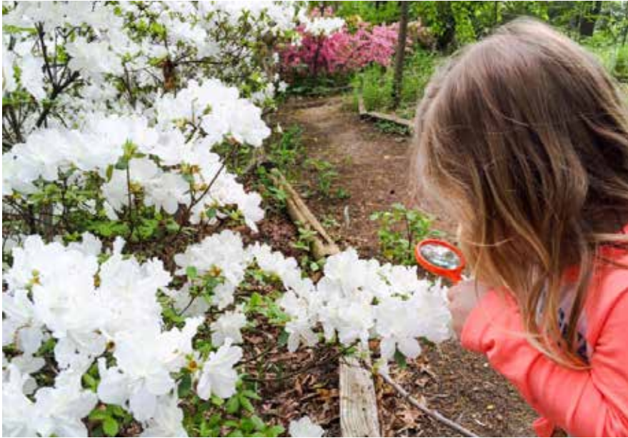
Learning at London Town: How Does Your Garden Grow

Visit www.aacounty.org/recparks online Calendar of Events for detailed information about each park program and event.