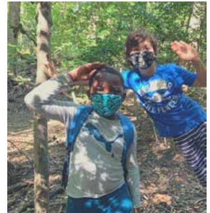
Nature Play Days at Jug Bay, pg. 15