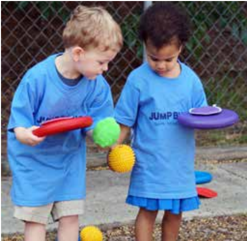
Mini sports classes, pg. 6

Nuestro sitio web puede ser traducido al español. En la página principal, desplácese hasta la parte inferior donde está marcado como "seleccionar idioma" y haga clic.