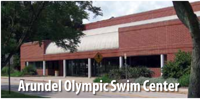
Arundel Olympic Swim Center

2690 Riva Road Annapolis MD 21401 410-222-7933