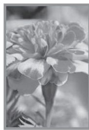
GARDEN MOMENTS ..... MELINDA MYERS

Flat-faced flowers like daisies tend to close a bit when dried upside down. Try laying them face down on a flat surface. Simply cut off the stem and place the flowers face down on newspaper in a warm, dry location. Once dried,