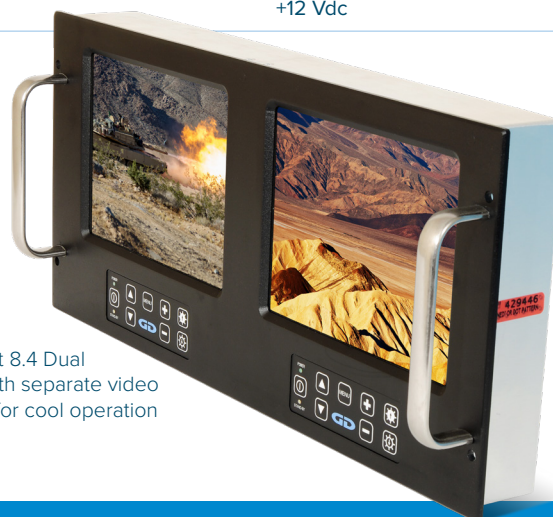
The Saber RackMount 8.4 Dual features 2 displays with separate video inputs, and dual fans for cool operation