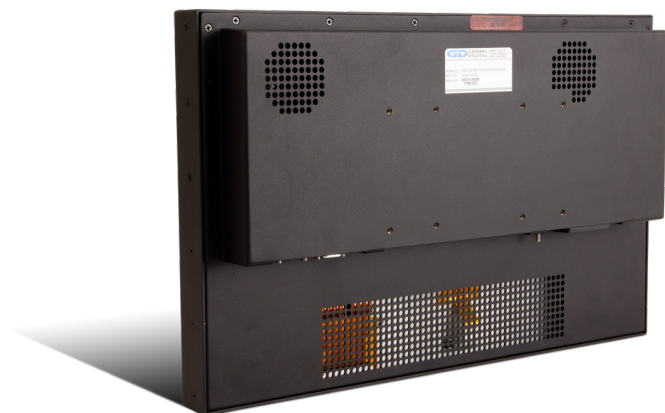
The Saber Standalone NVIS 21.5 is compatible with night vision goggles via the NVIS button on the monitor bezel. This rugged VESA mount unit includes a capacitive touch screen and internal power supply.