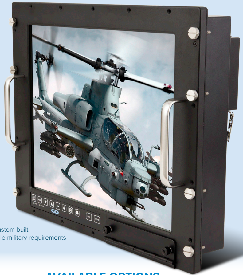
Saber PanelMount 19.0 901E custom built to be in compliance with multiple military requirements

The low power units are designed to operate from a single +12 Vdc regulated source. Customers can provide their own power supply, request a custom supply, or choose one of our specially-designed AC switching supplies, many featuring power factor correction.