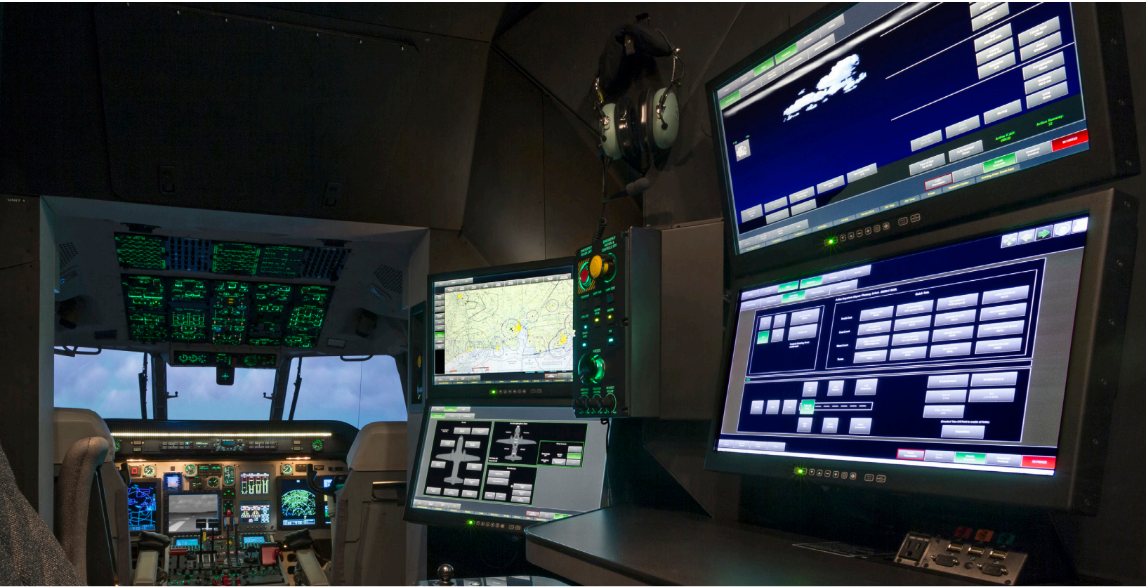
Four Saber Standalone 21.5 monitors ready for duty in a flight simulator