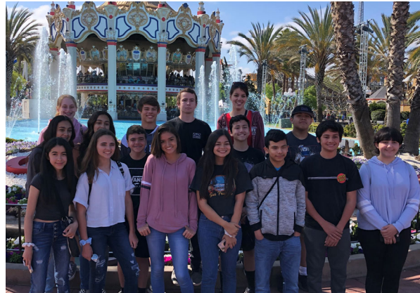
Field trip fun!! On Friday, May 10th, 4 of our classes attended field trips!