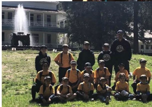
Our 4th graders went to Yosemite National Park where they spent the day learning about some of California's most beautiful and wonderful history.