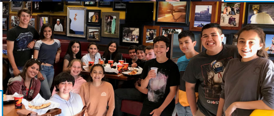
Our 8th graders enjoyed a day of fun at Great America to celebrate their upcoming graduation.