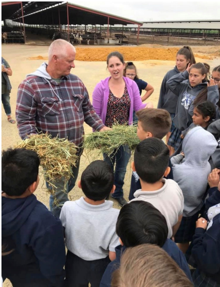
Our 3rd and 7th graders traveled to Fiorini Dairy where they experienced hands-on agriculture to learn about dairy cows for a county fair project they will be working on together in the final few weeks of school.