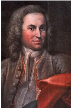
Young J.S. Bach (around 1711)

The year 2011 does not officially qualify as a Bach year. There is no “round” birthday to celebrate for a composer who lived from 1685 to 1750. Furthermore, the year 1711 was rather insignificant in Bach’s life (the image shows the young Bach sometime around 1711). However, there is always reason to celebrate Bach’s