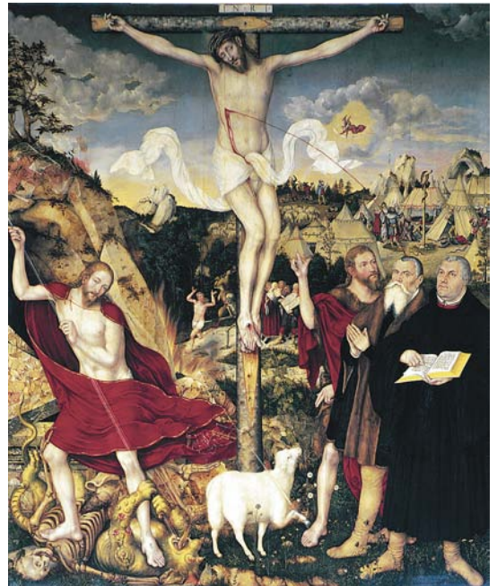
Lucas Cranach, Weimar Altarpiece “The Passion of Christ”