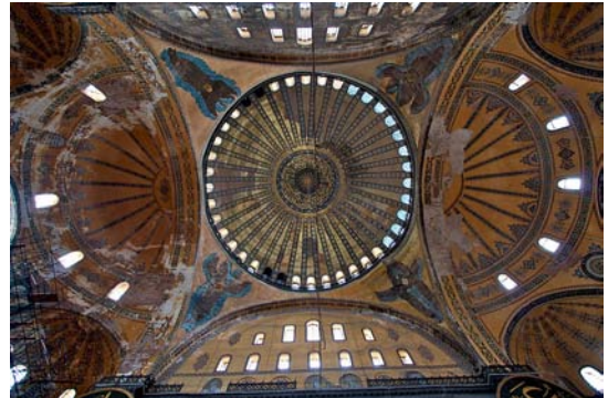
Interior of Hagia Sophia, 532-537, Istanbul, Turkey.