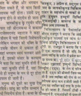
बताया कि असुरक्षित यौग संबंध, असुरक्षित एवं गर्भवती महिला से उसके होने वाले