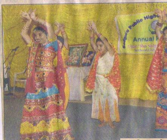
कार्यक्रम में नृत्य प्रस्तुत करती छात्राएं।