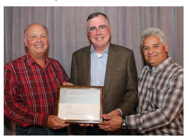
Three Rivers Refinery (pictured above) Achievement Years - 1 Year From 7/16/10 to 7/15/11