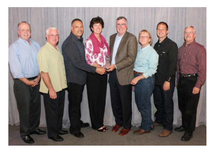
ConocoPhillips Company Santa Maria Facility

The 20th Annual Safety Awards dinner honors 42 regular member companies represented by 64 refineries and 66 petrochemical plants with a grand total of 242 awards. Forty Associate member companies are recognized for their excellent safety performance with 415 awards for their efforts in 143 facilities.