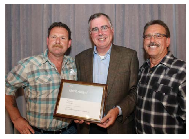
Wilmington Asphalt Refinery (pictured above) Meritorious Safety Performance Award: 0.0 TRIR Achievement Years - 3 Years From 6/16/08 to 6/15/11

Wilmington Refinery Meritorious Safety Performance Award: 0.2 TRIR Achievement Hours - 2,881,121 Hours From 1/26/09 to 12/31/11 Achievement Years - 3 Years From 1/26/09 to 1/25/12