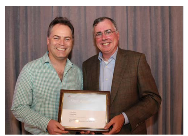
Valero Ardmore Refinery (pictured above) Meritorious Safety Performance Award: 0.3 TRIR Achievement Hours - 1,108,265 Hours From 6/12/10 to 2/13/12 Achievement Years - 1 Year From 6/12/10 to 6/11/11