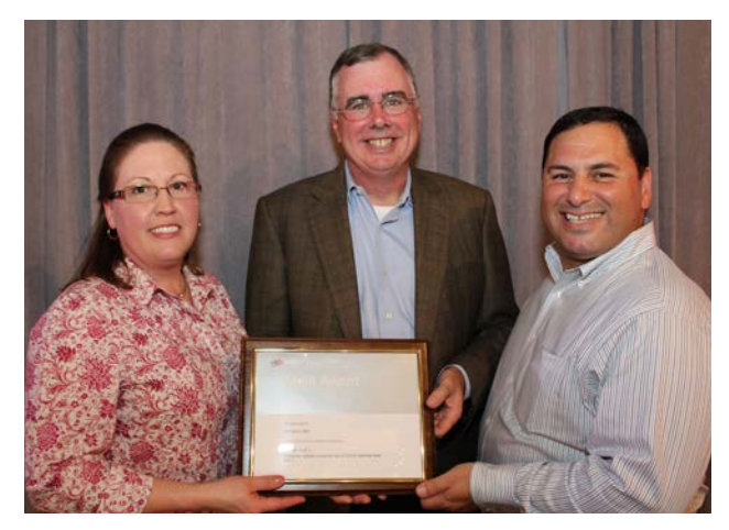
Port Arthur Refinery (pictured above) Meritorious Safety Performance Award: 0.7 TRIR