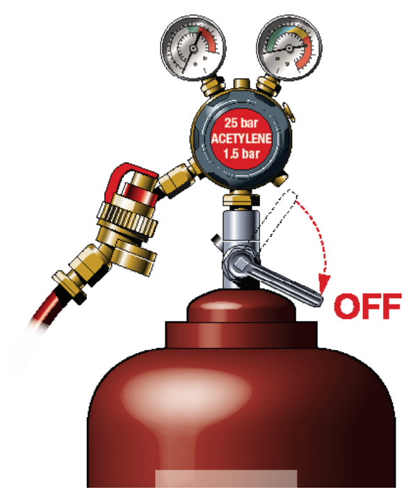
Figure 5 Cylinder head

The most important safety measure when transporting cylinders in vehicles is to close the cylinder valve. It is preferable to carry cylinders in an open-backed, pick-up style van. Fitting cages to the load bed may help prevent theft of the equipment. If cylinders are carried in enclosed load spaces then there should be additional ventilation fitted. Cabin ventilation is not sufficient. For further guidance on carriage of oxy/fuel cylinders see the HSE welding web pages.