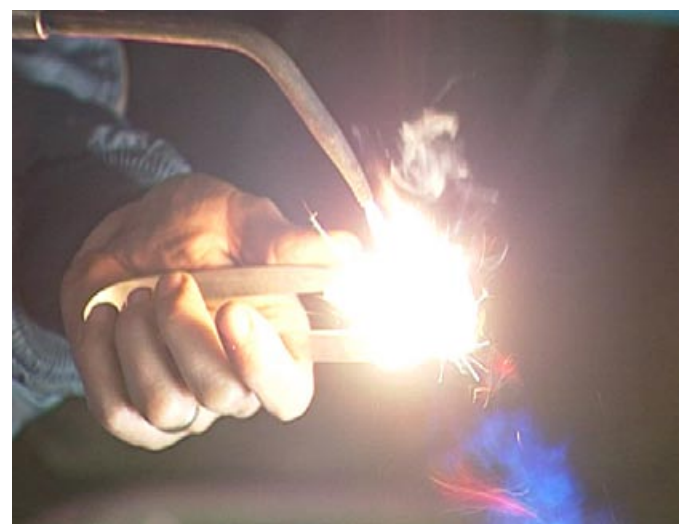
Figure 3 Spark ignitor

Flashbacks are commonly caused by a reverse flow of oxygen into the fuel gas hose (or fuel into the oxygen hose), producing an explosive mixture within the hose. The flame can then burn back through the torch, into the hose and may even reach the regulator and the cylinder. Flashbacks can result in damage or destruction of equipment, and could even cause the cylinder to explode.