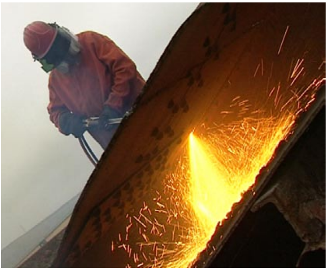
Figure 2 Cutting up scrap

If a welding blowpipe or burner is used on a tank or drum containing flammable material (solid, liquid or vapour), it can explode. Such explosions have killed people. As well as flammable liquids such as petrol, diesel and fuel oil, substances such as paints, glue, anti-freeze and cleaning agents may also release flammable vapours.