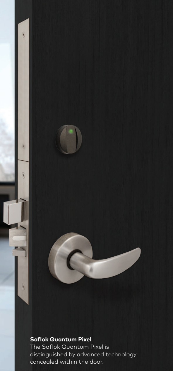
Saflok Quantum Pixel The Saflok Quantum Pixel is distinguished by advanced technology concealed within the door.

dormakaba access management systems provide centralized auditing and accurate reporting as an efficient method of managing and controlling access through collecting both software and lock data.