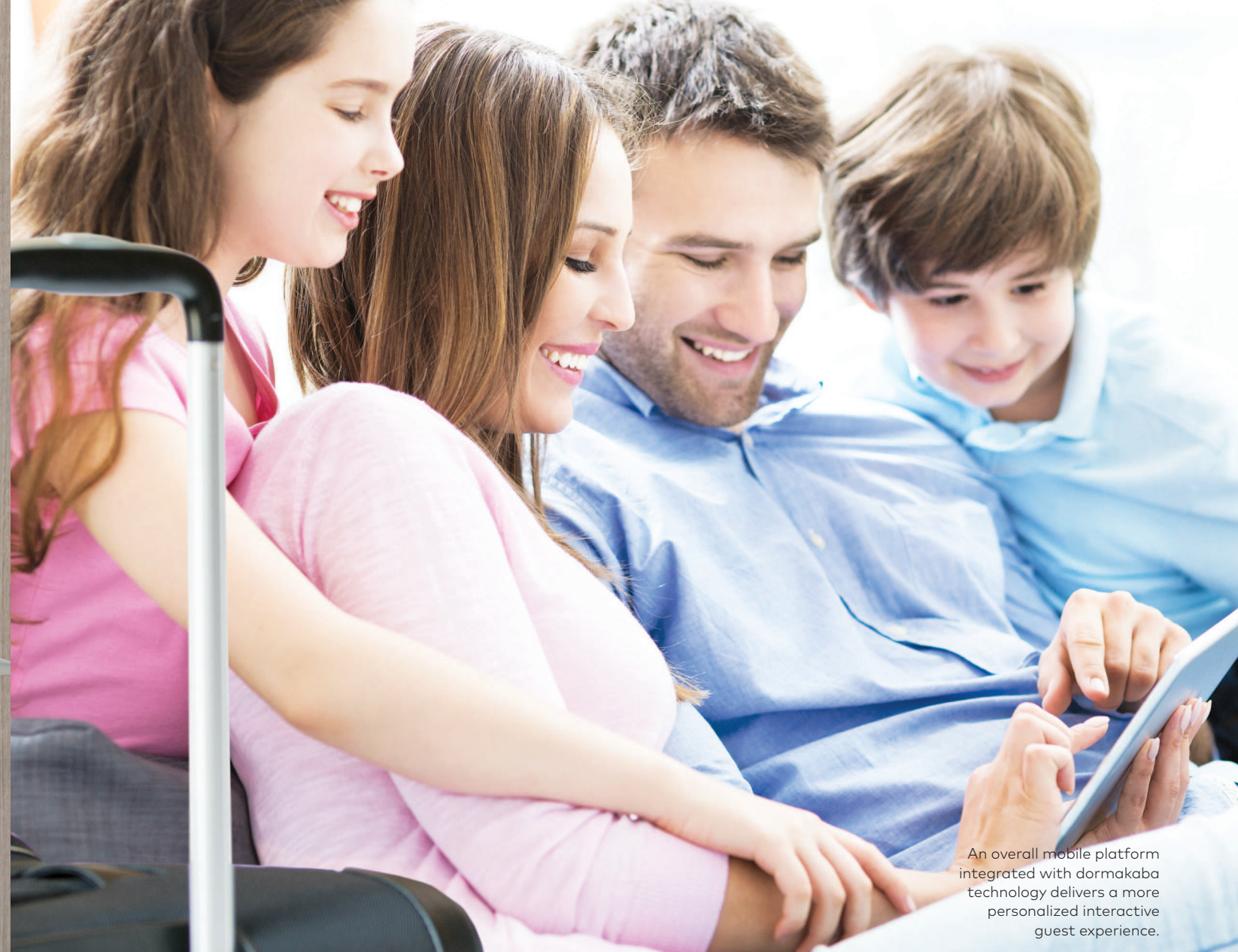
An overall mobile platform integrated with dormakaba technology delivers a more personalized interactive guest experience.