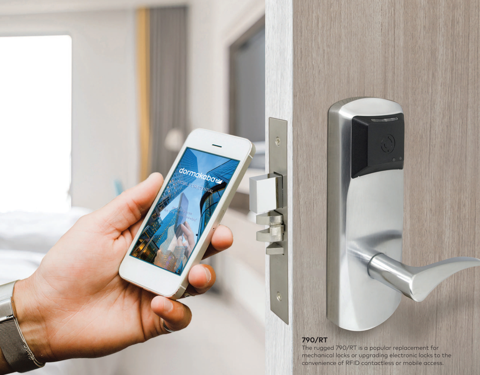
790/RT The rugged 790/RT is a popular replacement for mechanical locks or upgrading electronic locks to the convenience of RFID contactless or mobile access.