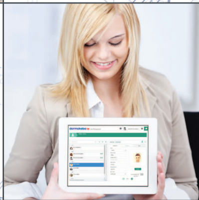
Access Management Software