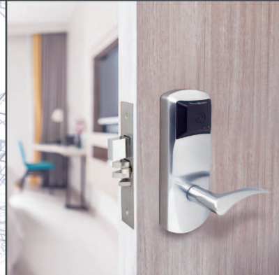
Full Body Electronic Locks