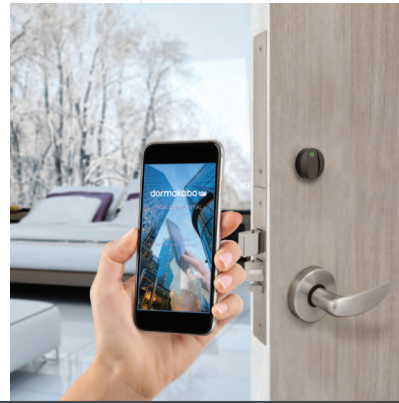
Mobile Access Solutions