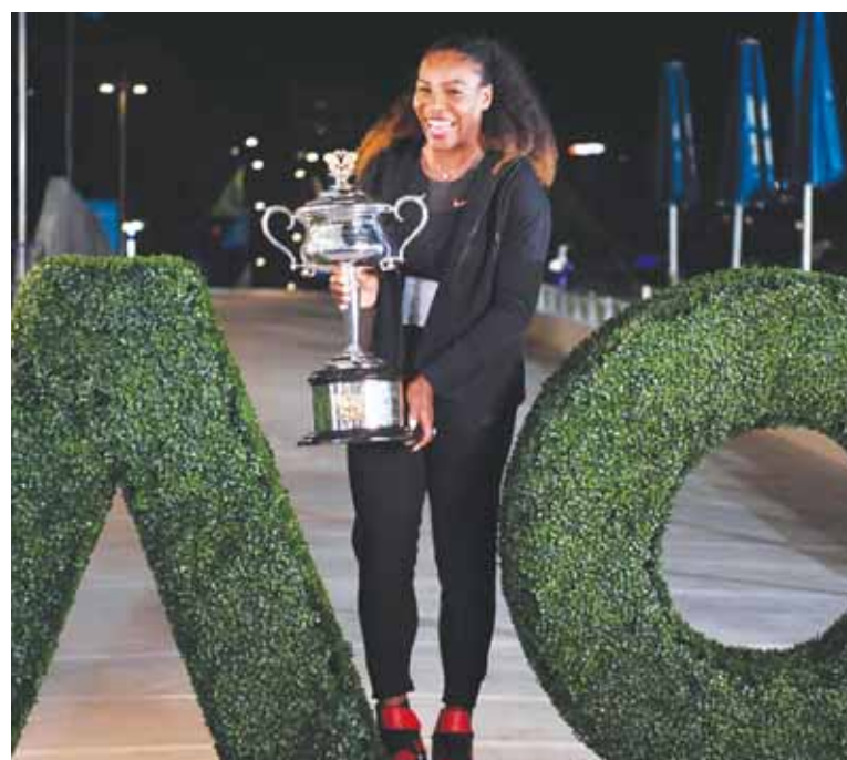
Serena Williams won her 23rd Grand Slam title when she won the Australian Open in January this year.

"For me, men's tennis and women's tennis are completely, almost, two separate sports," Williams said in 2013. "If I were to play Andy Murray, I would lose 6-0, 6-0 in five to six minutes, maybe 10 minutes. No, it's true. It's a completely different sport. The men are a lot faster and they serve harder, they hit harder, it's just a different game." (The Guardian)