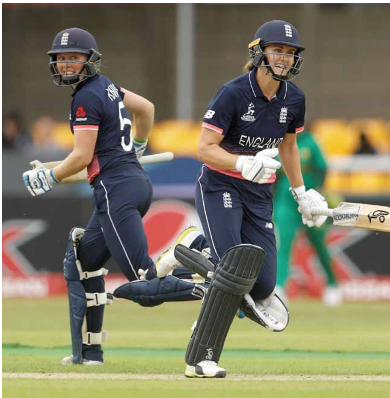
England's Natalie Sciver (right) runs a single to complete her century as teammate Heather Knight looks on during their Women's World Cup match against Pakistan in Leicester, England, yesterday.

While the fifty partnership came in 55 balls, the century stand was up in 93 balls. The first signs of things to come were established in the 23rd over when Sciver hit Nashra Sandhu for four consecutive boundaries to cover, third man, long-off and square leg. Knight opened the sixes column in the 33rd over when she slog-swept Sandhu over the mid-wicket fence much to the delight of the kids chanting 'England... England!'