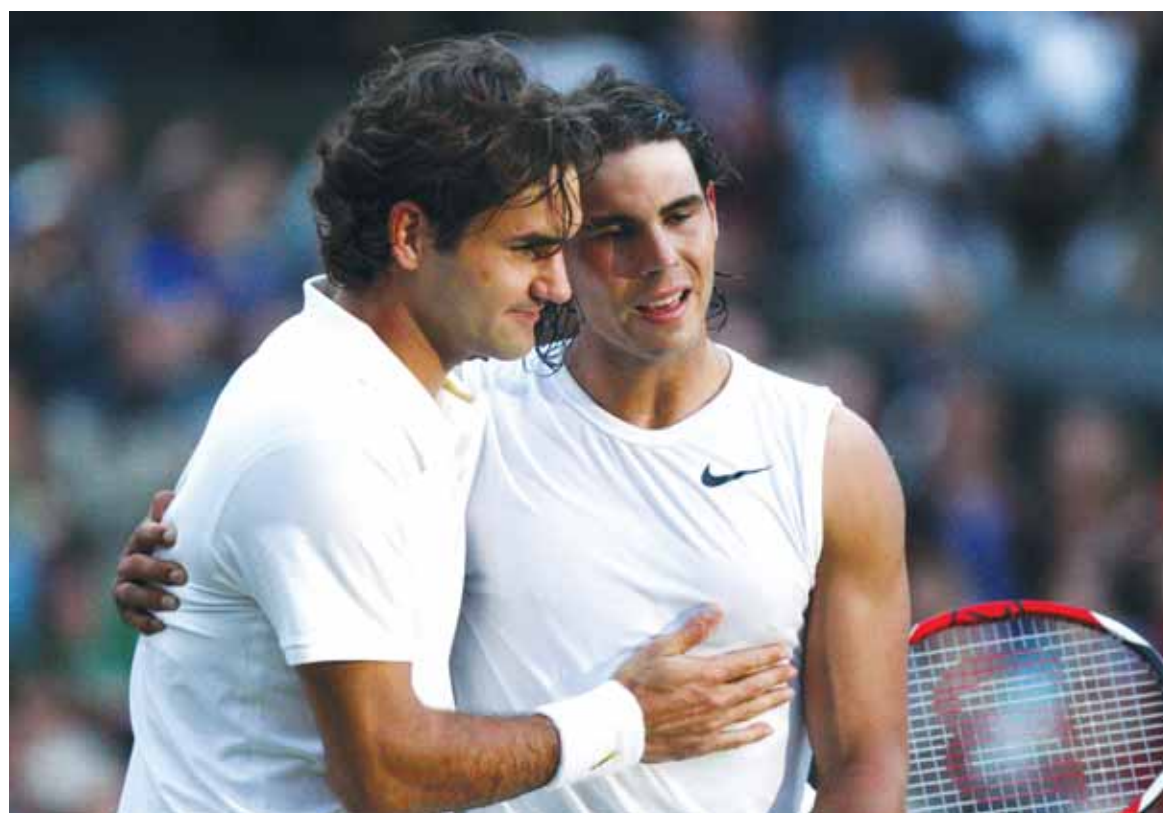
In this July 6, 2008, picture, Rafael Nadal of Spain (right) and Roger Federer of Switzerland embrace after their final match at Wimbledon in London. Nadal had won 6-4, 6-4, 6-7 (5), 6-7 (8), 9-7.

Nadal, the world number two, pulled out of the traditional grasscourt warm-up tournament, the Aegon Championships at London's Queen's