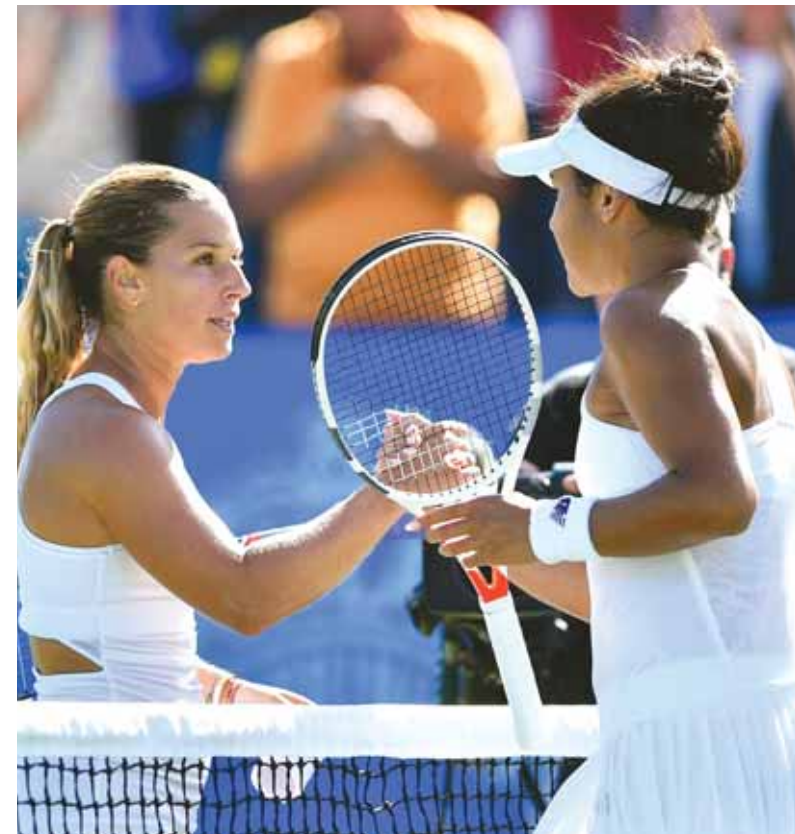
Slovakia's Dominika Cibulkova (left) shakes hands after losing to Britain's Heather Watson during their second round match at ATP Aegon International in Eastbourne, England, on Monday. Watson won 7-5, 6-4.

lit up last January's edition with sellout crowds for all three of their ties at the eight nation showpiece, with 13,917 fans turning out for the clash between Switzerland and France, the biggest tennis crowd in Western Australia. An additional 6,000 people at the Perth Arena watched a Federer training session as the 18-time grand slam winner played the event for the first time in 15 years. Bencic, 20, who once ranked seventh on the WTA, has been troubled by injury this season and is looking for a fresh 2018 start. "The Hopman Cup was amazing for me earlier this year, I enjoyed every second," the Swiss said. "Playing with Roger was obviously a dream come true and I learned so much from him during that week on and off court."