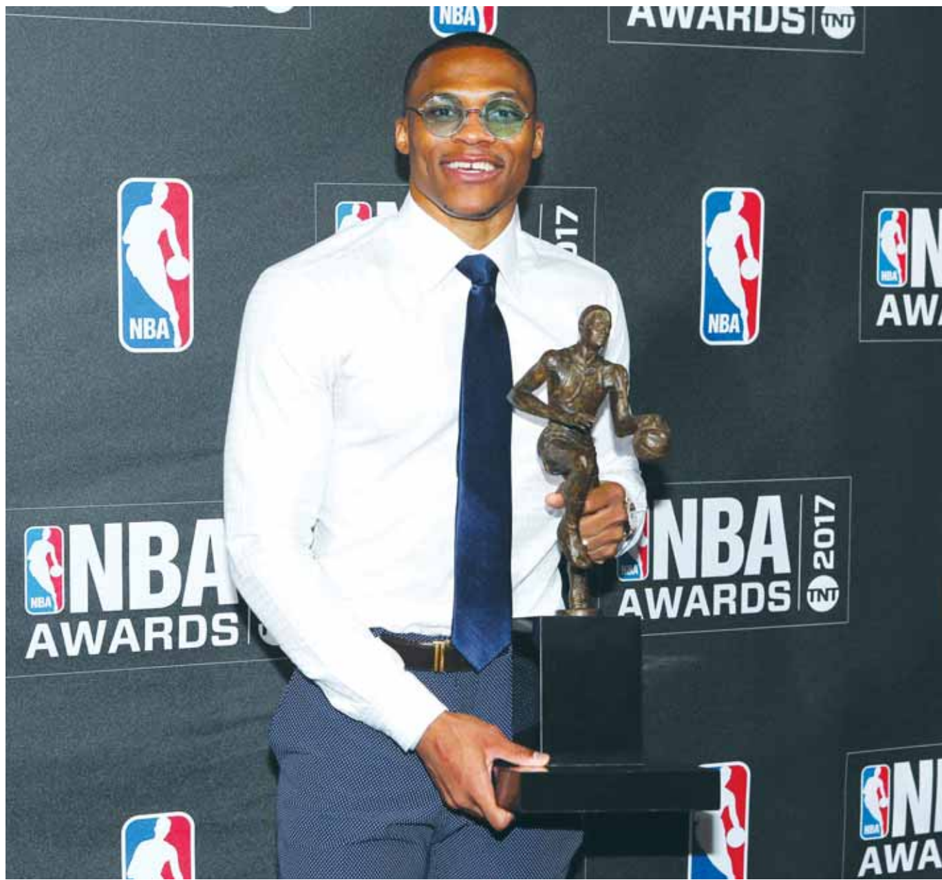
Oklahoma City Thunder player Russell Westbrook poses with his 2017 NBA most valuable player award during the 2017 NBA Awards at Basketball City at Pier 36.

Cameron center Joel Embiid and Croatia's Dario Saric, both with Philadelphia, were losing