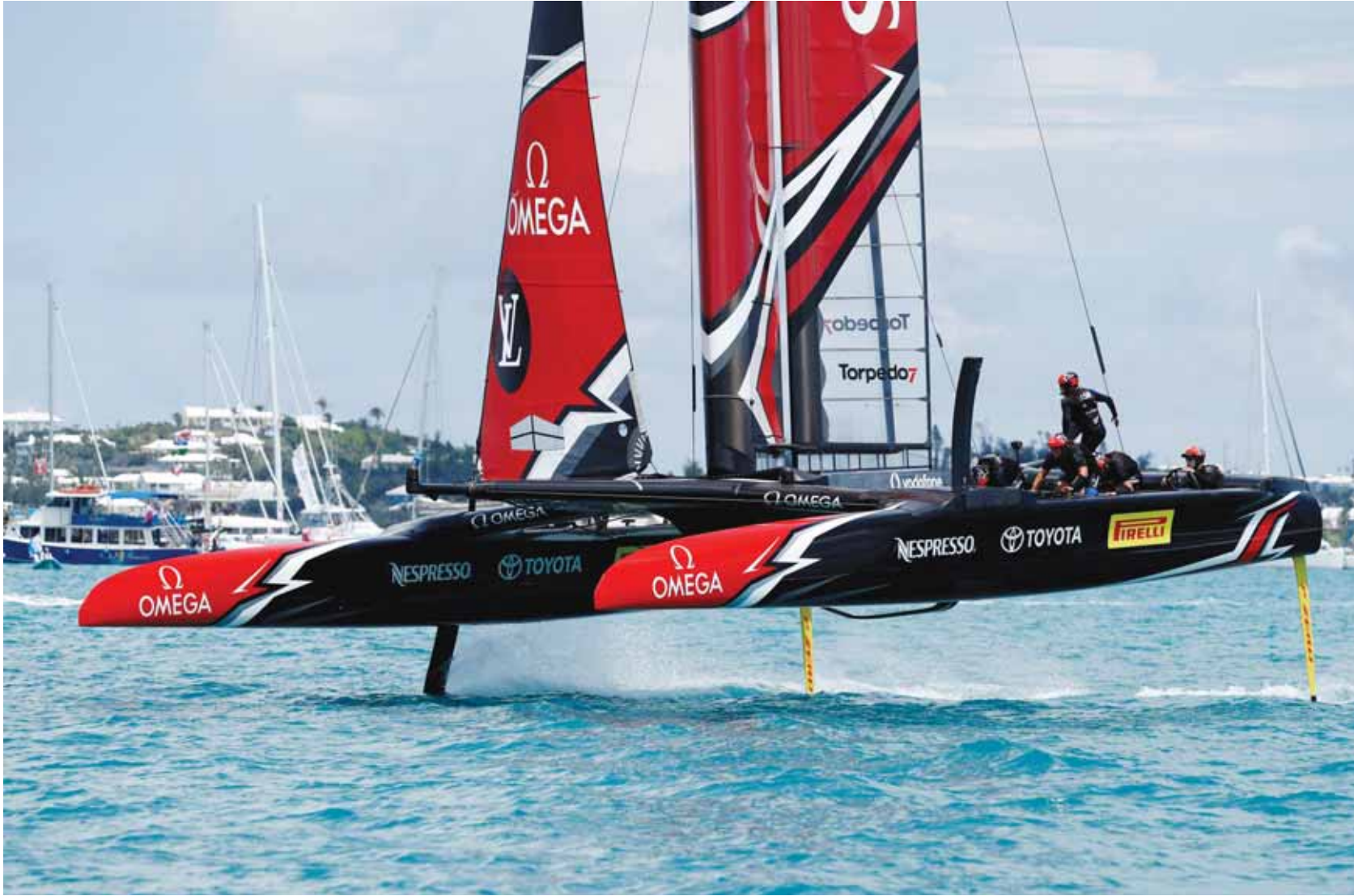
New Zealand helmsman Peter Burling takes his boat to the finish line to defeat Oracle Team USA in race nine to win the America's Cup.