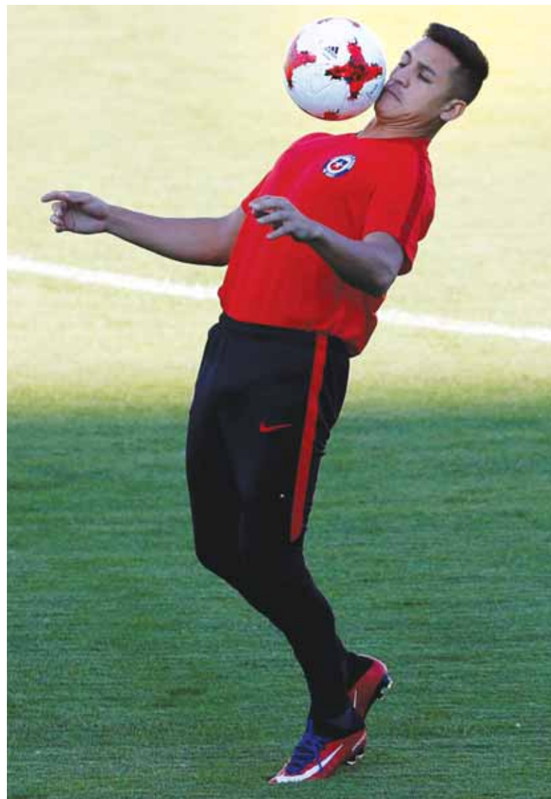
Chile's Alexis Sanchez training in Kazan, Russia, yesterday.

"They have a good team, they're aggressive with a fighting, combative spirit, but we are also warriors, we have a great capability to suffer and we don't fear anyone," said Santos. "They are a very dynamic team with a lot of movement and are not an easy team to analyse. Their strengths are many, but like any team they have weaknesses. We will