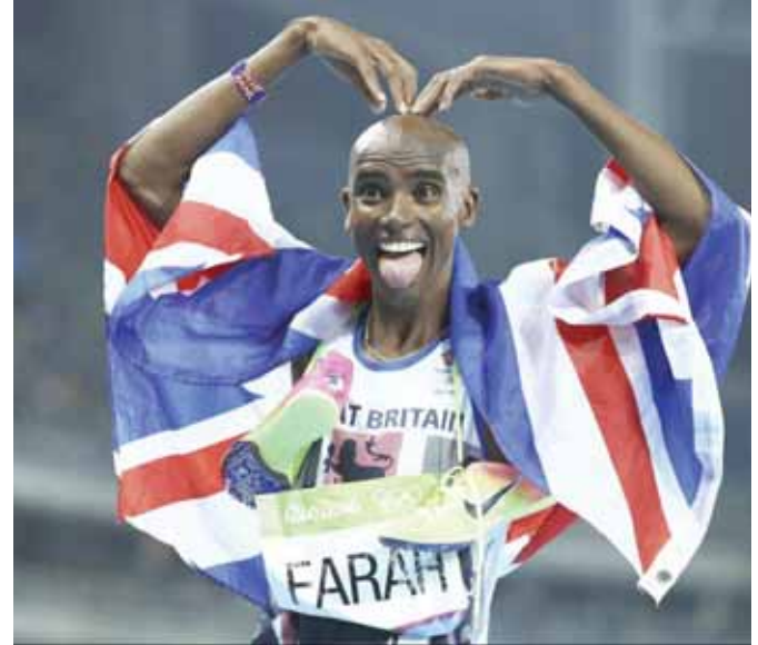
Mo Farah of Great Britain.