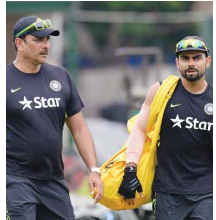
Former player Ravi Shastri is considered close to skipper Virat Kohli.

Master blaster Sachin Tendulkar and VVS Laxman are the other members of the BCCI's Cricket Advisory Committee.