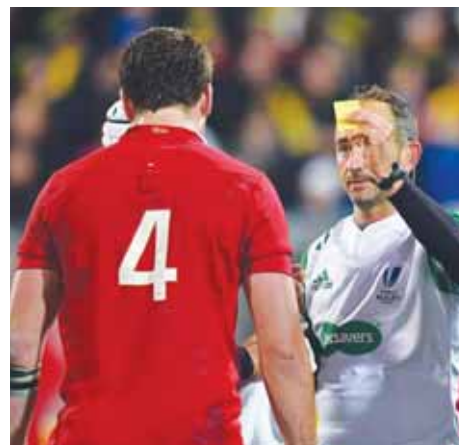
British and Irish Lions player Iain Henderson (L) is yellow carded by the referee for a dangerous tackle on Wellington Hurricanes' Jordie Barrett during their rugby union match in Wellington yesterday.

The Lions, however, managed to hold them out and had the opportunity to win the game only for flyhalf Dan Biggar to miss his drop goal attempt.