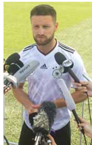
Germany's midfielder Shkodran Mustafi speaks to the press in Sochi yesterday.

Mustafi was left on the bench for Sunday's 3-1 win over Cameroon, but is set to feature in a