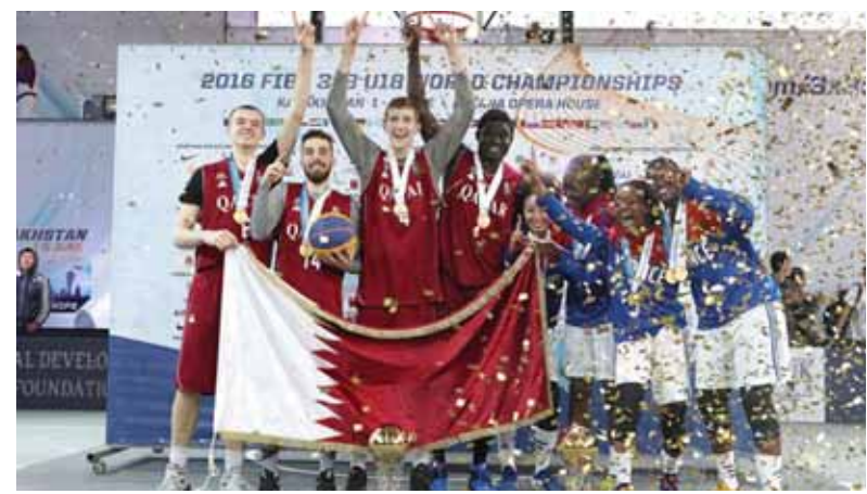
The World Cup winning Qatar U18 team in 2016.

Women: Andorra (AND), Argentina (ARG), Australia (AUS), China (CHN) (Hosts), Czech Republic (CZE), Egypt (EGY), France (FRA) (2016 winners), Germany (GER), Hungary (HUN), Italy (ITA), Japan (JPN), Kazakhstan (KAZ), Netherlands (NED), Russia (RUS), Singapore (SIN), Spain (ESP), Sri Lanka (SRI), Switzerland (SUI), United States (USA), Venezuela (VEN).