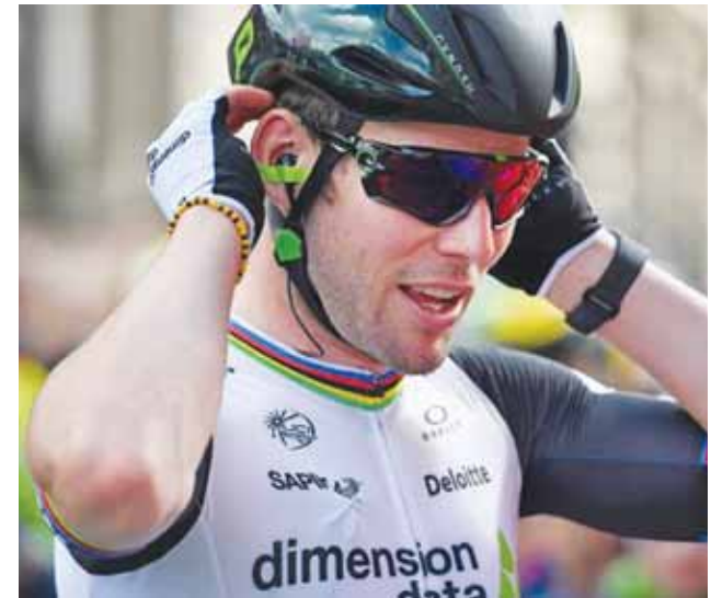
British cycling star Mark Cavendish