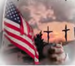
Pray for our troops