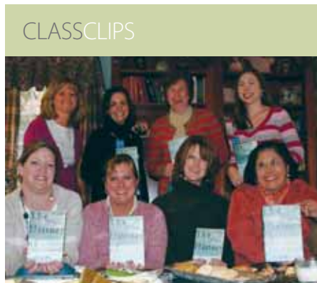
Members of the Dallas/Fort Worth Alumnae Club met to discuss the “One Book, One Saint Mary’s” selection, The History of Love .