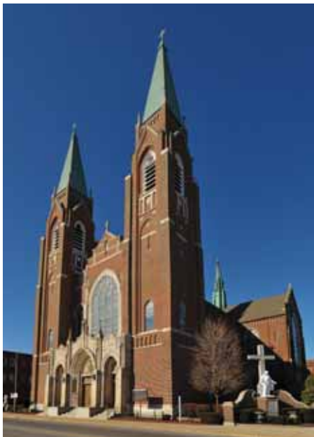
Saint Adalbert's Church on South Bend's west side.