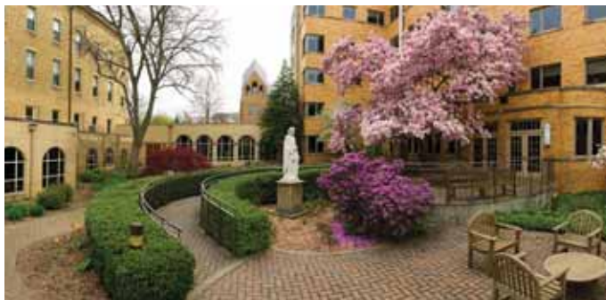
The courtyard at the Queen of Peace Convent

“In a green community, there is no predetermined routine to facilitate their independence or their ability to pursue individual interests,” said Chen. “It’s a good way to help older adults keep their independence and dignity while they continue to live in a homelike setting. They are able to receive