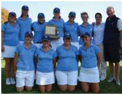
2010 MIAA Golf Champions