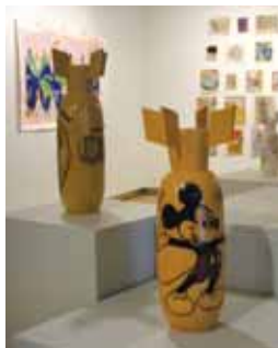
Pop Culture Bombs

civilians, and motionless carcasses that litter our minds just beyond our understanding. Their interpretations took the viewer through moments of delicate defiance in the face of destruction and pop icons stamped on small replicas of bombs.