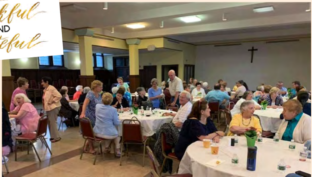
We had over 100 attendees for our Volunteer Appreciation Dinner hosted by the staff of the Collaborative. Thank you to all of our great volunteers. We couldn't do what we do without your dedicated service. May God continue to guide and strengthen us and lead us closer to Him.