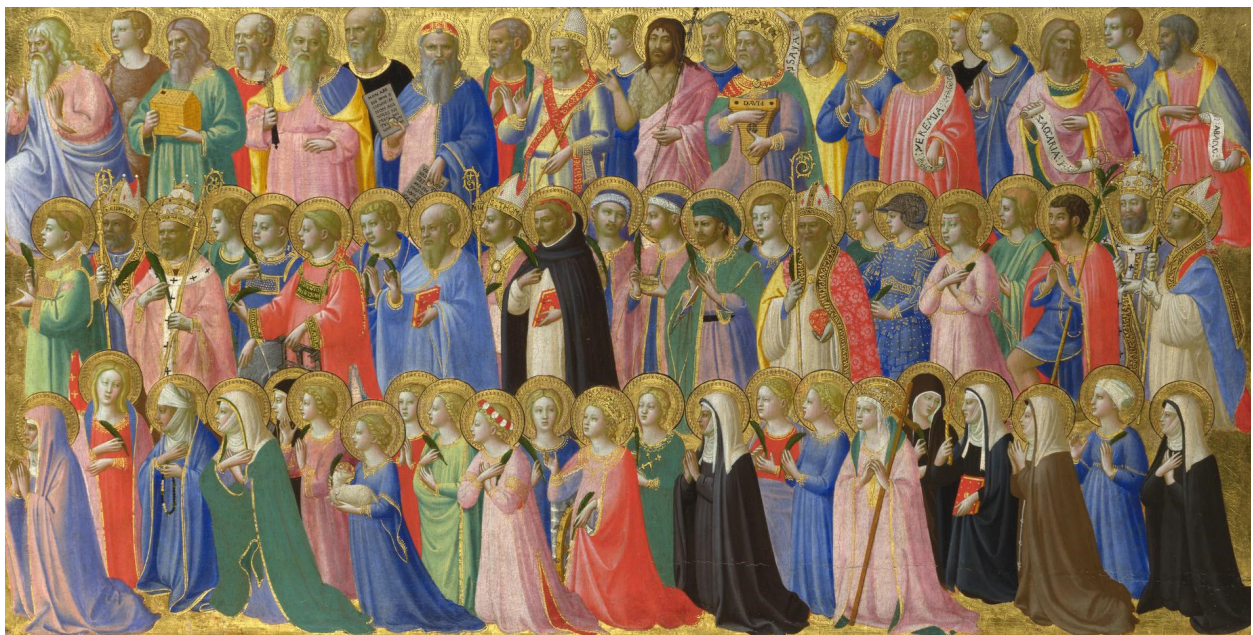
The Forerunners of Christ with Saints and Martyrs (c. 1423-24) - Fra Angelico (c. 1395-1455)

THE FEAST OF ALL SAINTS SUNDAY, NOVEMBER 1, 2020 TEN O'CLOCK IN THE MORNING