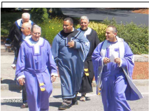
Stopping Traffic on Main St.