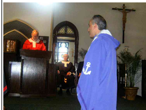
It Can Be Lonely at the Top!