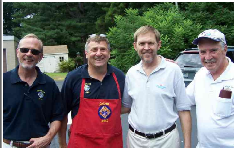
One of these is not a Knight (yet). Three are not Jesuits. (and not likely to become one!)