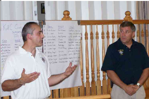
"Join me in a song!"