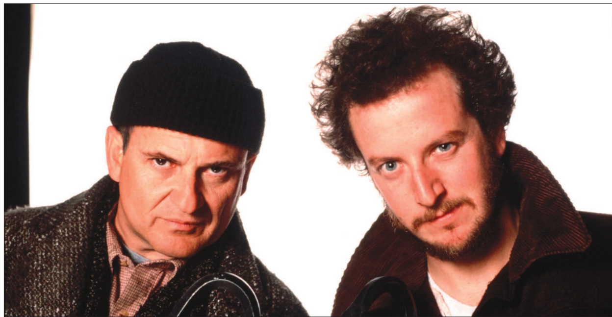
Joe Pesci and Daniel Stern are the Wet Bandits in "Home Alone"

What their villainy accomplishes for the viewer is invaluable. We know that Kevin is a lippy little