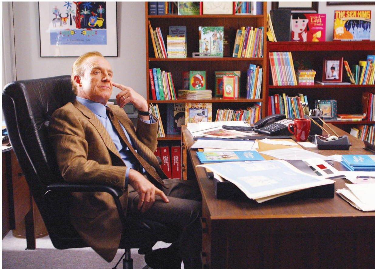
James Caan in "Elf"

A much newer take on this villain type is seen in "Elf" (2003), a film that is carving itself a place in the realm of holiday classics. Buddy (Will Ferrell,