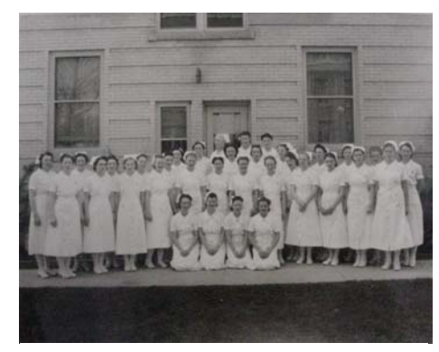
Nurses Class, 1941

Another "County Infirmary" opened on the property in early 1923 to replace the old County infirmary hospital. The older facility was then devoted strictly to "medical, surgical and obstetrical cases," and re-