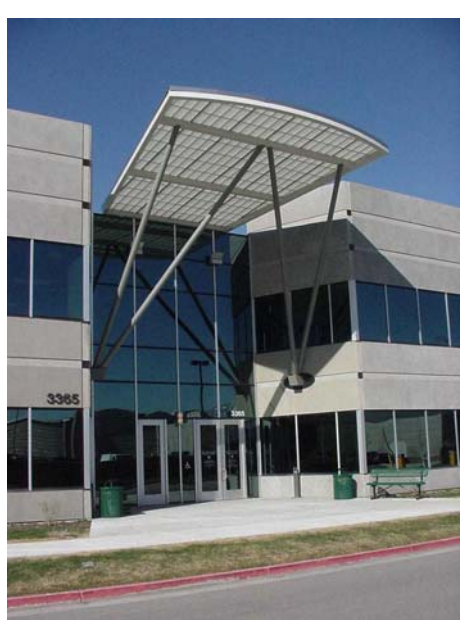
Sheriff's Office Building, March 27, 2002

At one time, the Sheriff's salary was the excess of what he did not spend on the care of jail inmates. For many years, he was