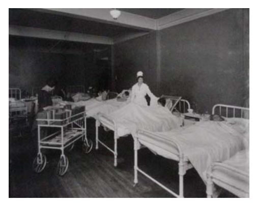
Hospital Ward, May 1, 1921

This jail operated until the mid-1960s, was demolished on August 6, 1966, and replaced by the modern "Metro Jail" at 450 South 300 East which, when it opened, had capacity for 311 inmates. This jail was contemplated as early as 1950, but according to the Sheriff's history, was delayed due to political wrangling. Metro jail is not far from the memory of most Salt Lake County residents since it continued operations through 1999, and was demolished in 2000. The new jail, or Adult Detention Center, at 3415 South 900 West opened in 2000