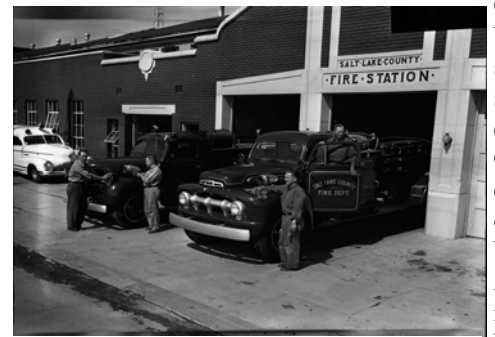
Salt Lake County Fire Department, May 28, 1952

The Salt Lake County Volunteer Fire Department, which in later years became a full-time operation, was organized No-