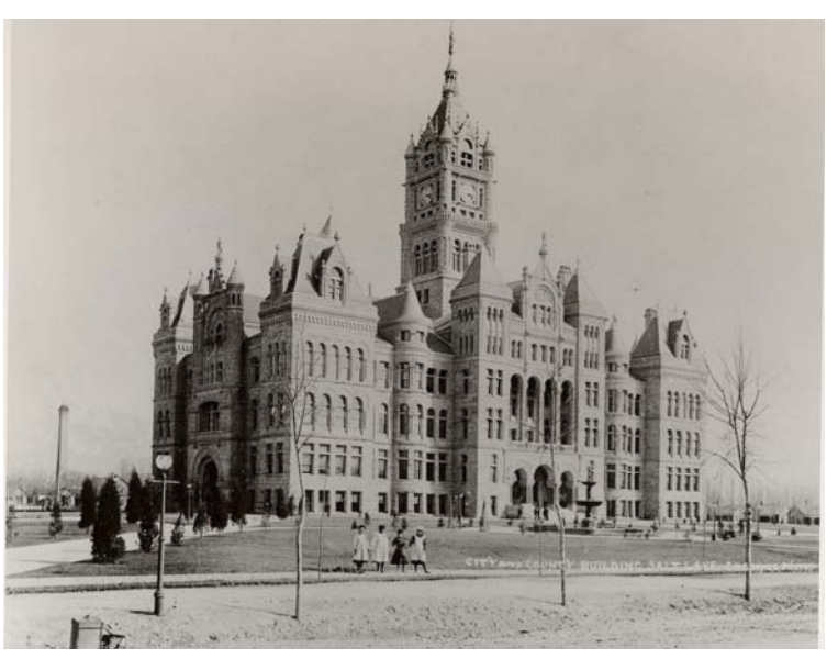
City and County Building, 1892

In addition to public works, public health also drew the attention of early County officials. For example, a small pox outbreak is addressed in the minutes of December 1, 1856. "Judge Smith reported that inasmuch as the small pox had broke out in the county