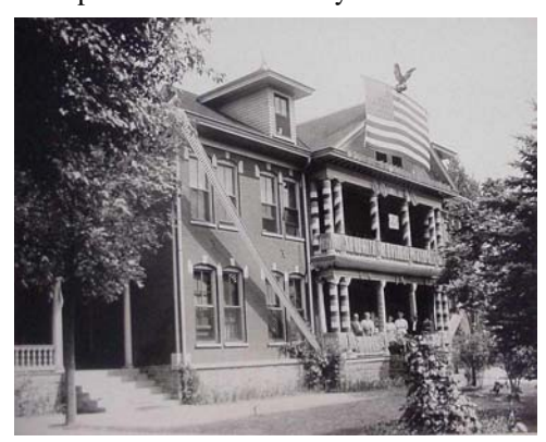
County Infirmary, 1880's-early 1900's

The County Hospital, a nearly-forgotten chapter in history, occupied the site of the current Salt Lake County Government Center at 2001 South State Street. Over the years, various buildings were constructed on the site for the hospital and "infirmary," an early term used in reference to a hospital. The County purchased this property on October 17, 1885 from a Louisa Ferguson of New York for $3,500. Shortly thereafter, the County built an "infirmary and asylum" on the site of the current Government Center south building. A picture of the infirmary is shown in