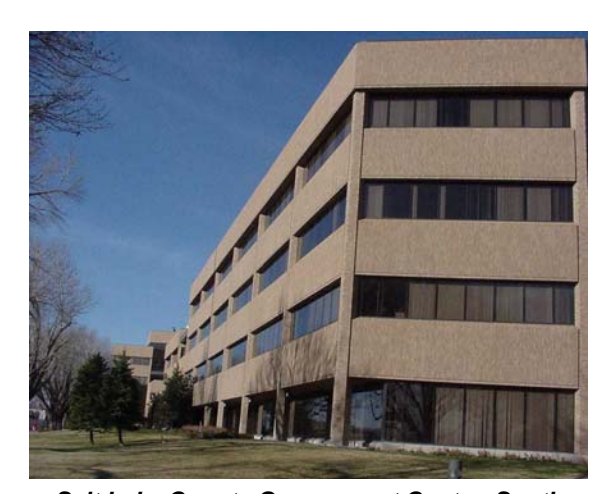
Salt Lake County Government Center, South Building, March 28, 2002

Bicentennial revelry also provided impetus for funding the restoration and renovation of the Capitol Theater, and construction of Maurice Abravanel Hall (used for symphony concerts), and the visual arts center. These three buildings were designated as a Bicentennial Arts Center Complex for which groundbreaking took place March 10, 1977 on the southwest