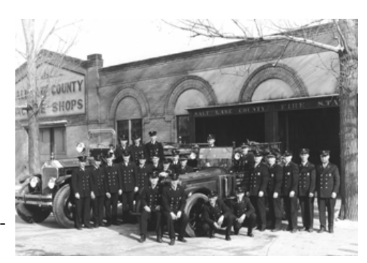
Salt Lake County Fire Department, circa 1927

So-called "poor houses," or "poor farms," were facilities common throughout the country in the 19<sup>th</sup> century that were operated by Counties. Salt Lake County also operated a