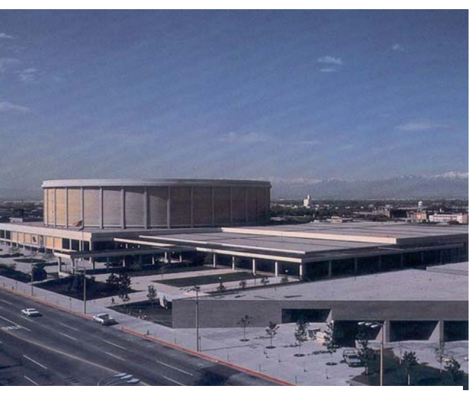
Salt Palace, 1980's

Federal Community Development Block Grant money received in the late 1960s and 1970s allowed for construction of the Central City, Redwood, Northwest and Copperview "Multi-Purpose Centers." Copperview, which opened in 1981, was the last multi-purpose center built of these four. These facilities were not only recreation centers. As part of the funding mandate they were to also provide daycare to low income families and space for health clinics and food banks. They also