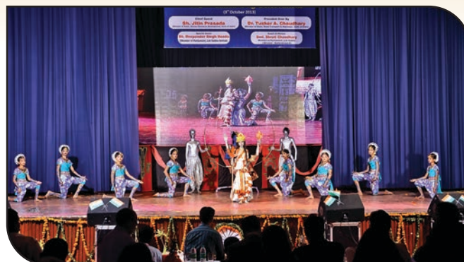
Dance presentation by girl students.