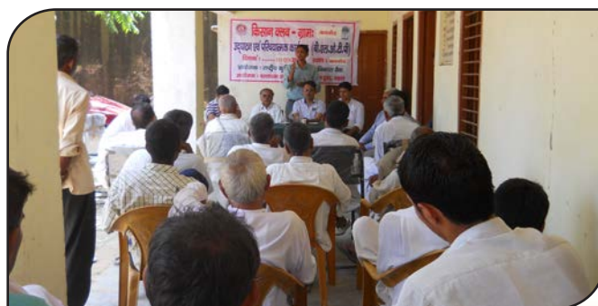
गांव कालोद में 10 सितम्बर, 2013 को आयोजित ब्लक स्तरीय परिचयात्मक प्रशिक्षण कार्यक्रम एवं किसान क्लब का उद्घाटन करते डी.डी.एम. नाबाई एवं अन्य सरकारी अधिकारी।