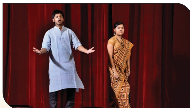
The Anchor Team of Annual Day Function.