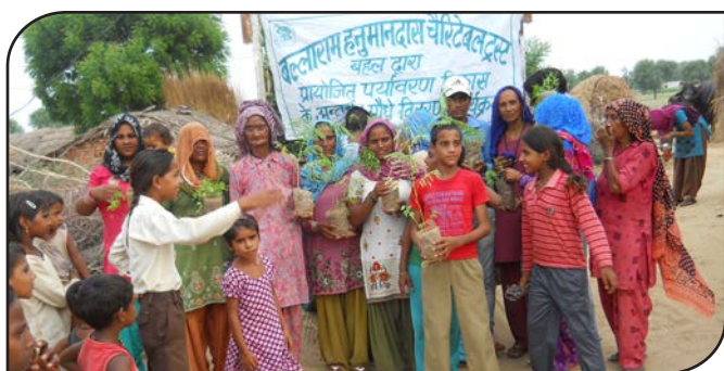
गांव पातवान में स्वयं सहायता समूहों व किसान क्लब के सदस्यों को पर्यावरण संरक्षण एवं विकास कार्यक्रम के अन्तर्गत 1 अगस्त, 2013 को पौधे वितरण करते ट्रस्ट के अधिकारी।