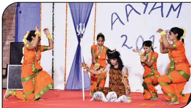
A Dance Drama "Karamshetra" being presented by the students of GDC Memorial College on the occasion of 2nd Annual Day Function.