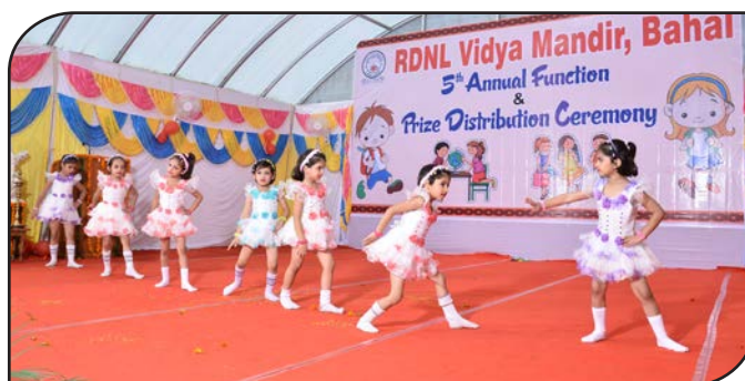
The Students of UKG and class I performing dance on Hindi Film Song "Chhoti Si Asha" to uplift the mood of parents on this occasion.