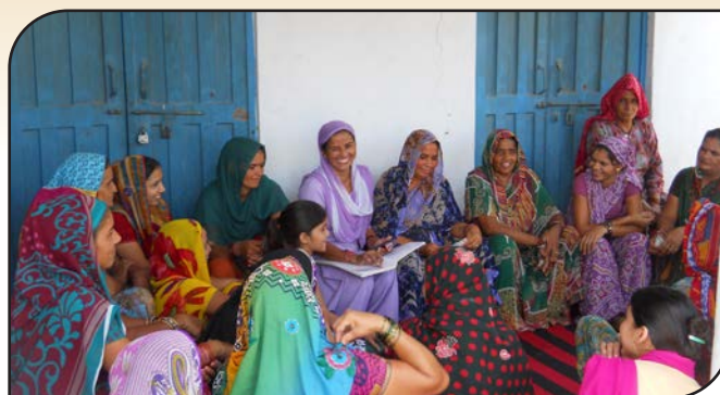
गांव मिटठी में 18 सितम्बर, 2013 को आयोजित स्वयं सहायता समूह की मासिक बैठक के दौरान परिचर्चा करते हुए समूह के सदस्य।