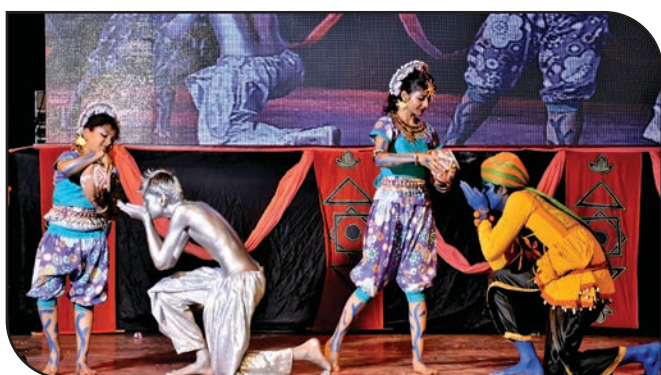
'Ardh Narishwar' – A dance drama by the students of Junior Wing