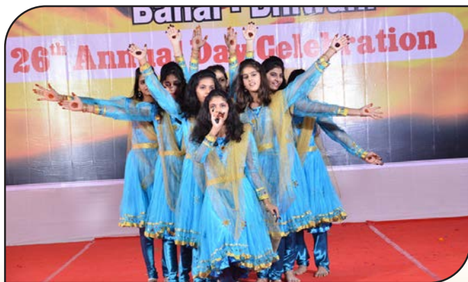
"Ore Chiriyaa" a dance drama on empowering girl children.