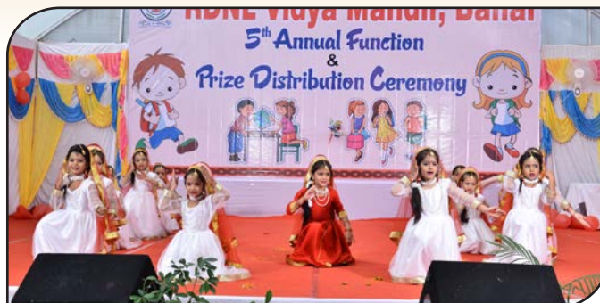
The energetic and enthusiastic Kids of Nursery & KG in ornate clothes giving a vivid performance of "Saraswati Vandana" on 28th of September, 2013 on the occasion of 5th Annual Day.