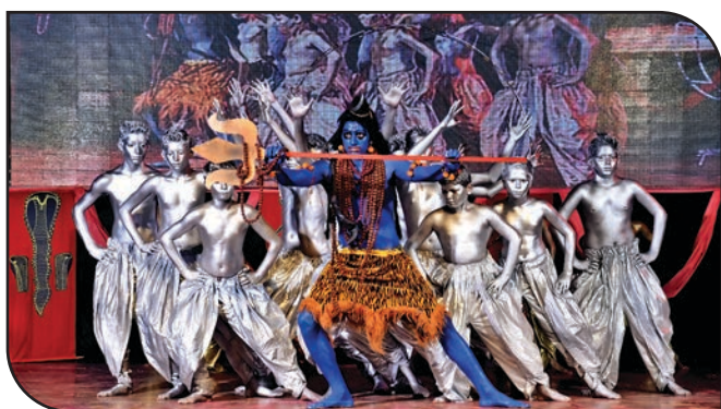
'Krishna' – A dance performance by the school students.