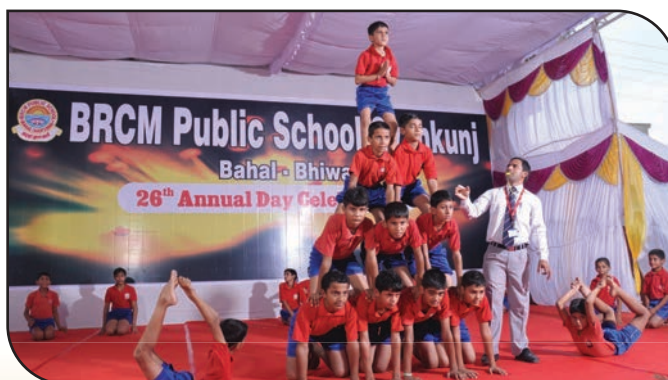
"Yoga, a Solace to Every One". A perfect act of Balance.