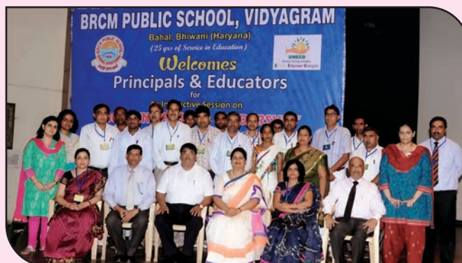
Participants of Principals' Conclave at Vidyagram