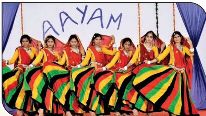
Rajasthani Folk Dance "Ghoomar" being presented by the girls students of GDC Memorial College on the occasion of 2nd Annual Day Function.