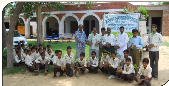
गांव पातवान में सरकारी व निजी विद्यालयों में स्कूल आउटरिच कार्यक्रम के अन्तर्गत 30 जुलाई 2013 को पौधे वितरण करते ट्रस्ट के अधिकारी।