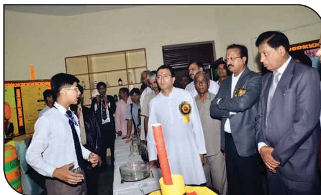
Sh. Jitin Prasada interacting with the students in the Science Exhibition.