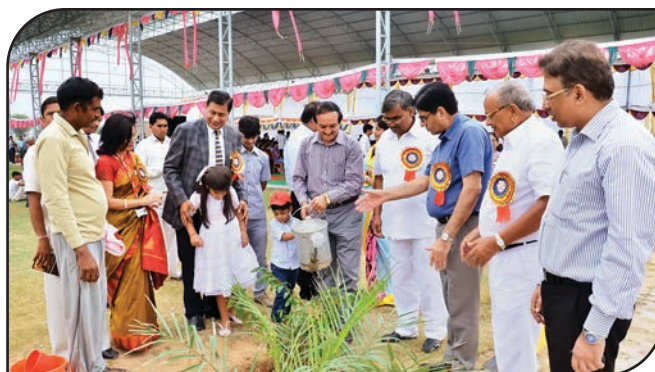
Chief Guest and other dignitaries planting the tree during the 2nd Annual Day Function on Oct. 4, 2013 in the college premises.