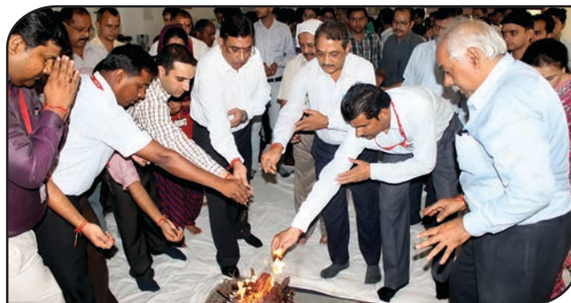
Vishwakarma Day was celebrated on Sept. 17, 2013 with 'Hawan' and 'Pooja' of tools and equipments by the Department of Mechanical Engineering.