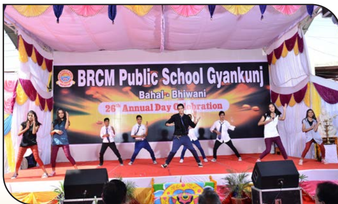
A latest bollywood number "Raghupati Raghav" mesmerizing the audience.