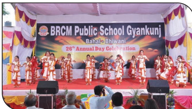
"Dancing with Perfect Steps" a joyous presentation by junior kids.