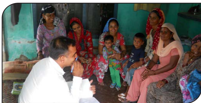
गांव मंडोली कलां में 28 अगस्त 2013 को आयोजित स्वयं सहायता समूहों की मासिक बैठक के दौरान समूह की सदस्यों को जानकारी देते ट्रस्ट के अधिकारी।