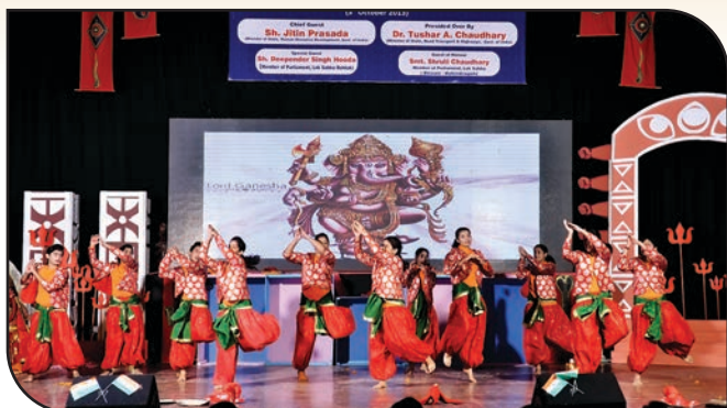
'Ganesh Vandana' – A dance presentation.