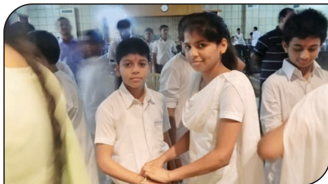
The tying of scared thread