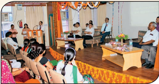
Orientation program for the newly admitted students in current session was organized on Aug.11, 2013.