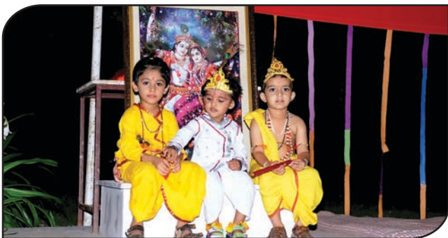
Bhajan Sandhya on Krishna Janmashtami by the students of Music Club, 'Saaz' on Aug.28, 2013.