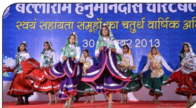
स्वयं सहायता समूहों के चतुर्थ वार्षिक अधिवेशन में सांस्कृतिक कार्यक्रम प्रस्तुत करते नर्तक कदम के विद्यार्थी एवं बीआरसीएम स्कूल की छात्राएं।