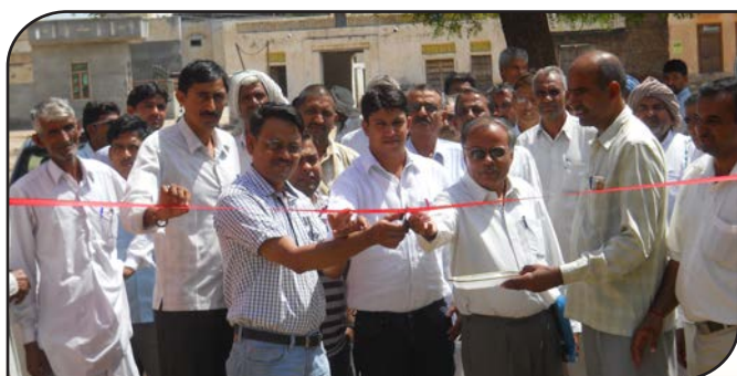
गांव गुड्डा में 10 सितम्बर 2013 को आयोजित ब्लक स्तरीय परिचयात्मक प्रशिक्षण कार्यक्रम एवं किसान क्लब का उद्घाटन करते डी.डी.एम. नाबाई, शाखा प्रबन्धक हरियाणा ग्रामीण बैंक, कालौद, एफ.एल.सी. काउन्सलर, भिवानी, ए.डी.ओ. सिवानी, पशु चिकित्सक, कालोद व अन्य सरकारी अधिकारी।