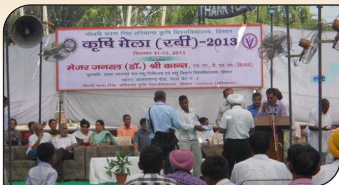
11 सितम्बर, 2013 को चौ. चरणसिंह कृषि विश्वविद्यालय हिसार में आयोजित कृषि मेले का शैक्षणिक भ्रमण करते किसान क्लब व क्षेत्र के किसान।