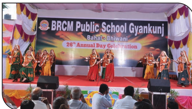
Students showcasing their excellent talent in dance and amusing the audience.