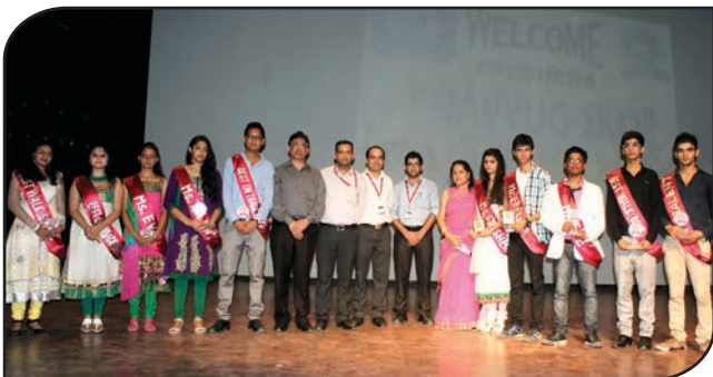
'Navyug-2013' Freshers' Night organized by Students Activity Club to welcome freshers on Sept.7, 2013.