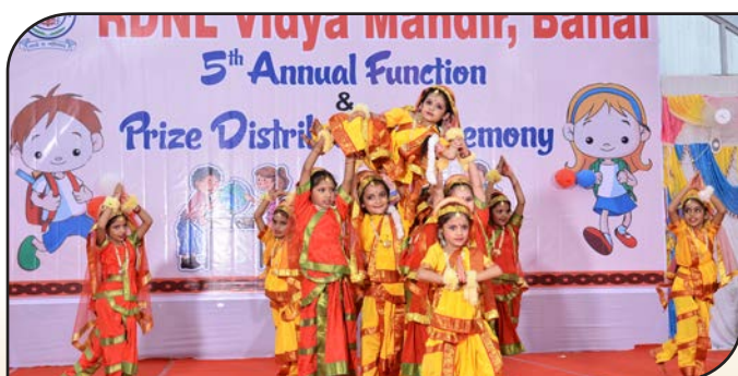
The lord of blessing and all new beginnings were invoked by tiny tots of Class II on the occasion of 5th Annual Day on 29th Sept., 2013