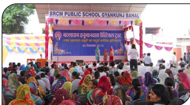
स्वयं सहायता समूहों के चतुर्थ वार्षिक अधिवेशन में सांस्कृतिक कार्यक्रम प्रस्तुत करते स्वयं सहायता समूह की महिलाएं।