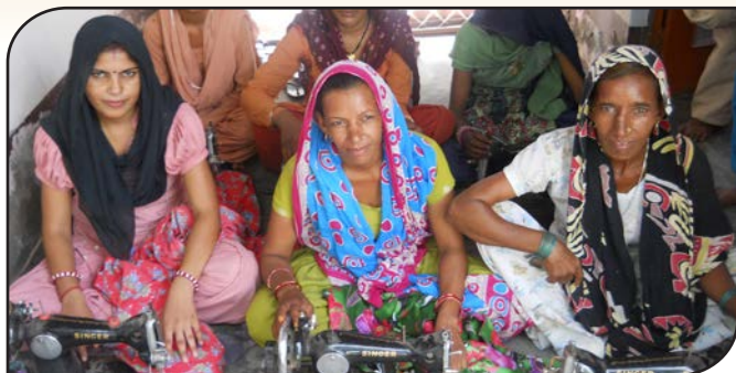
गरवा गांव में 18 जून 2013 को आयोजित कौशल विकास के अन्तर्गत सिलाई प्रशिक्षण कार्यक्रम में सिलाई का प्रशिक्षण प्राप्त करती महिलाएं।