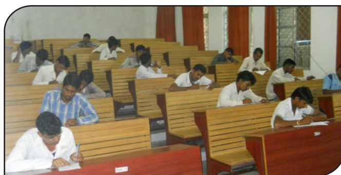
ट्रस्ट द्वारा 25 जुलाई से 24 अगस्त 2013 तक आयोजित दक्षता आधारित प्रशिक्षण कार्यक्रम के तहत इलेक्ट्रिक वायरिंग विषय पर बीएससीएम इंजीनियरिंग कॉलेज कैम्पस में परीक्षा में भाग लेते प्रशिक्षणार्थी।