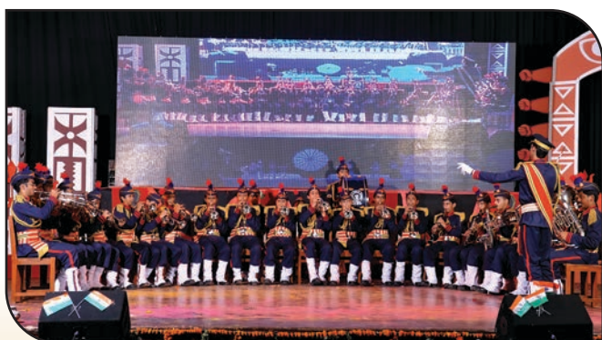
Performance of Brass Band by BRCM students.