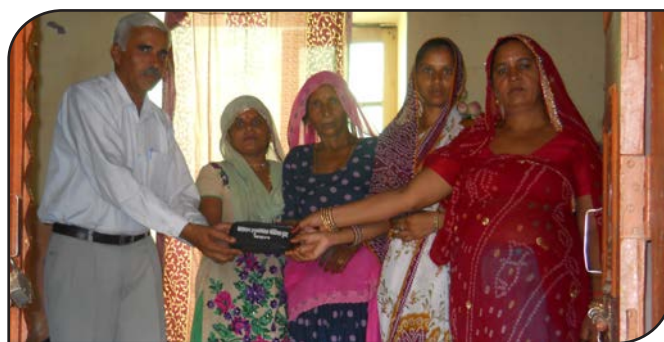
स्वास्थ्य के प्रति जागरूक रहने की दिशा में 4 सितम्बर 2013 को बहल के स्वयं सहायता समूहों को मेडिकल किट देते ट्रस्ट के अधिकारी।