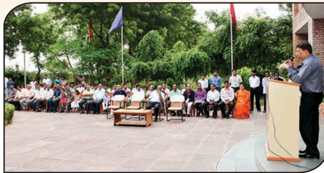
Faculty members & students celebrated 67th Independence Day with great zeal and passion.