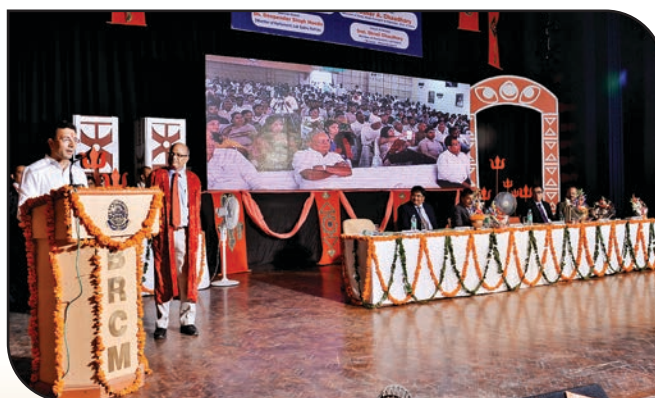
Sh. Jitin Prasada, Union Minister of State (HRD) addressing the students of BRCM Public School, Vidyagram during the Annual Day Function.