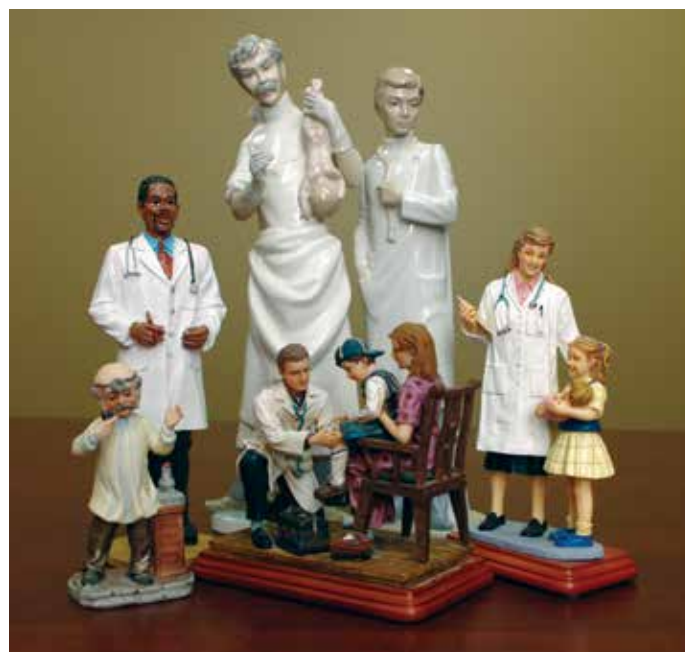
Samples from the figurine collection.

The figurines are currently on display in the curio cabinets in the SLMMS office conference room. The Society invites you to stop by and peruse the collection, and extends its deepest gratitude