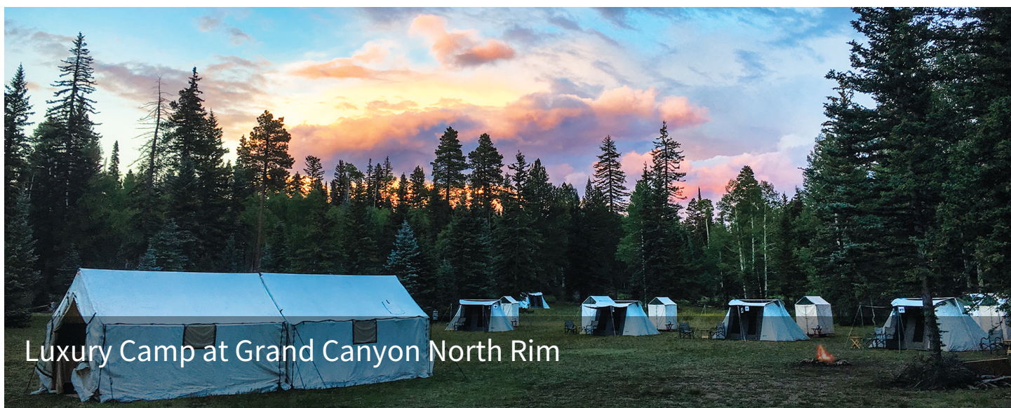
Luxury Camp at Grand Canyon North Rim

Note: Your luxury campsite will be set up in the Kaibab National Forest approximately 15 minutes from the entrance to the Grand Canyon.