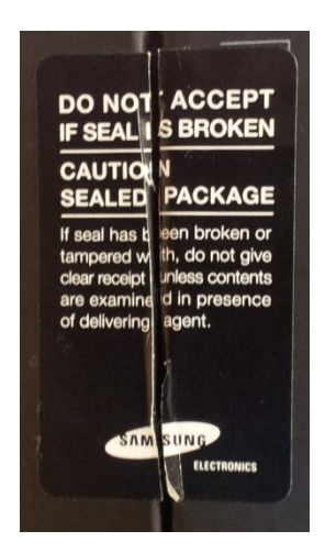
Figure 3 - Security Seal (Black)