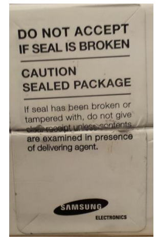
Figure 4 - Security Seal (White)