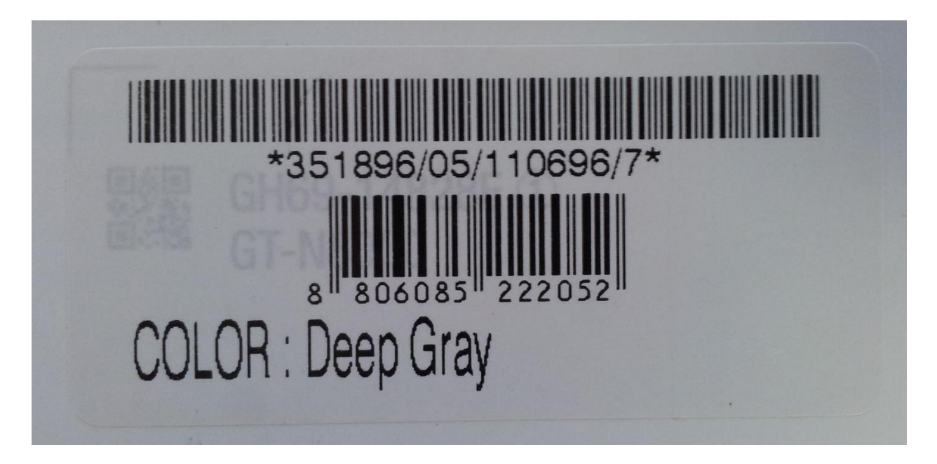
Figure 2 - Tracking label

The tracking label should look similar to Figure 2 - Tracking label, while the two tamper labels should appear similar to Figure 3 - Security Seal (Black) or Figure 4 - Security Seal (White).