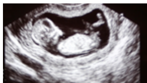
Sanctity of Human Life Sunday