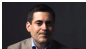
Russell Moore on Planned Parenthood