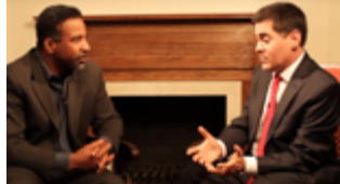
How to think about Planned Parenthood