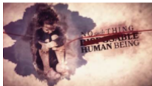
Imago Dei: The Image of God