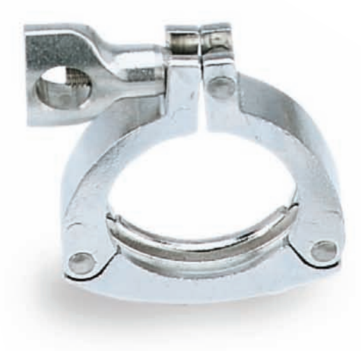
Tri-Clamp - The industry standard.

A connection is made up of a plain ferrules, a threaded ferrule, a nut and a gasket. The faces on Bevel Seat fittings are angled to create a metal to metal sealing surface. A John Perry fitting consistes of a flat-faced threaded ferrule, a flat-faced plain ferrule and a profiled gasket. These joints are particularly useful with swing connections and flow diverter panels. A DC fitting utilizes the Bevel Seat plain ferrule and a threaded ferrule with a grooved face to retain a gasket. The three types of threaded fittings are designed for use in the food, dairy, and beverage processing industries. Bevel Seat Joints are in compliance with 3A standards for manual cleaning. Both John Perry and DC fittings are in compliance with 3A standards for CIP.