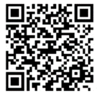
Scan Barcode to Access 4-H App on Your Smartphone