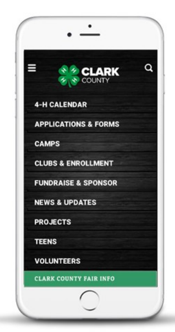
Access 4-H and Fair Results, Show Bills, Fair Schedule, Rules, Updates and More