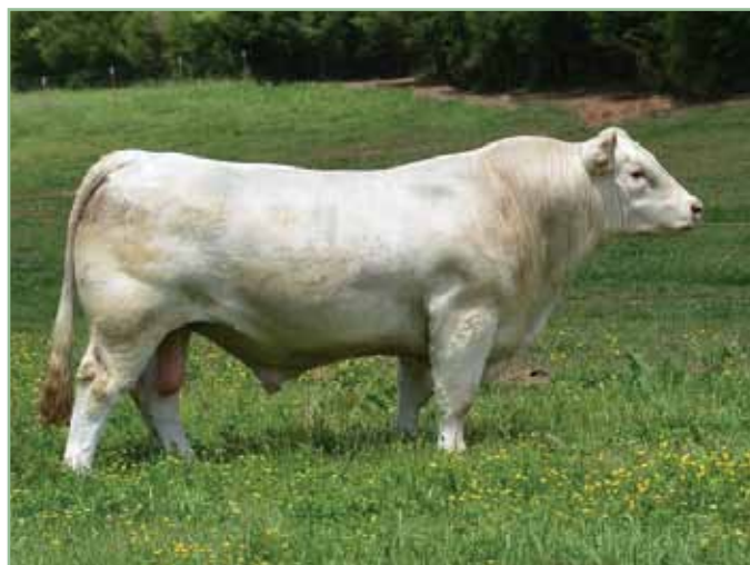
JDJ Maximo A18 Two straws furnished to breed heifer.