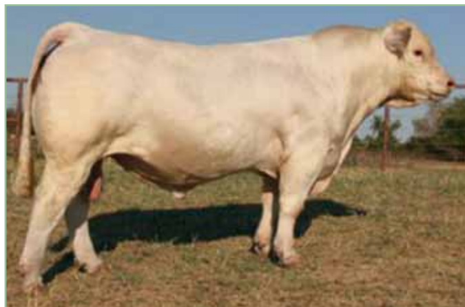
M6 FRESH AIR 8165 P ET , sire of lot 54