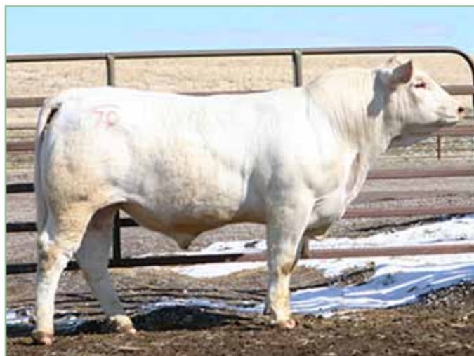
BHD ZEUS X3041, maternal grandsire of lot 7