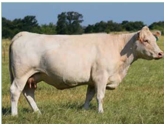
LOT 56, TP FIRST LADY X022