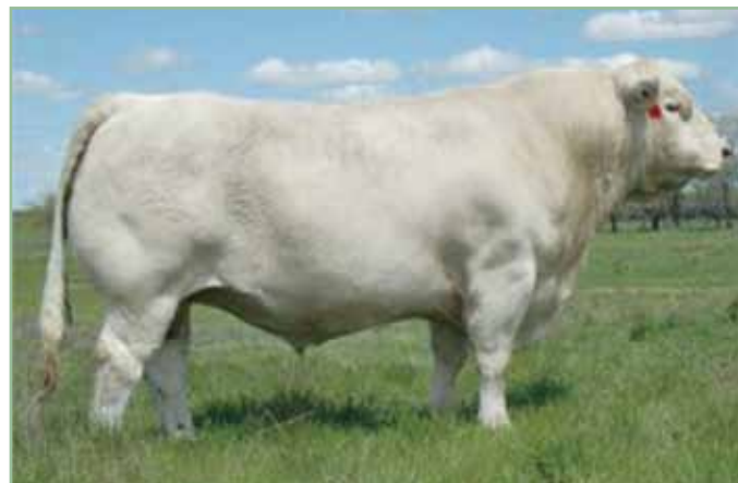
LT BLUEGRASS 4017 P, sire of lot 27