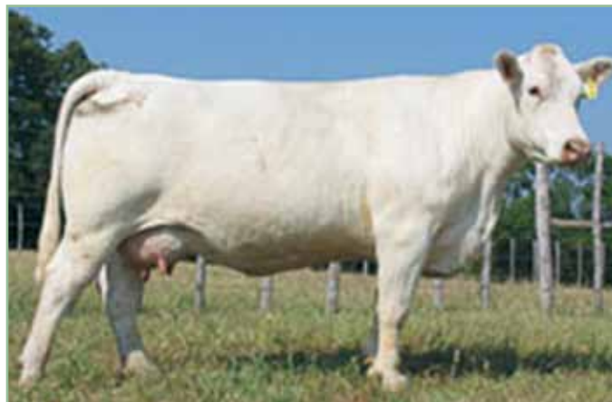
SR LADY EASE 914 ET , paternal granddam of lot 52