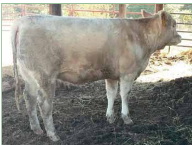
Lot 45, WC SIMPLY IRRESISTIBLE 591 P