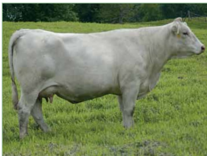
D&D MS CLARICE 2809 PLD, donor dam to lot 39 embryos