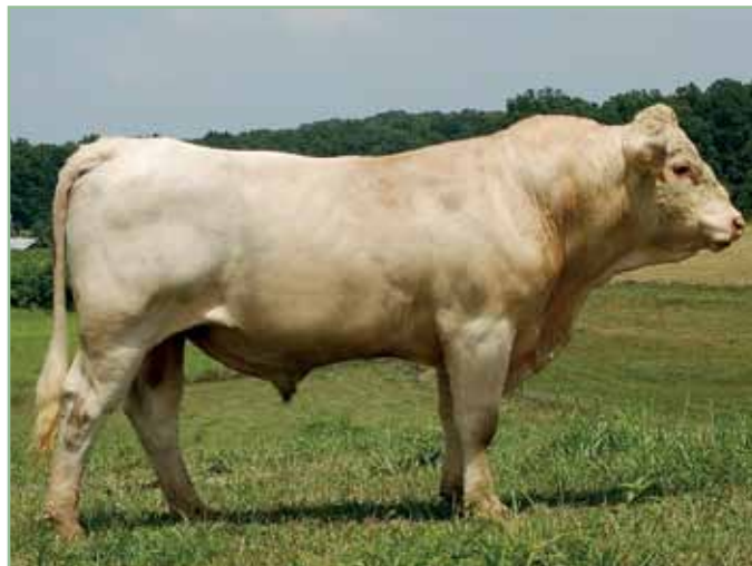
Lot 5, REAVES MR COMMAND 0374