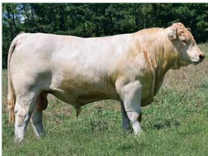
Lot 1, OHF MAX'S 5906