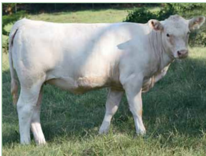
Lot 28A, SILVER BELLE X2044 x LEDGER 0332 P