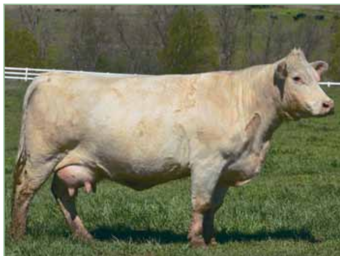
C5 MS DUKE 1705 PLD ET, dam of lot 34