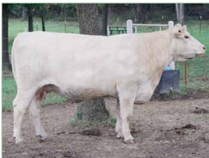
LOT 57, BARA MS REALITY LACI 18X P ET