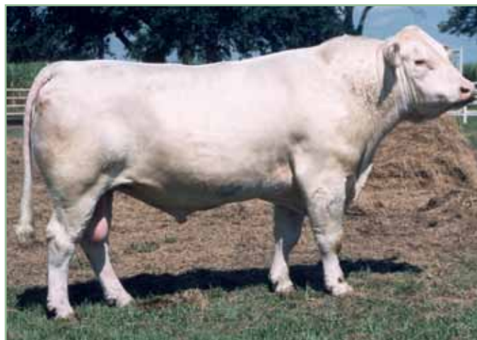
LC BUSINESS 06P , sire of lot 53