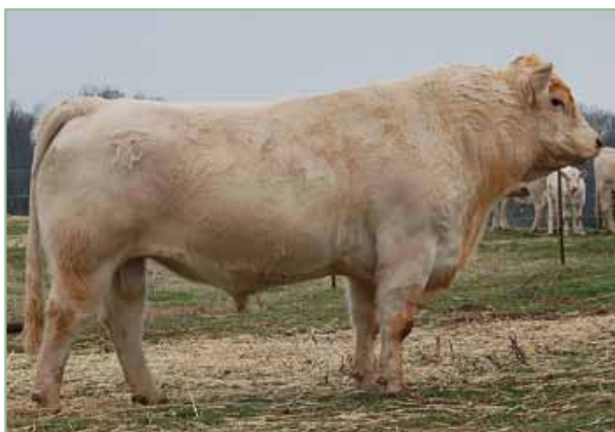
BHD SLY ILLUSION T3132, sire of lots 44 and 45.