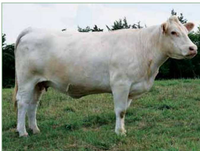
Lot 50, OHF LADY VA J303