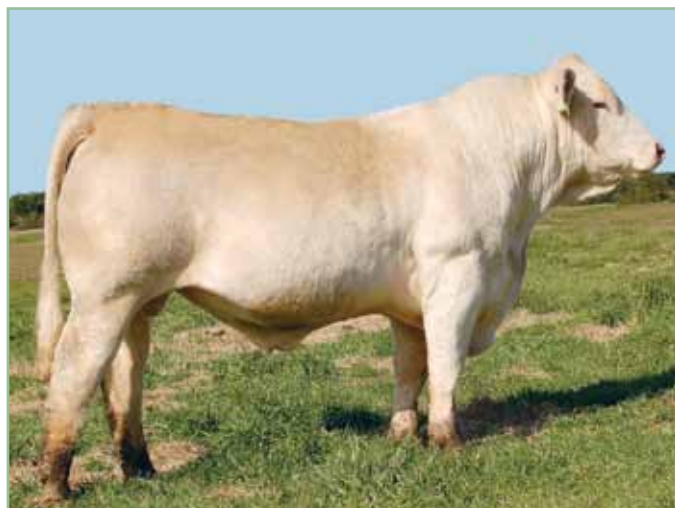
EC RELIABLE 5043 PLD , sire of lot 20