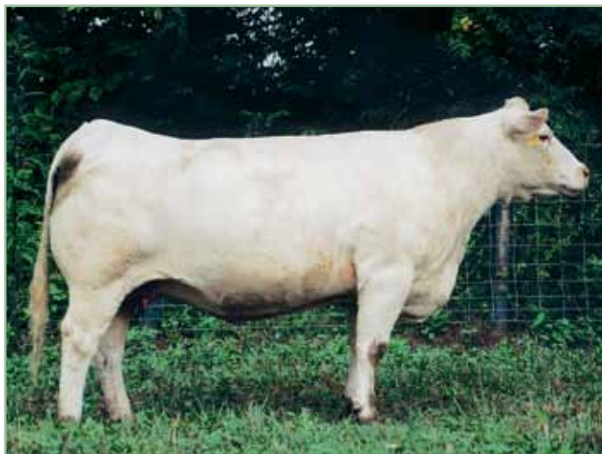
JWK VERNA E225 ET , paternal granddam of lot 64