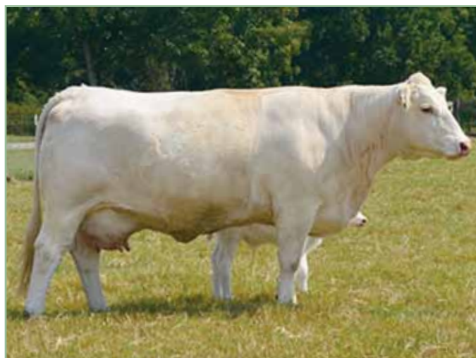
Lot 13, BAMBOO NANCY'S PASSPORT 1375ET