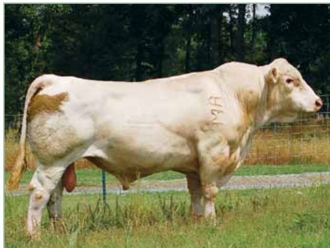
WCR SIR DUKE 7340 P , sire of lot 17