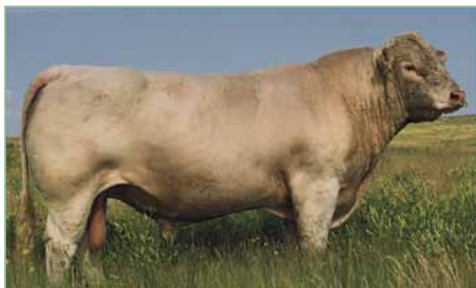
LT WYOMING WIND 4020 PLD