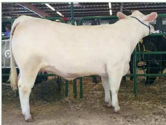
WELCOME GROVE REALITY , dam of lot 55