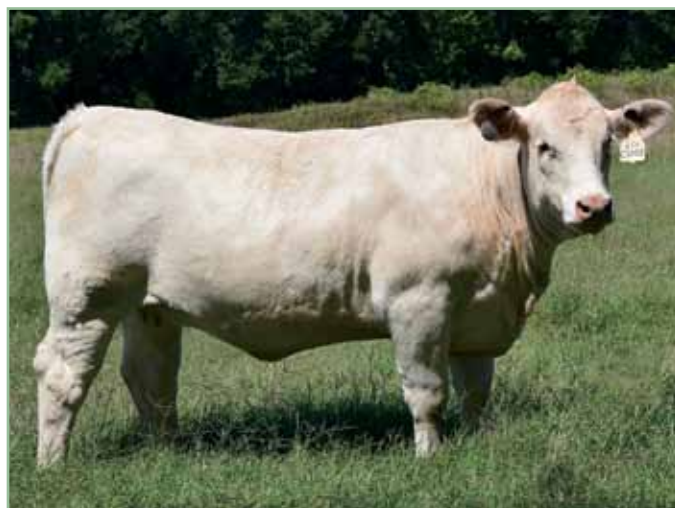
LOT 60, RC MS CURICE C601