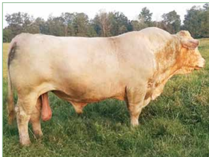
LHD EMBLEM Y1244 P/S, sire of lot 48