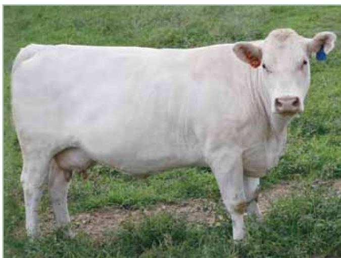
KTR LADY SMOKE GI 274, dam of lot 51