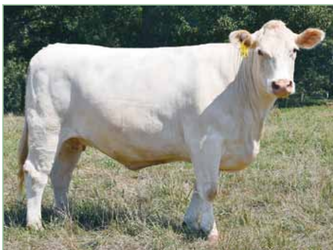
Lot 23, OHF MS 3T CIGAR 593 P