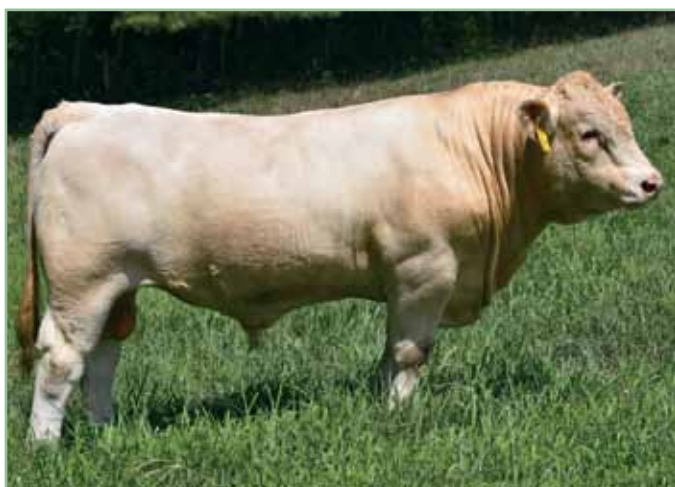
Lot 2, OHF CIGAR 5815 ET