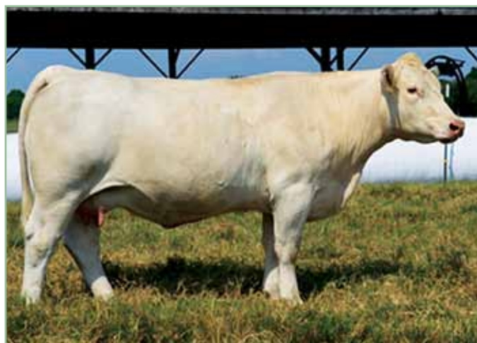
Lot 11, BAMBOO VANESSA 169 ET OF 4131