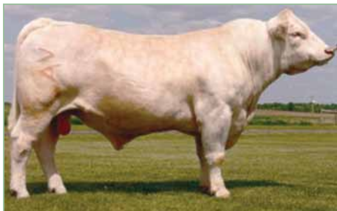
VCR DUKE 914 PLD , selling ten units of semen