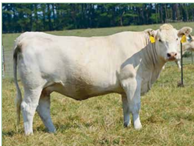
Lot 16, BAMBOO MS DUKE 4332