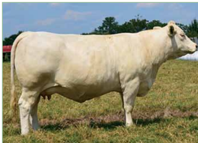
Lot 12, BAMBOO MS VANESSA 1329