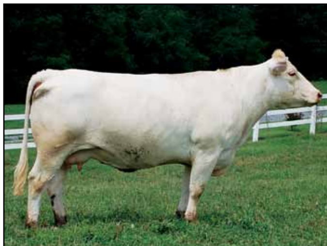
MCF LADY GI DUKE 5003 PET, dam of lot 41