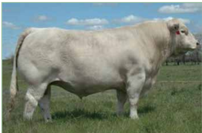
LT BLUEGRASS 4017 P