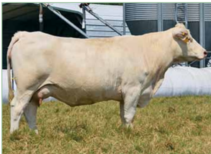
Lot 15, BAMBOO MS COMMANDER 3301 ET