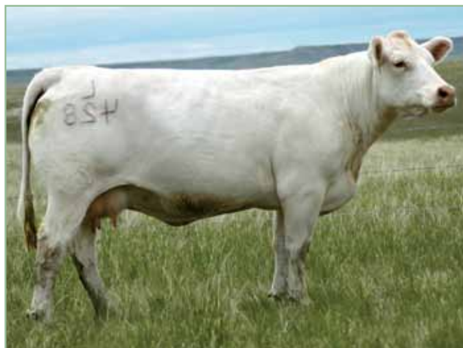
JDJ MS DYNASTY L428, donor dam to lot 40 pregnancy