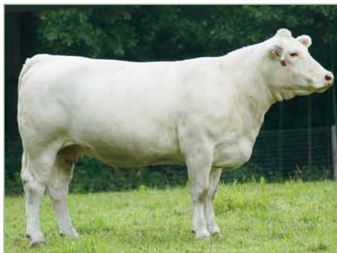
Lot 42, OHF 165 PRESAGARA 301