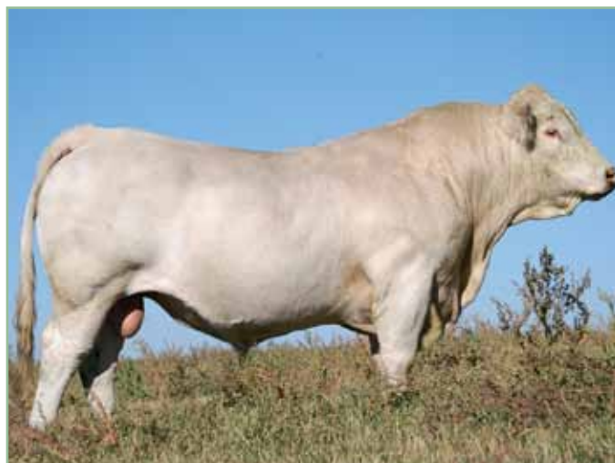
CJC MR PRESIDENT T122 , sire of lot 58