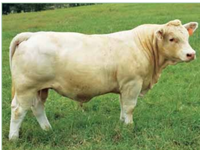
Lot 10, JBC FULL THROTTLE 508 P.ET