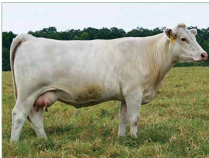
Lot 21, BAMBOO MS DUKE 89A OF 325 ET