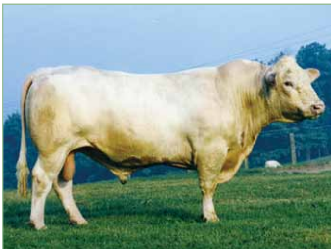
JWK VENDETTA G221 ET , sire of Lot 8