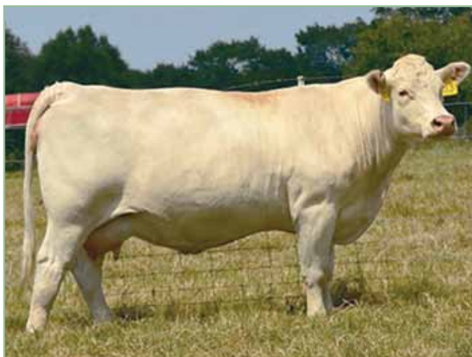
Lot 14, BAMBOO MS TABBY 531 ET OF M02