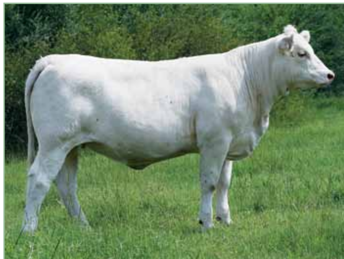
Lot 46, SCF MS SMOKIN ELIZA-PLD ET