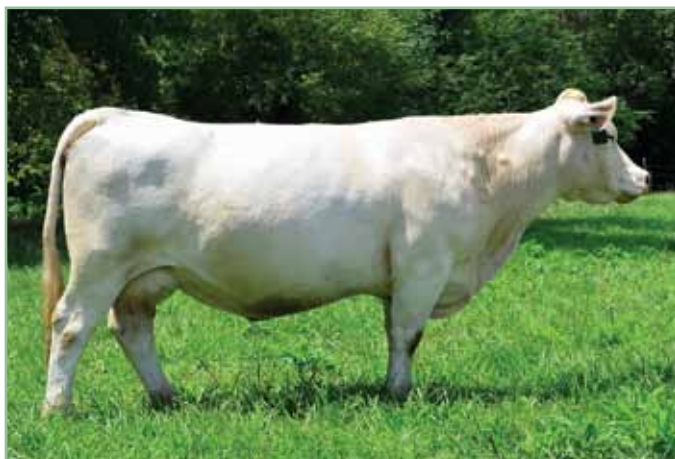
LOT 30, OHF MISS KOJAK J102