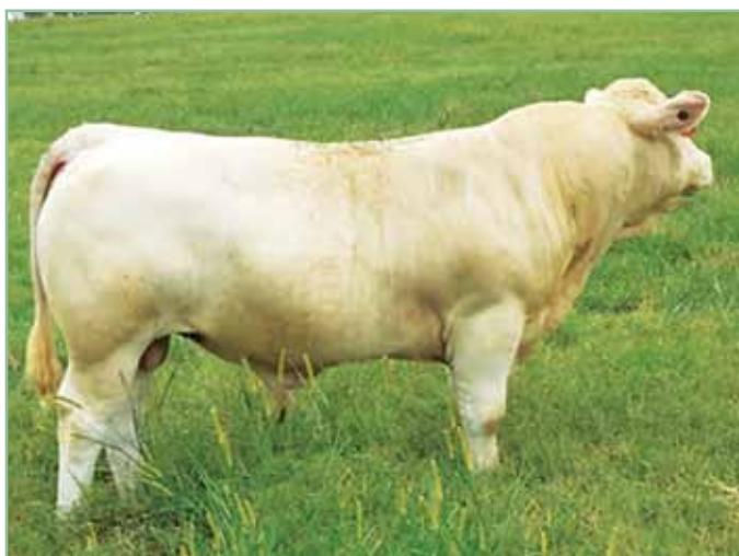
Lot 9, JBC MR PRESIDENT 507 P.ET