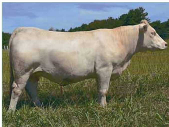
Lot 31, EJS MS RANCHER 421 PLD