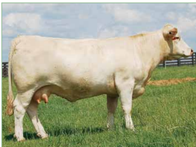
Lot 22, OHF SHE SMOKEING C903