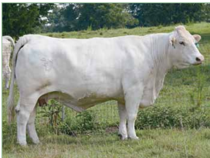
Lot 43, DCF THUNDER STRUCK 844 P