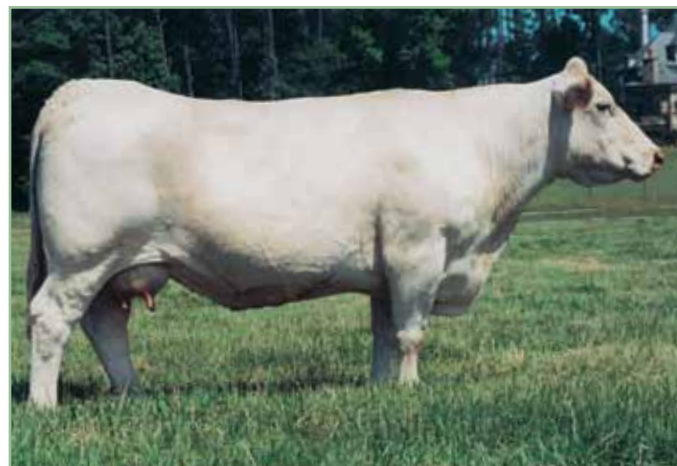
JWK VANESSA D029