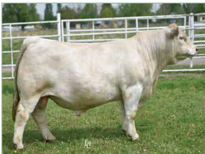
LT RIVER DANCE 4114 P ET, AI service sire of lot 29