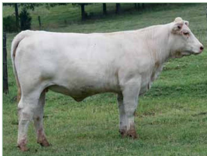
Lot 47, JBC MS PRESIDENT 504 P.ET