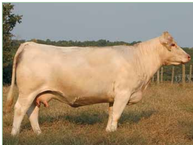
OHF VANNA G214, dam of lots 5 and 6