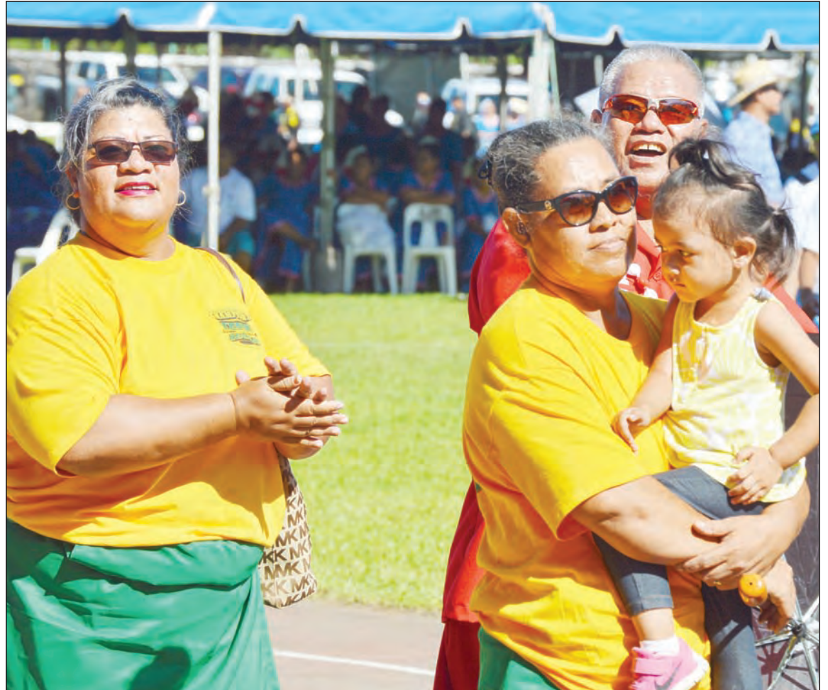
Ni isi o matua sa auai i solo o savali o le fu'a i le aso Gafua na te'a nei ma si'i a latou fanau.