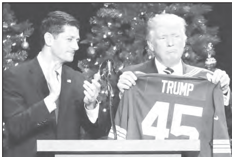
FILE - In this Dec. 13, 2016, file photo, President-elect Donald Trump holds up Green Bay Packers jersey given to him by House Speaker Paul Ryan at a rally in West Allis, Wis. President Donald Trump heads to Ryan’s congressional district in Wisconsin on Tuesday, April 18, 2017, facing low approval ratings and in the wake of his failure to fulfill a campaign promise to repeal and replace the federal health care law.

Congress is considering several bills to overhaul the visa program. One, introduced by Illinois Democratic Sen. Dick Durbin and Iowa Republican Sen. Chuck Grassley, would require companies seeking H-1B visas to first make a good-faith effort to hire Americans, a requirement many companies can dodge under the current