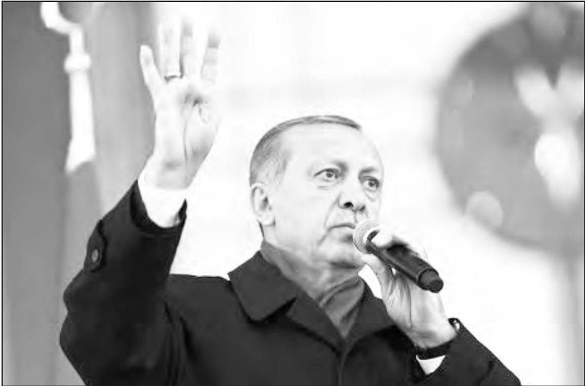
Turkey's President Recep Tayyip Erdogan, delivers a speech during a rally of supporters a day after the referendum, outside the Presidential Palace, in Ankara, Turkey, Monday, April 17, 2017. Turkey's main opposition party urged the country's electoral board Monday to cancel the results of a landmark referendum that granted sweeping new powers to Erdogan, citing what it called substantial voting irregularities.

ISTANBUL (AP) — Turkish President Recep Tayyip Erdogan has finally fulfilled his long-held ambition to expand his powers after Sunday's referendum handed him the reins of his country's governance. But success did not come without a cost.