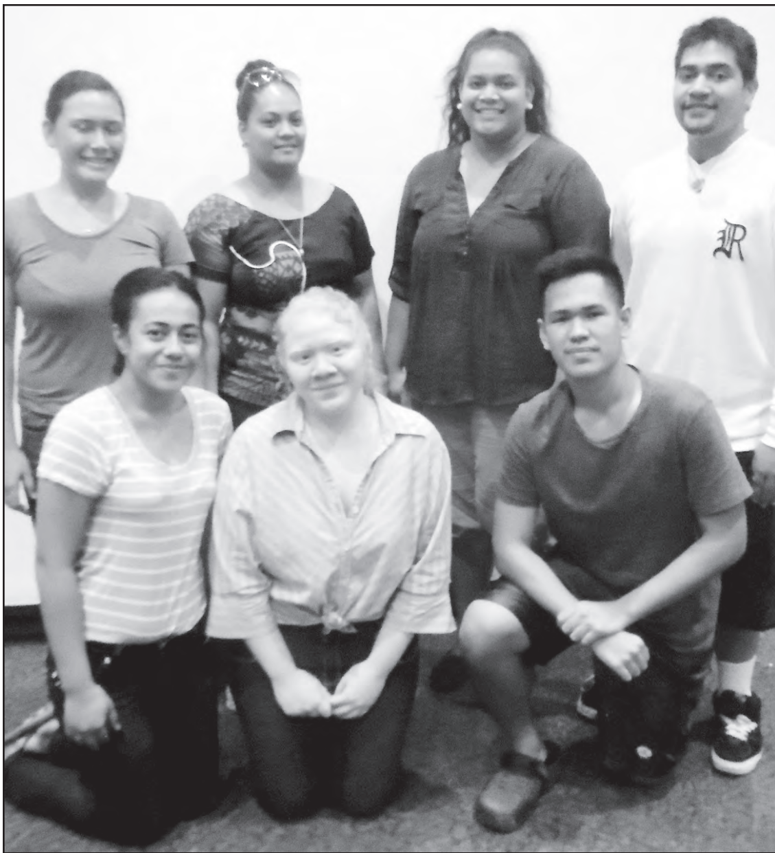
ASCC students who will take part in this year's Literary Night take a break from rehearsals. Literary Night, with this year's theme of "Unity Through Literature," will take place this Thursday at 6 p.m. in the Lecture Hall. Admission is free and the public is welcome.