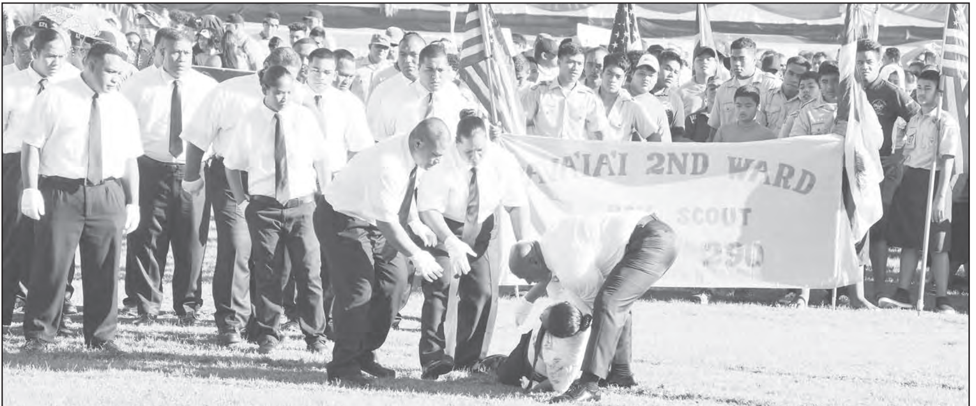
Se tasi o vaaiga sa molimauina e le atunu'u i le taimi o le sauniga o le sisigafu'a i le aso Gafua na te'a nei i le malae taalo i Tafuna, ina ua pau i lalo se tasi o sui o le Vaega o Leoleo Fou a le Matagaluega o Leoleo, ma vaaia ai loa le taumafai atu o isi sui o le latou vaega e fesoasoani i le tama'ita'i sa pau i lalo.