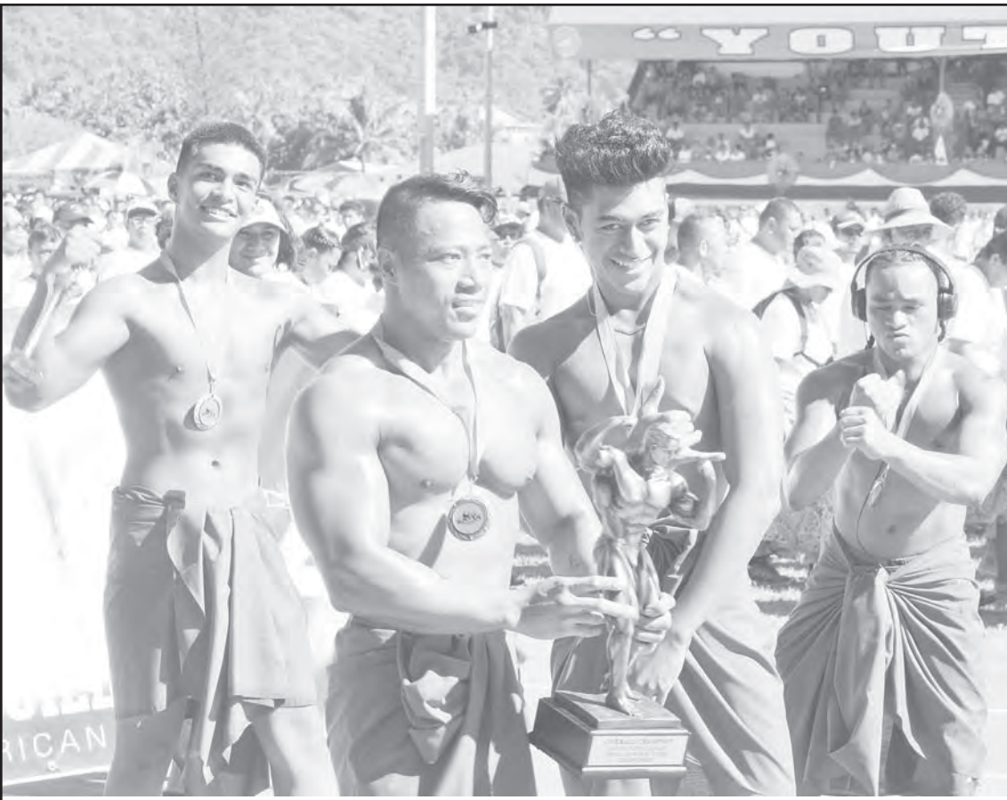
Ni isi o alo o le atunu'u sa auai i le tausinioga o le Fa'aali Tino i le tauvaga a le Sau Ia sa faia i le vaiaso na te'a nei i le Fale Laumei, ma latou manu ai fa'ailoga o le manumalo.