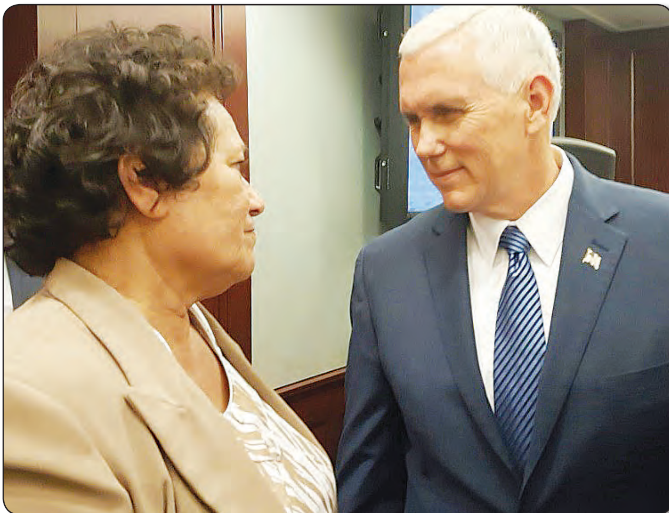
Congresswoman Aumua Amata and US Vice President Michael Pence discuss American Samoa issues in the U.S. Capitol. Pence will be stopping over in American Samoa this Sunday. The centerpiece of his visit is the dedication of the Veterans Administration outpatient clinic to the memory of the late Congressman Eni F.H. Faleomavaega, who passed away in February at his home in Utah. See story below.

Felanulanua’i lagona o le atunu’u e fa’atatau i le fu’a o lenei tausaga Le Lali