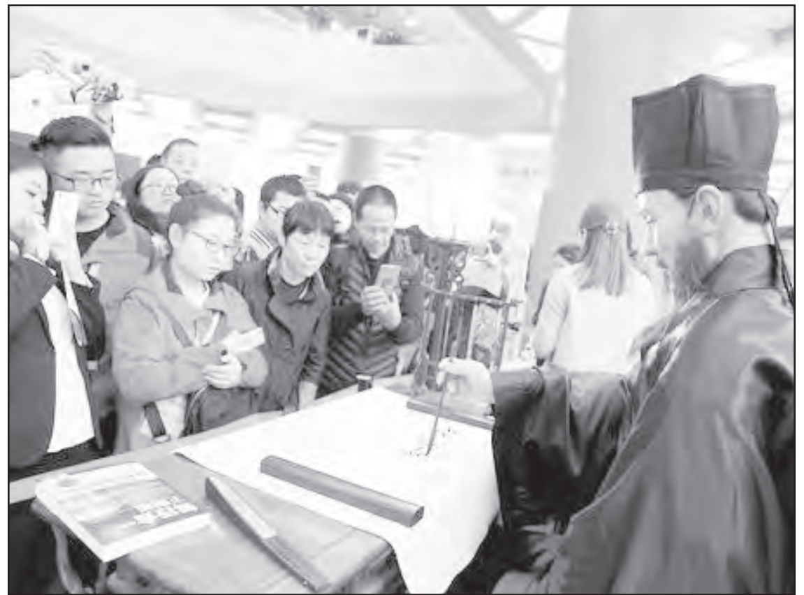
In this Oct. 21, 2016 photo, visitors look at a robot capable of writing calligraphy during the World Robot Conference in Beijing. China's push to develop its own technology and other industries has "narrowed the space" for foreign companies to compete in its market, an American business group said Tuesday, April 18, 2017, and it appealed Beijing to carry out market-opening pledges. Foreign companies are especially concerned about government initiatives to develop competitors in electric cars, robotics, biotech and other fields.