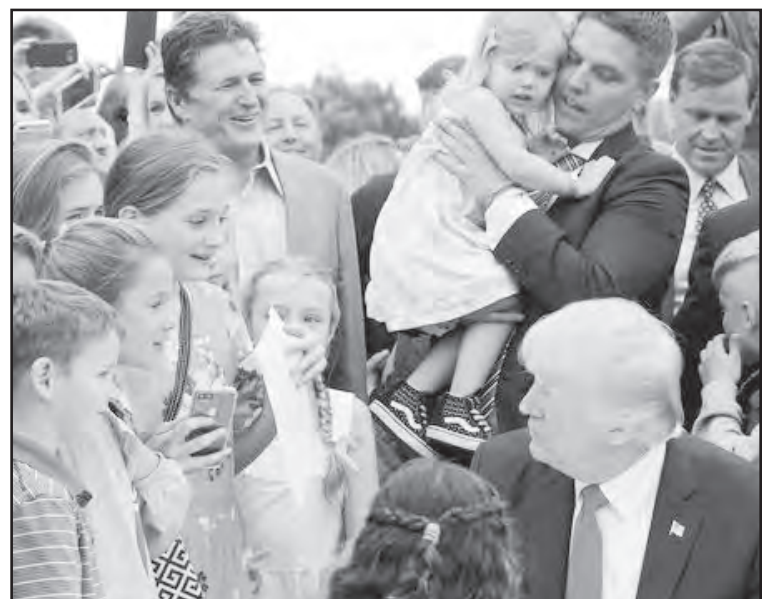
President Donald Trump talks with children as he sits down to write a letter to a service member during the annual White House Easter Egg Roll on the South Lawn of the White House in Washington, Monday, April 17, 2017.