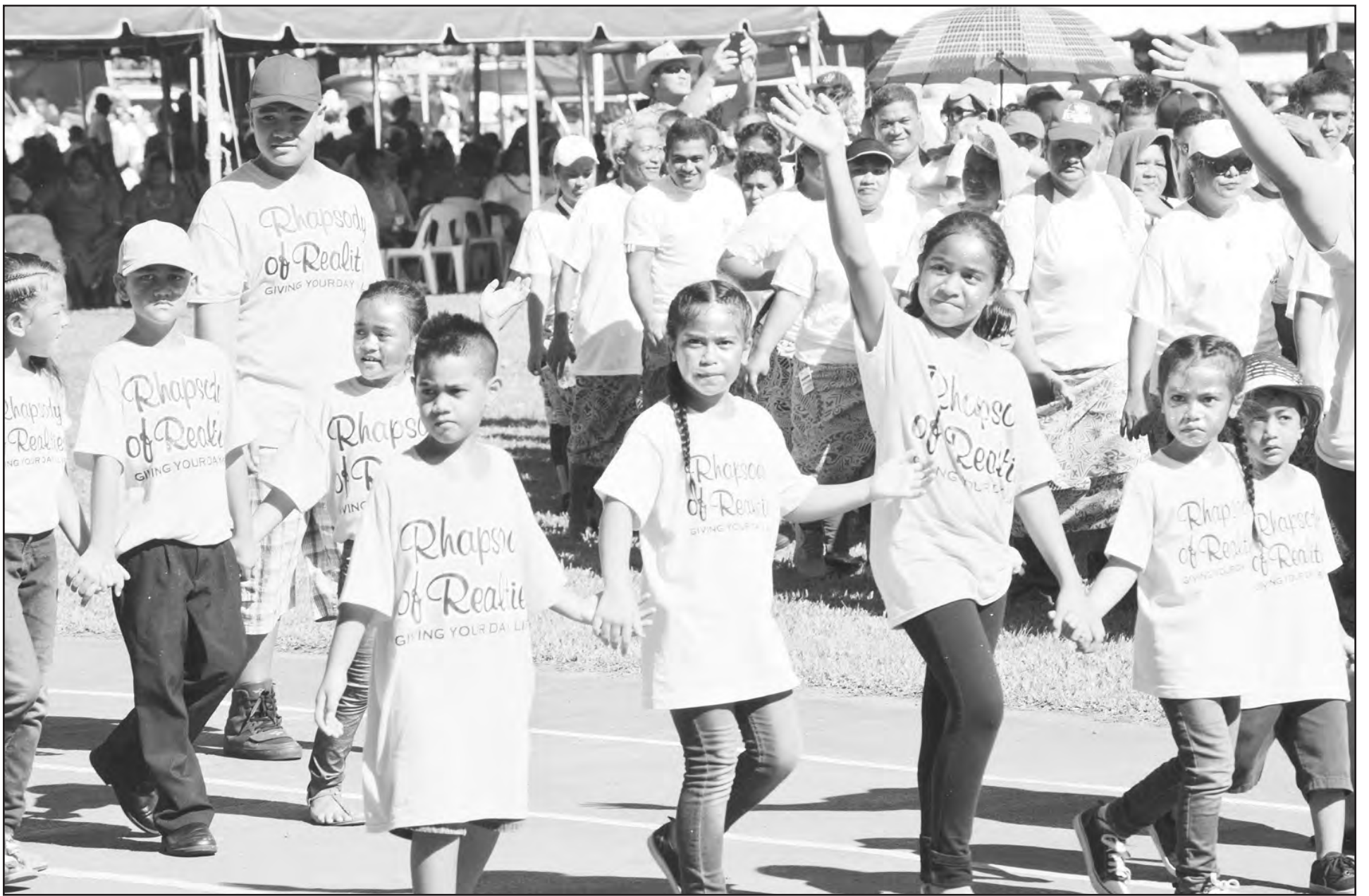
Se vaaiga i fanau laiti sa fai lo latou sao i le taimi o le solo o savali fa'aaloalo o le fu'a a le atunu'u, lea na fa'amanatuina i le aso Gafua na te'a nei.