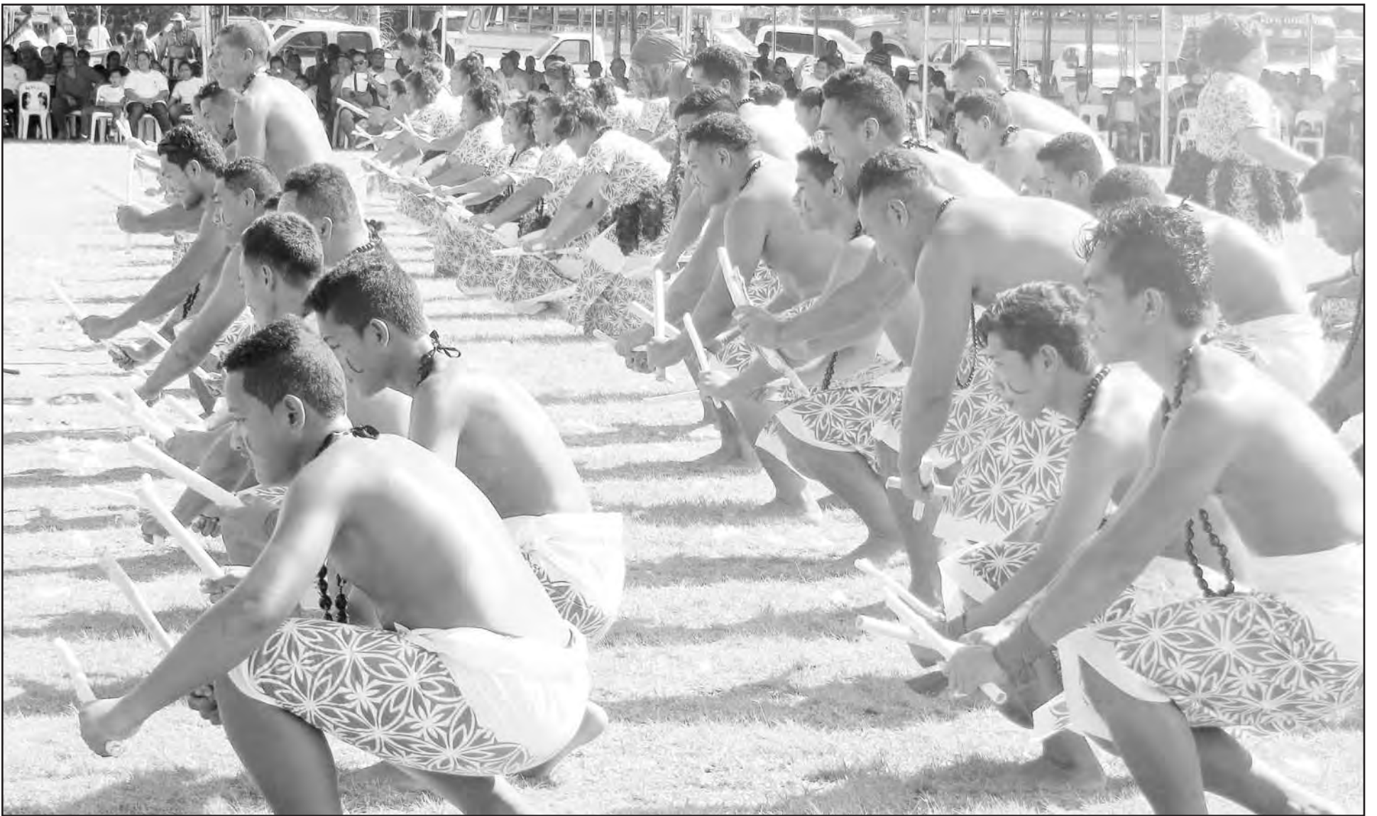
O se vaaiga i tama o le au siva mai Sapunaoa i Samoa fa'afiafia i le sisigafu'a o lenei tausaga i le aso Gafua.