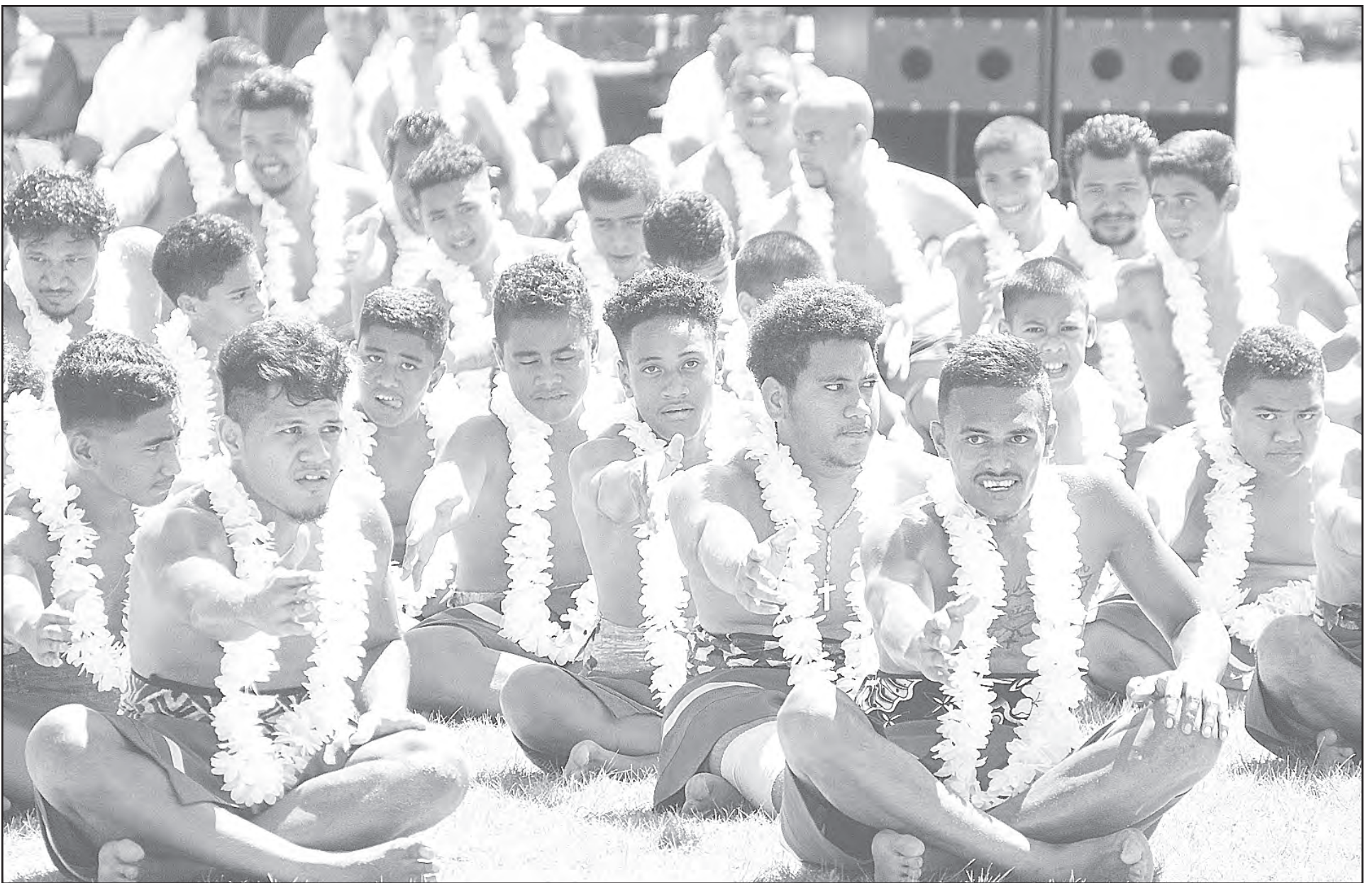
Youth members of the Catholic Church during the traditional 'siva sasa' performance at yesterday's 2017 Flag Day celebration at Veterans Memorial Stadium.