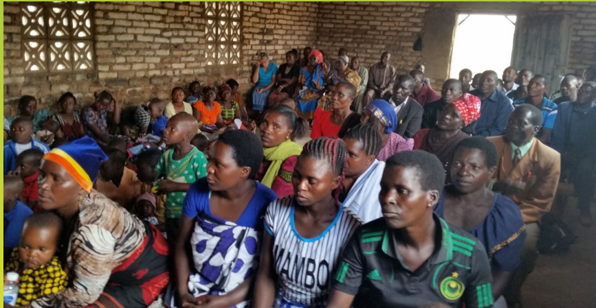
A Full House at Vwawa. There were even ladies having to sit on the floor. It is amazing the hunger to hear the Word!

This month we continued our week-end seminars by going to Vwawa on September 23-24. This is the congregation where one of the first year Swahili students preaches. It was a great seminar with 9 congregations represented. As always, we got more requests for future seminars than we are able to immediately fill. We did make a commitment to go to the main congregation in Mlowo on October 28-29. Then we will probably be going to Tunduma on the Zambia boarder after we get back in January.