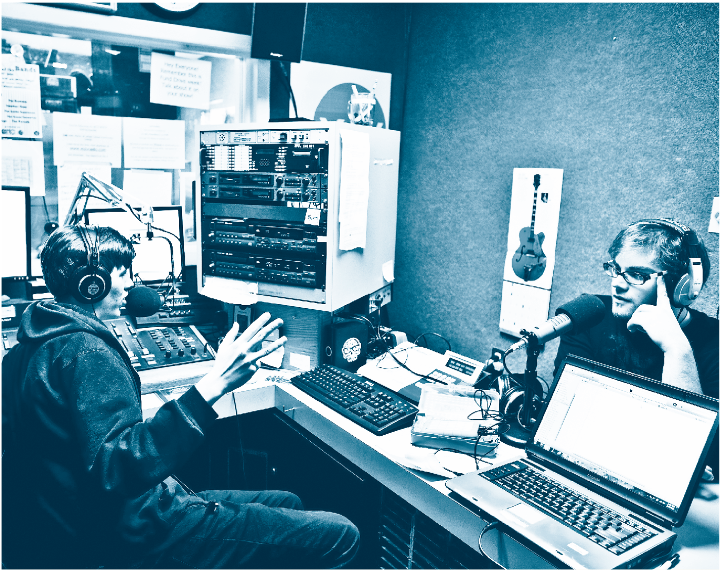
Canada a community radio station on the air live.

some countries are still required to adhere to laws pertaining to the origin and nature of content.