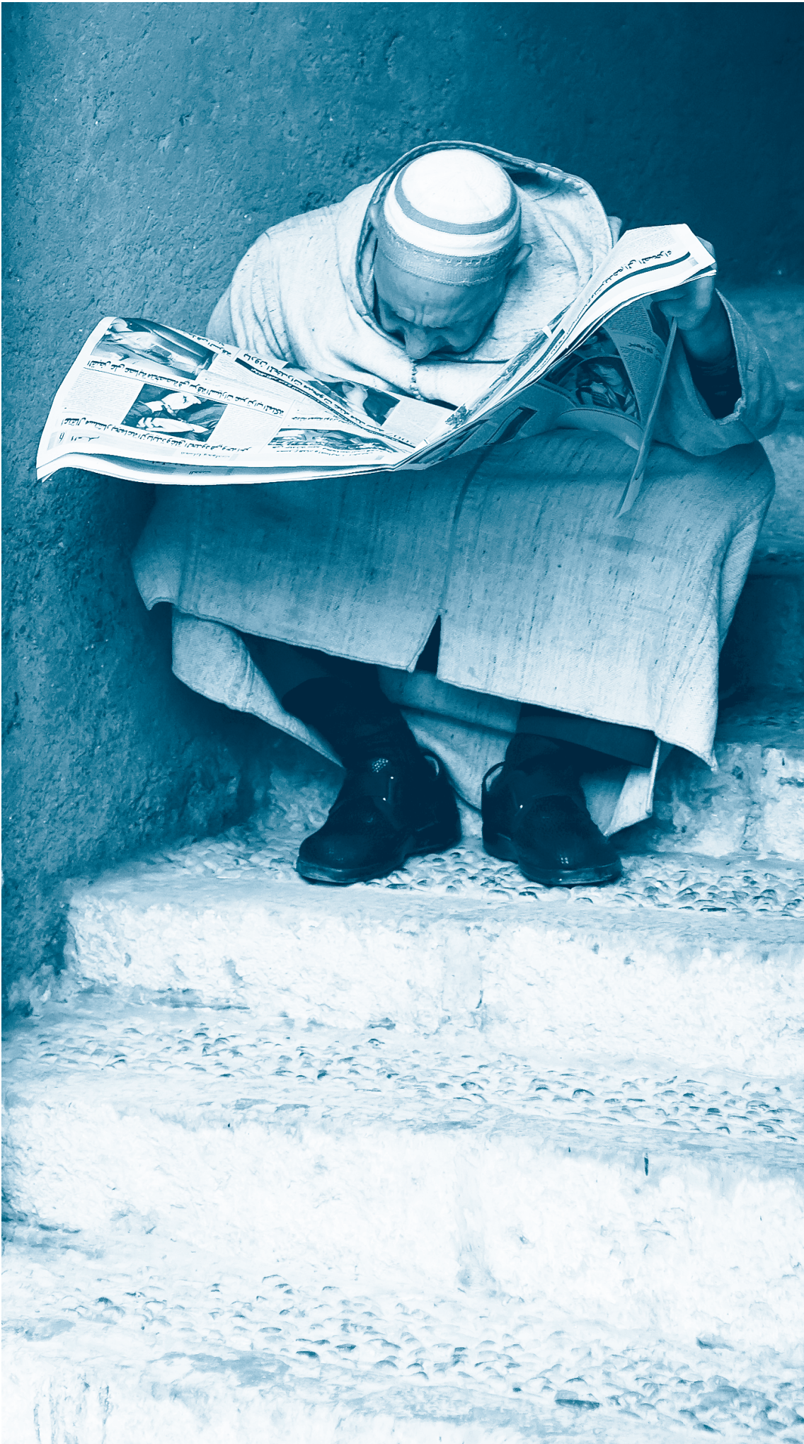
Old man reading newspaper in Morocco.