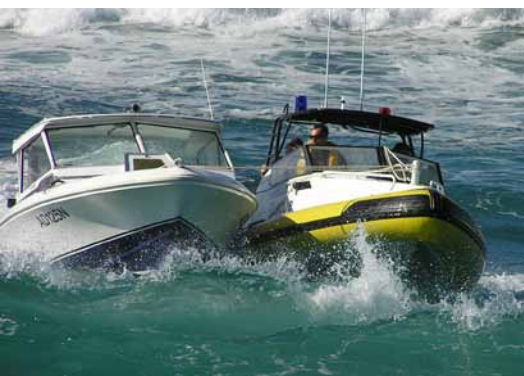
Rescue One bringing back another breakdown safely across the bar

After the loss of a young boy's life in 1994, the Shire Mayor called a meeting to form a marine rescue organisation. At the time, the only rescue craft available was a three-metre rubber duck that was so small there was no room to carry a third person without