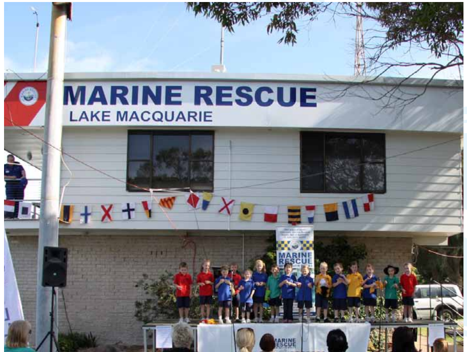
One of the many school groups performing for visitors at the Open Day