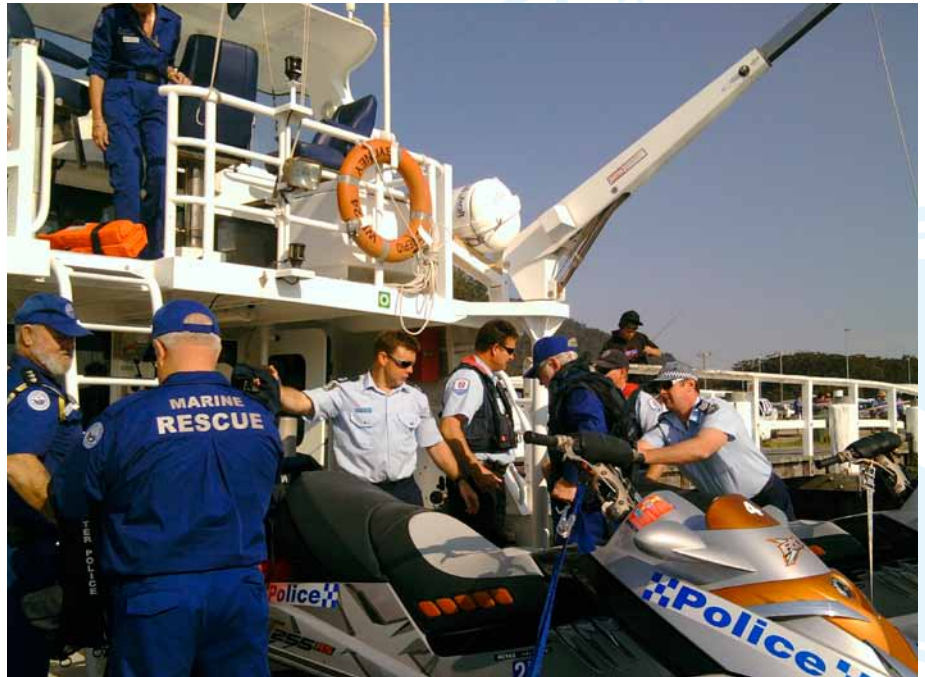
Preparations for Camden Haven SAREX on MAC vessel 'Intrepid'

A team from 723 Squadron, HMAS Albatross and the Royal Australian Navy, outlined helicopter support services accessed through AMSA in Canberra.