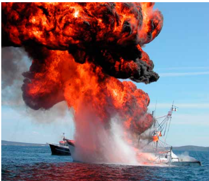
Wave Rider erupts in a huge explosion