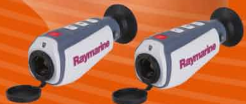
TH24 240 X 180 RESOLUTION