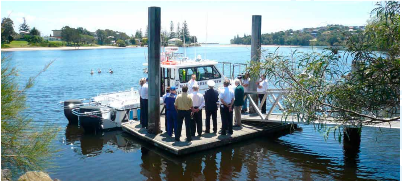
The official party gathers for the blessing of Evans Head 30 (see p6)