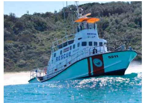
‘Encounter’ close inshore to retrieve dead whale for its last journey