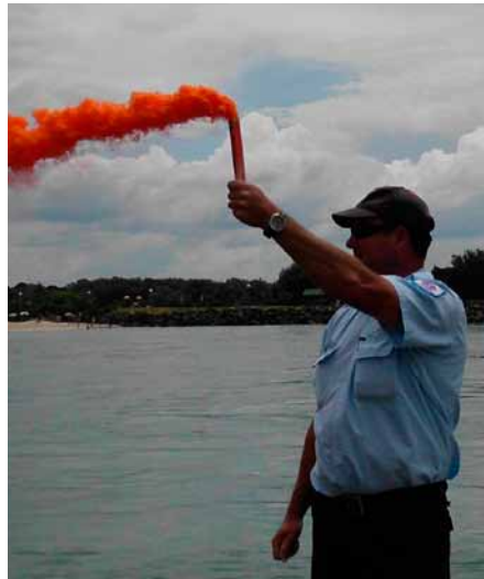
The correct use of flares is critical in an emergency

Planning is under way for the Unit's public open day in January, which will include informative presentations on Marine Rescue services, the safety benefits and procedures for logging on and logging off,