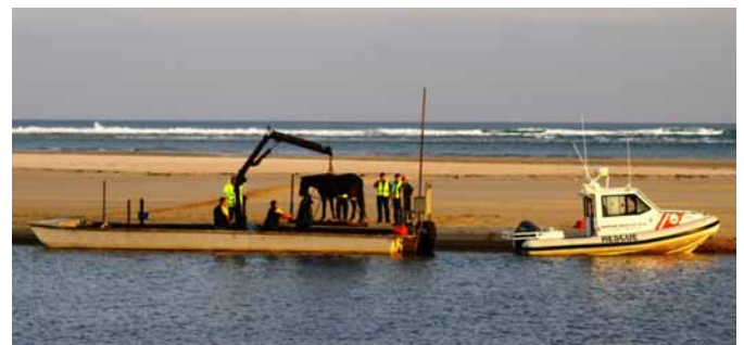
Rescued runaway racehorse being loaded onto oyster punt