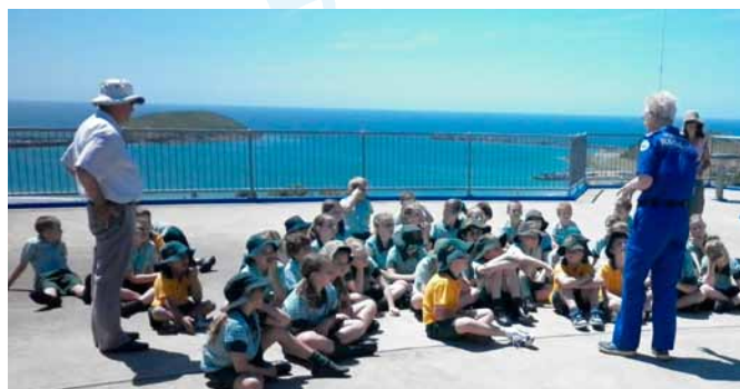
Visiting Year 3 primary school students on the Coffs Harbour base roof and viewing platform

Members of Marine Rescue Coffs Harbour have worked hard in the lead-up to the annual peak boating season to improve their base on Beacon Hill. The unit has overcome a lack of storage space with a smart set of built-in cupboards and a movable storage cabinet, both very generously provided by a local firm, Infracraft Pty Ltd.