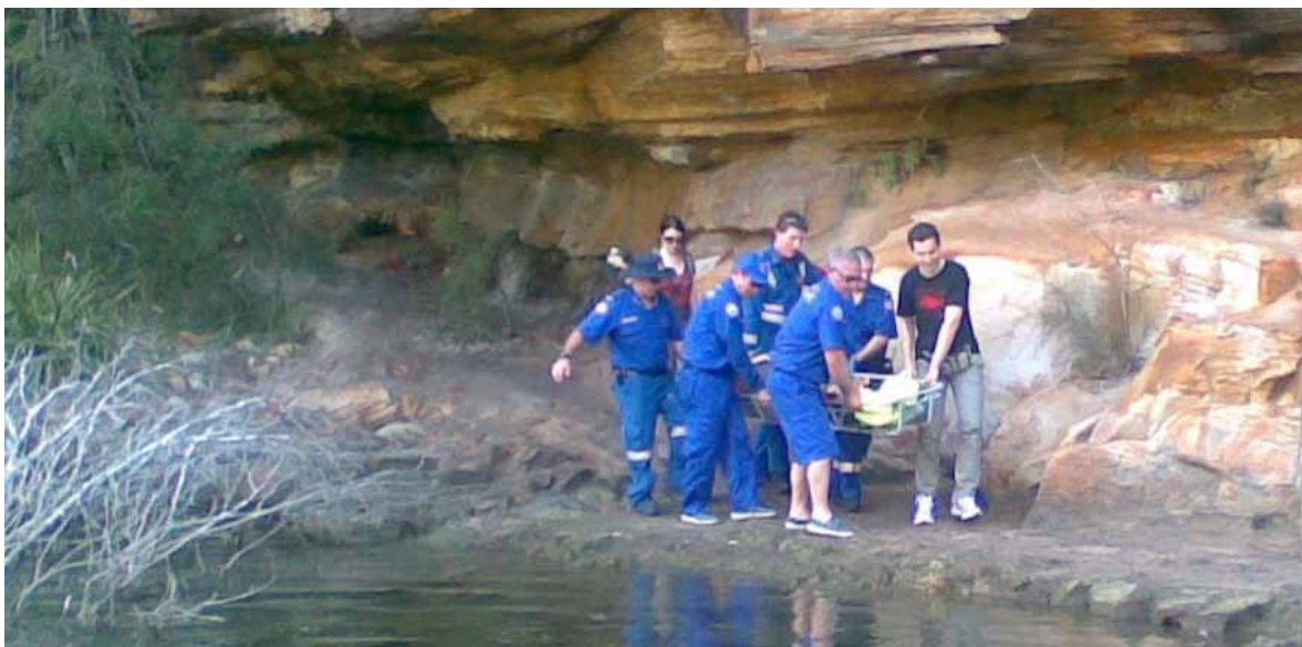
MR Cottage Point members bring an injured bushwalker to safety from the upper reaches of Cowan Creek