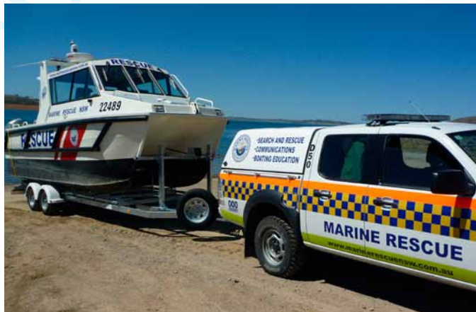
Preparing for a training session on the Alpine Lakes