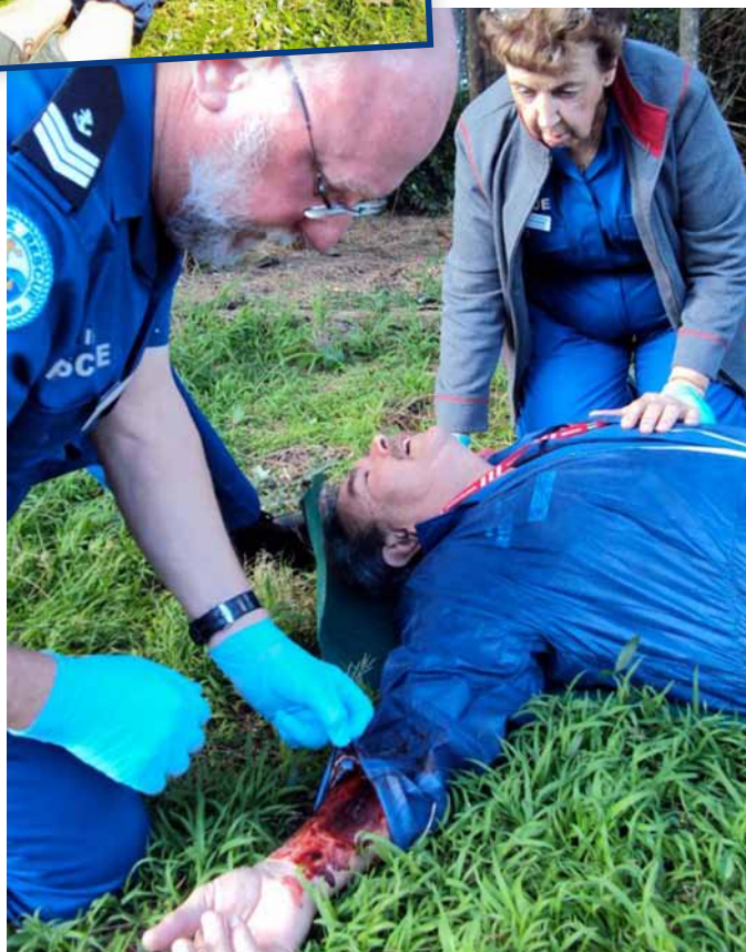
Realistic training aids prepare first aiders for real emergencies