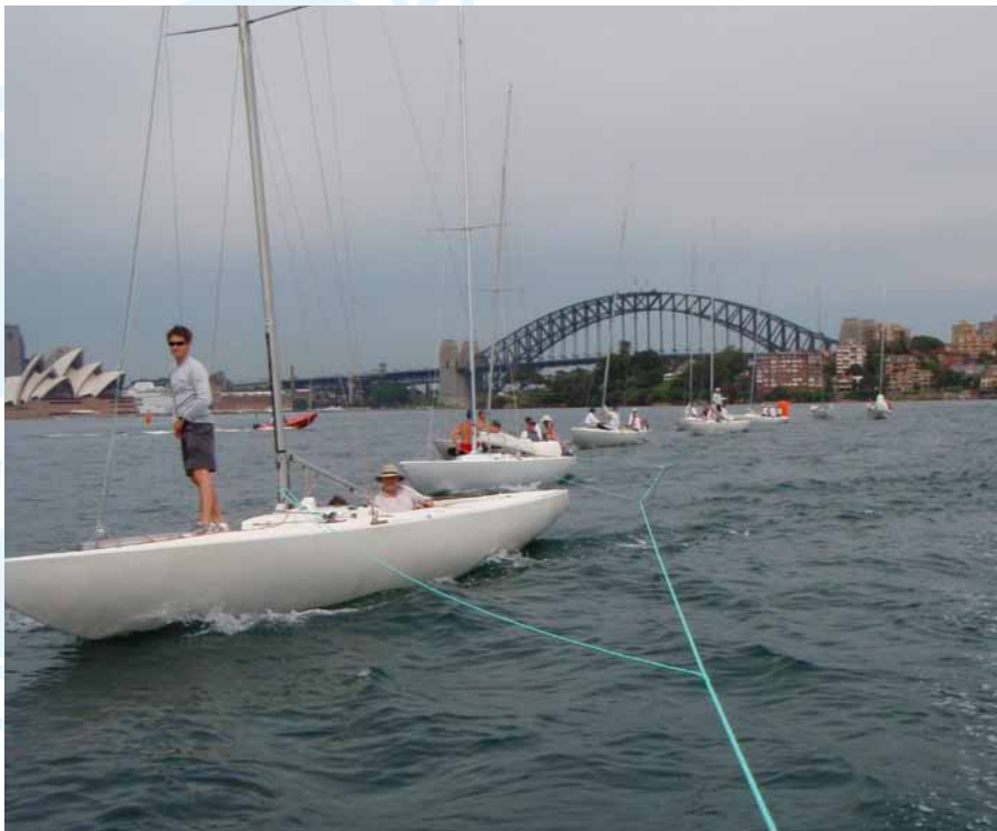
Starboard tow line with one quarter of the fleet of Etchells heading for the starting zone