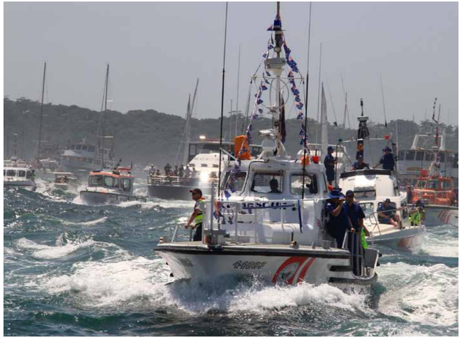
Crowd control for hundreds of private boats as they all try to get close to the action