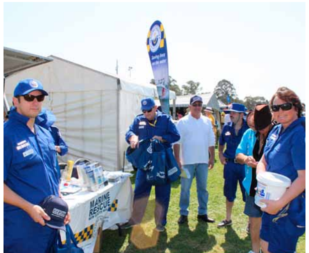
MR Botany Bay at Lugarno Lions Spring Festival