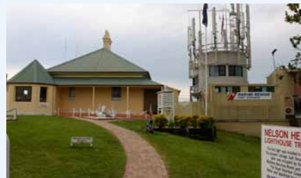
MR Port Stephens on its historical site at Nelson Head

In such circumstances it isn't difficult to acknowledge dedicated volunteers, many of whom have placed their own safety at risk to complete a successful mission.