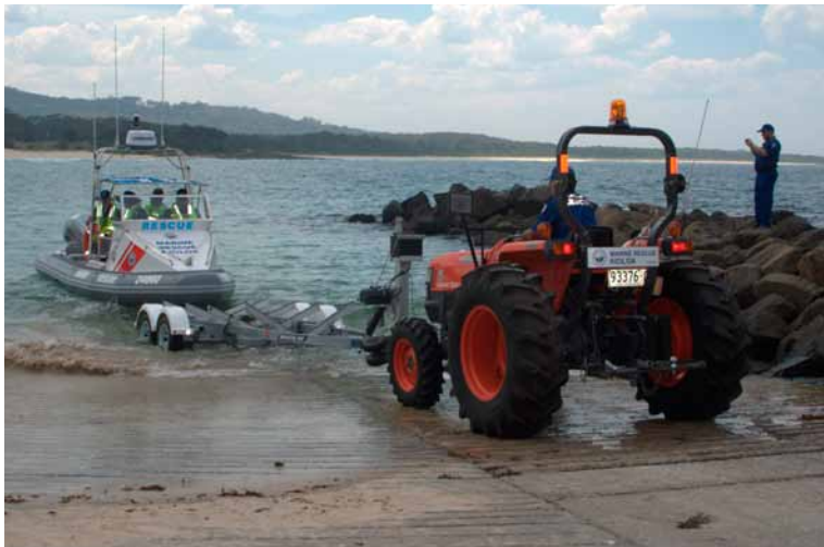
Launching Kioloa 20 with the unit's new Kubota tractor