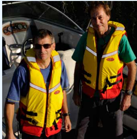
Lifejackets save lives - wear them

Unfortunately, in the five months from June to October this year, 11 people drowned in six separate boating accidents in NSW, leaving grieving families and friends asking "Why?".