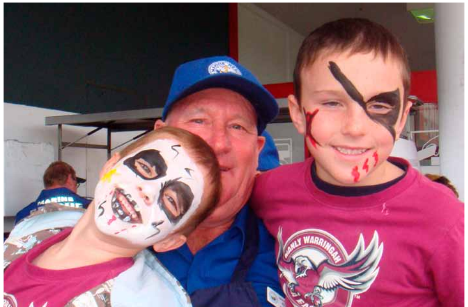
Local kids get into the colourful spirit of the fundraising day

A public holiday Monday at Bunnings is always a busy place to be and this day was no exception. Just about every member of