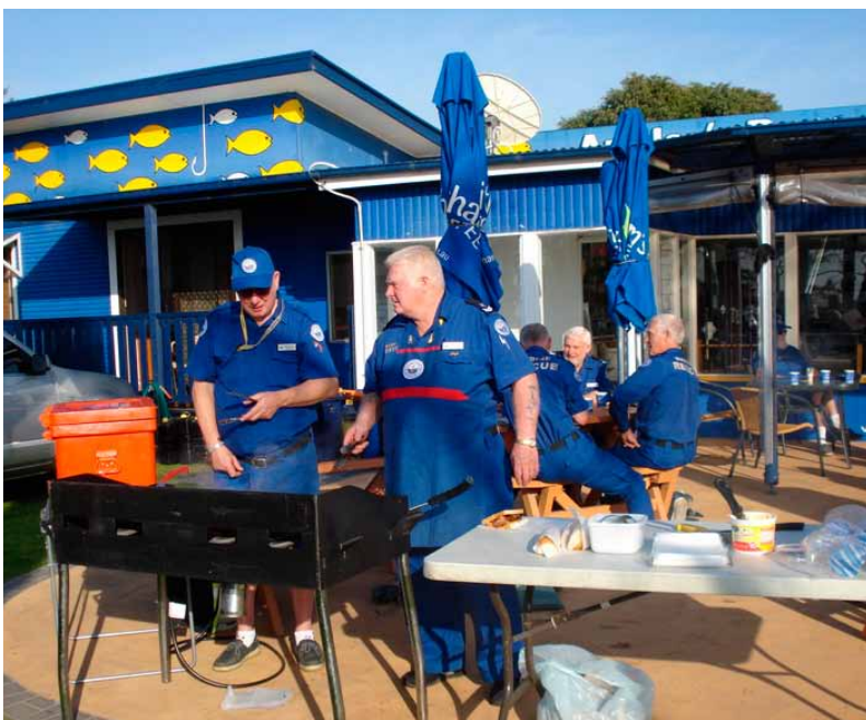
The BBQ was sizzling when MR Port Kembla members cooked breakfast for participants in the SAREX at Greenwell Point